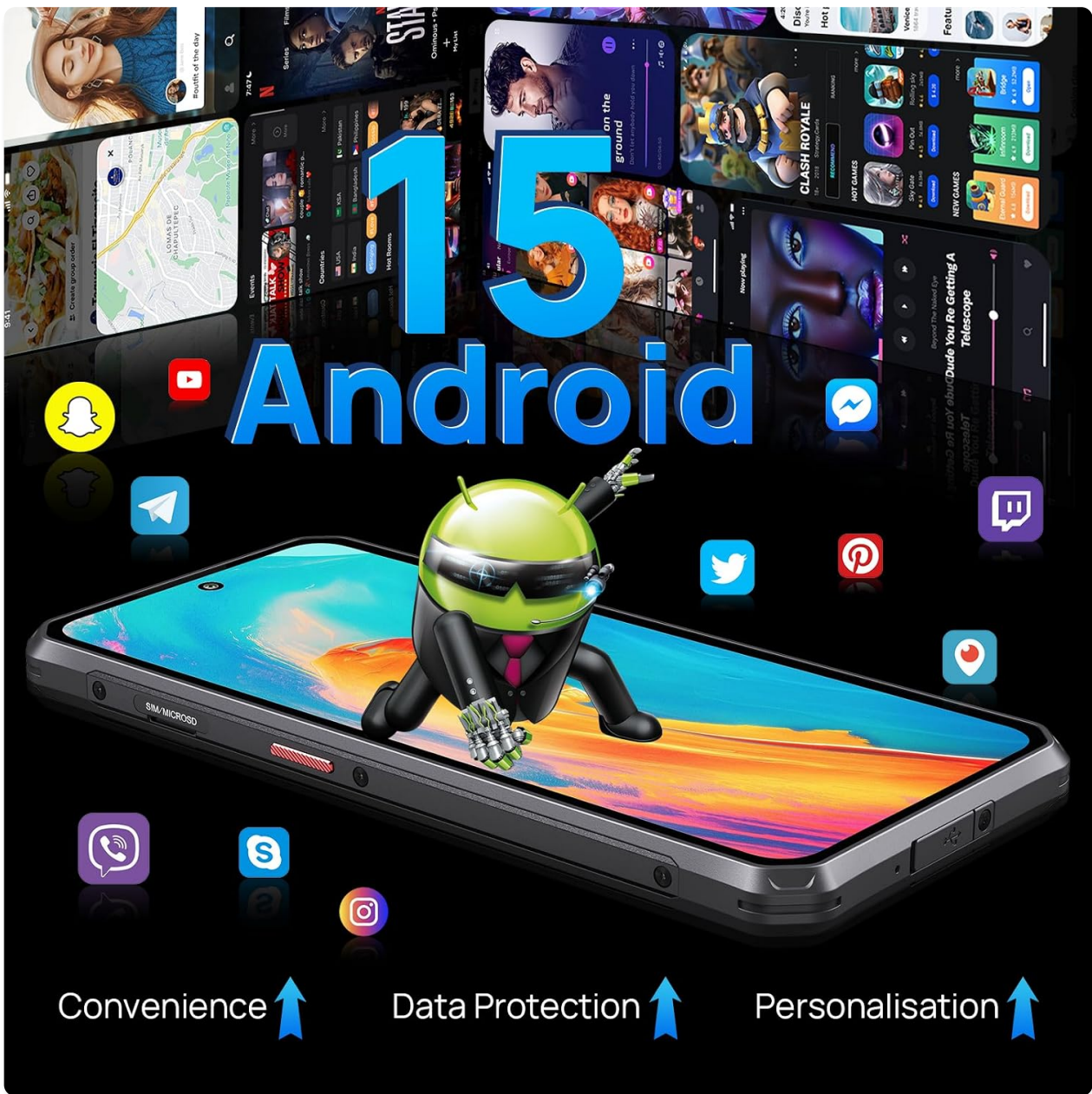
Image: A visual representation of the FOSSIBOT F114 running on the Android 15 operating system, highlighting convenience, data protection, and personalization.