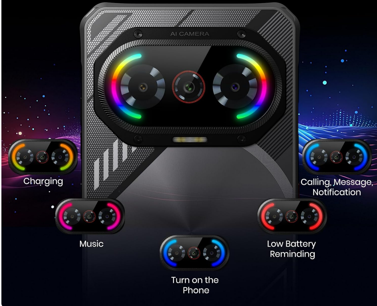
Image: The FOSSIBOT F114's vibrant dynamic lighting feature, indicating charging, calls, messages, notifications, music, and low battery status.