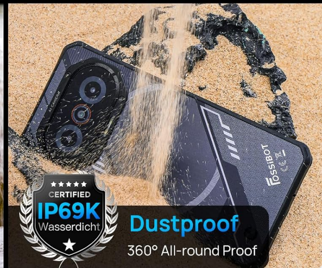
Image: Visuals demonstrating the FOSSIBOT F114's IP68/IP69K waterproof and dustproof ratings, and MIL-STD-810H drop resistance.