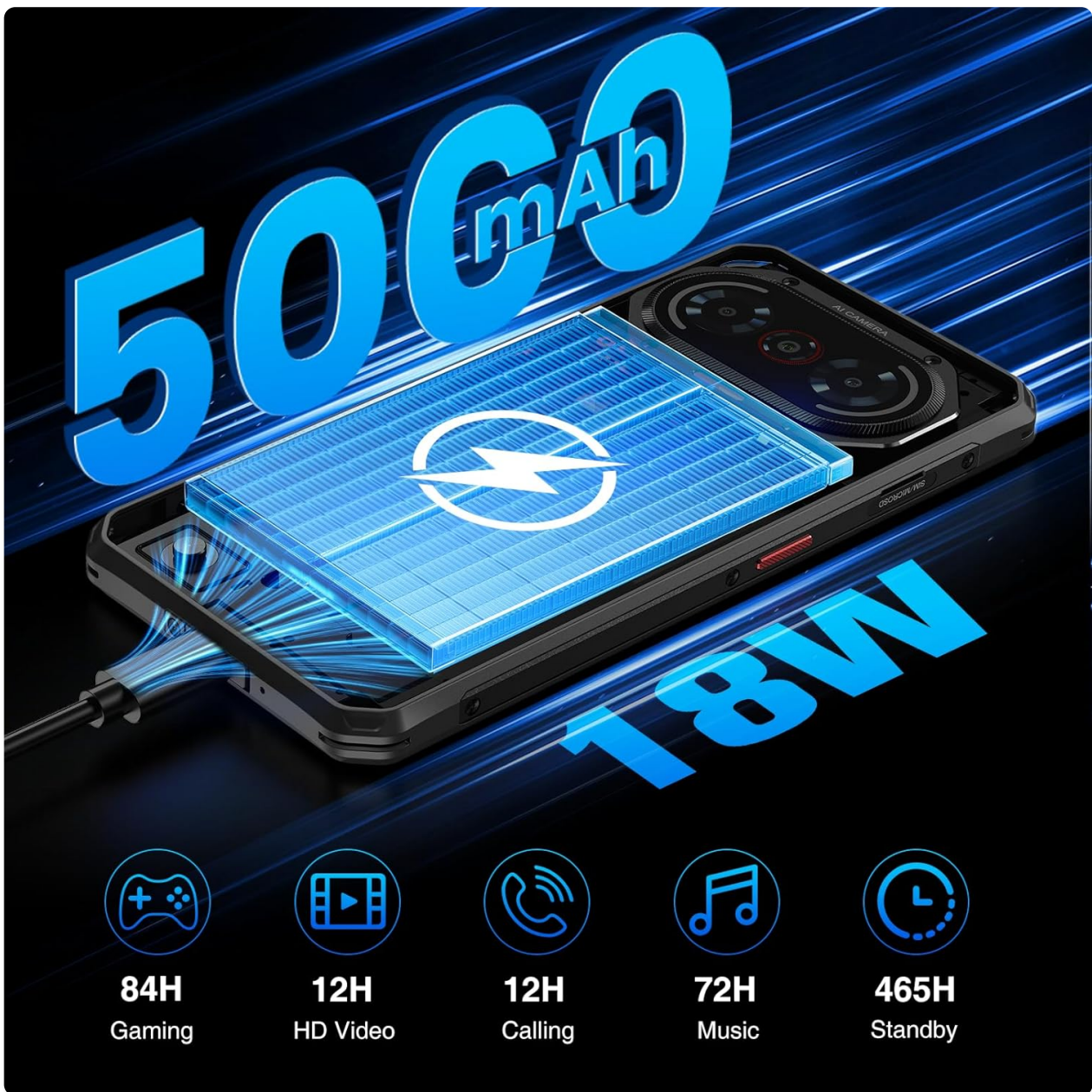
Image: Illustration of the FOSSIBOT F114's 5000mAh battery and 18W fast charging feature.