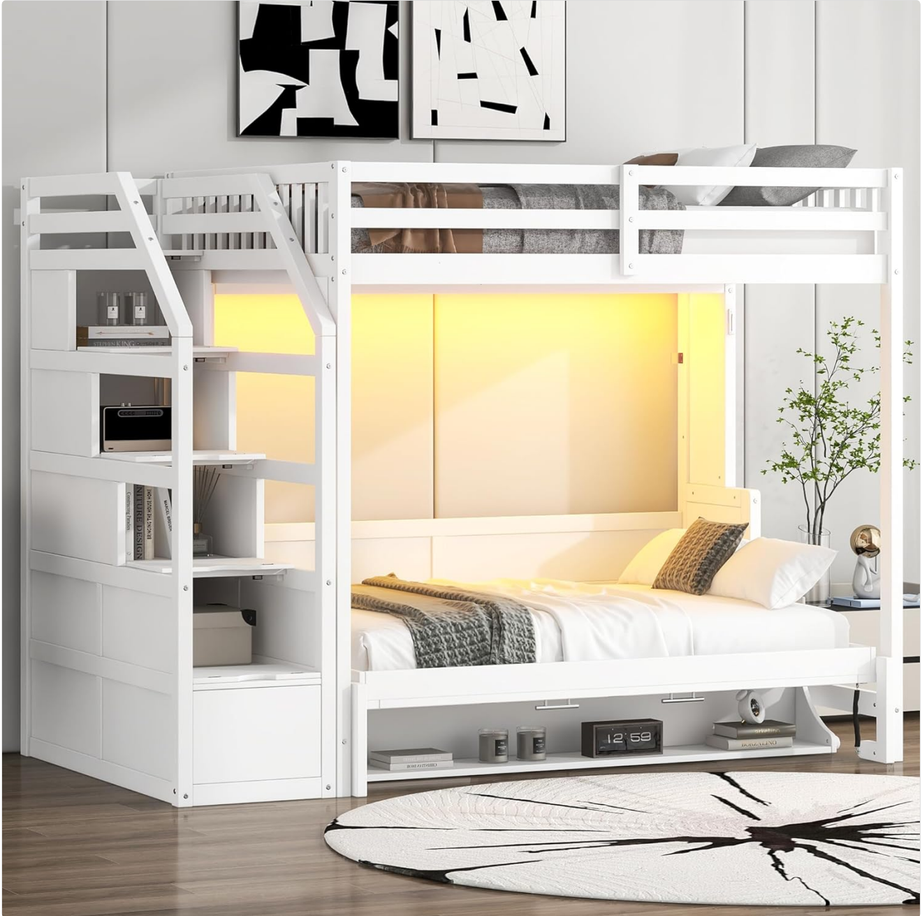
Figure 3: The Murphy bed extended, with the integrated LED light illuminated in a warm tone.

When the Murphy bed is folded, the integrated desk becomes accessible for use.