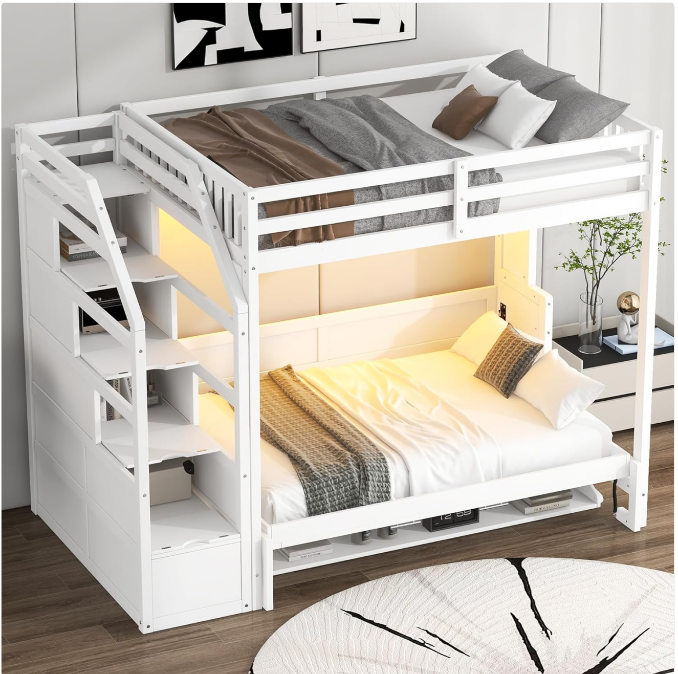
Figure 1: Fully assembled LUMISOL Full XL Loft Bed with Murphy Bed.