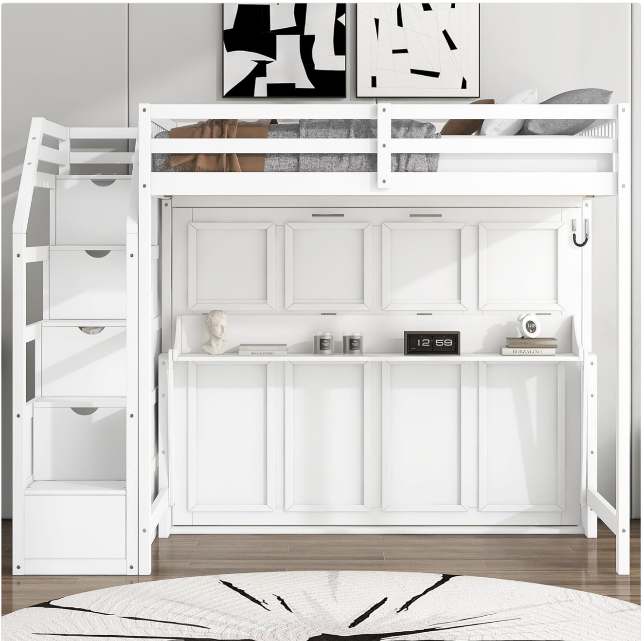
Figure 2: The Murphy bed in its folded, cabinet configuration, revealing the integrated desk.