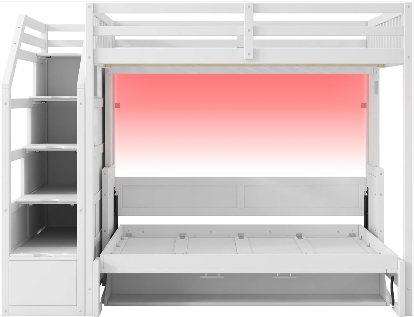
Figure 5: The Murphy bed extended, with the integrated LED light illuminated in red.