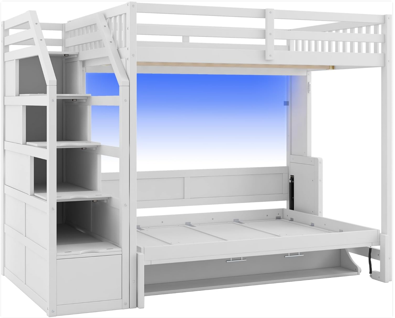
Figure 4: The Murphy bed extended, with the integrated LED light illuminated in blue.