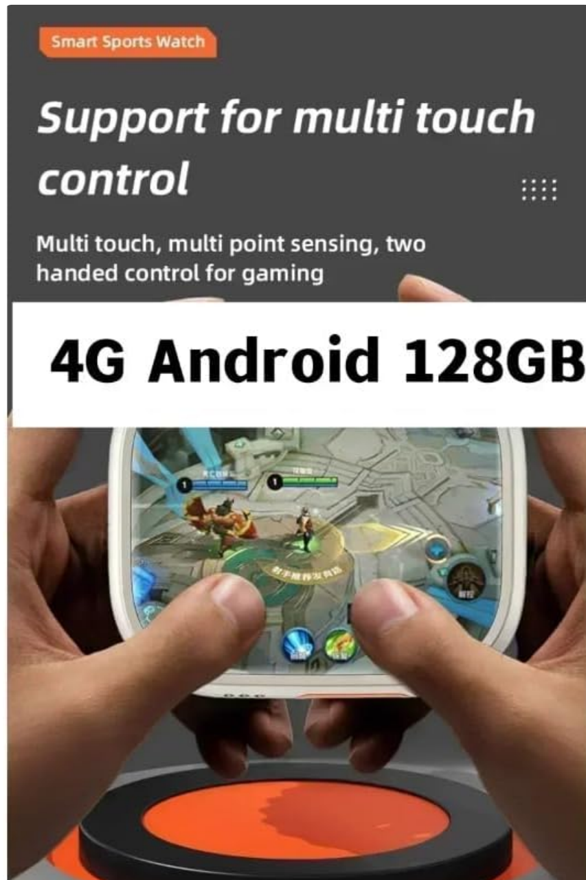
Image: The JINSHANGZI CDS10 Smartwatch demonstrating multi-touch control during a gaming application.