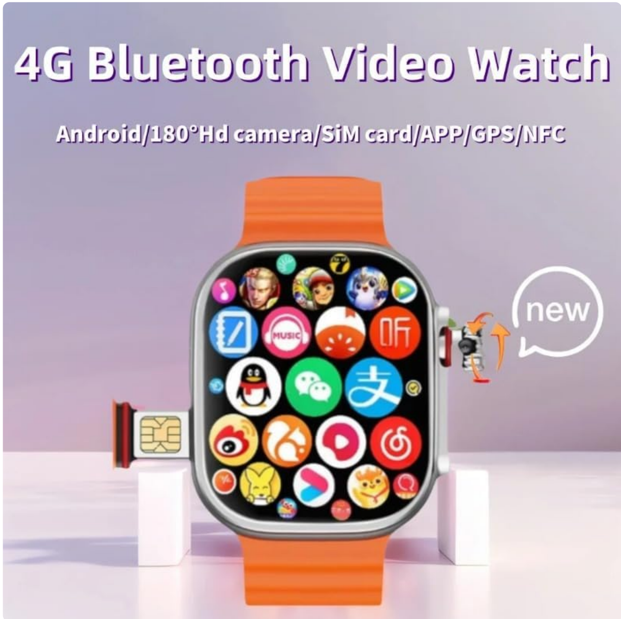
Image: The JINSHANGZI CDS10 Smartwatch displaying its SIM card slot and interface.