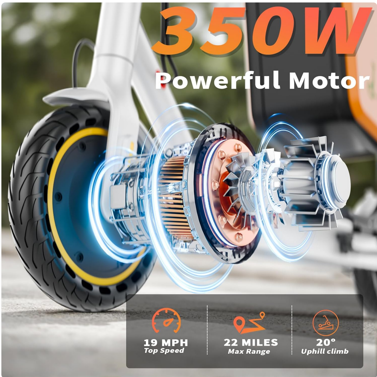
Figure 1.1: Overview of the Qlaway K078L Electric Scooter.