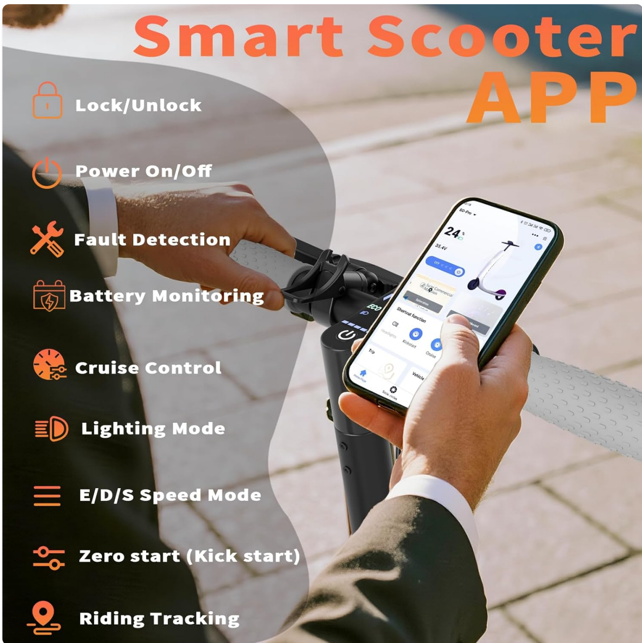
Figure 4.2: Smart Scooter App Interface for comprehensive control.