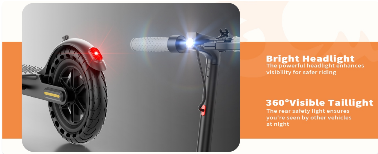
Figure 4.1: Scooter Lighting System for visibility.

The scooter includes a bright front headlight and a 360° visible taillight for night riding safety. The taillight also functions as a brake light. A bell is integrated into the handlebar for alerting pedestrians and other riders.