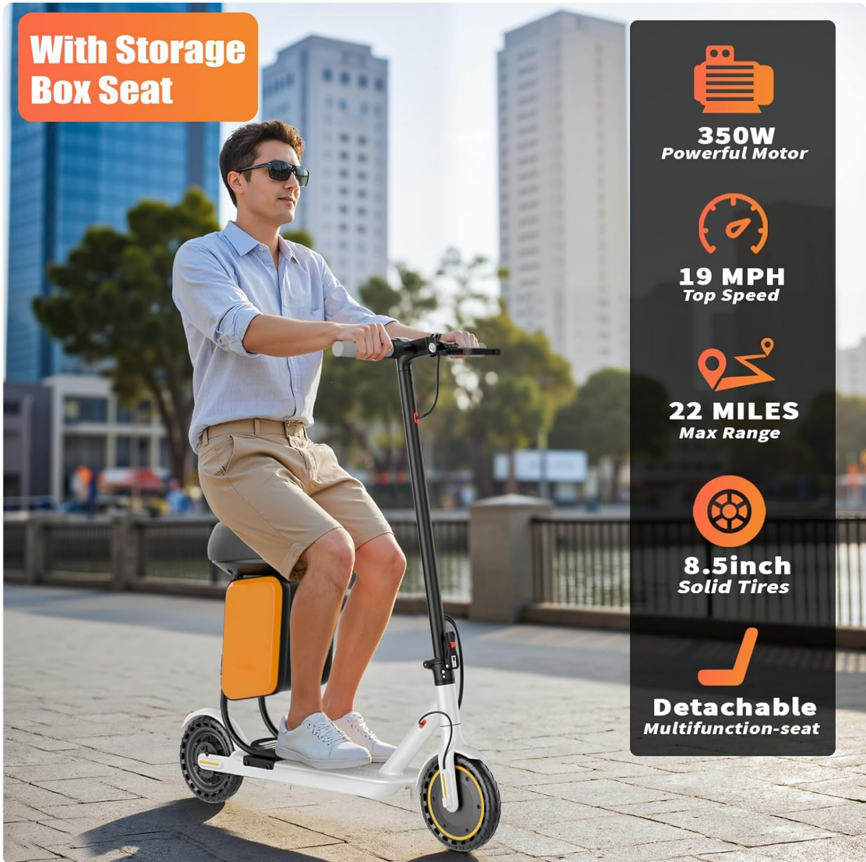
Figure 3.1: Qlaway K078L Electric Scooter with optional luggage seat.