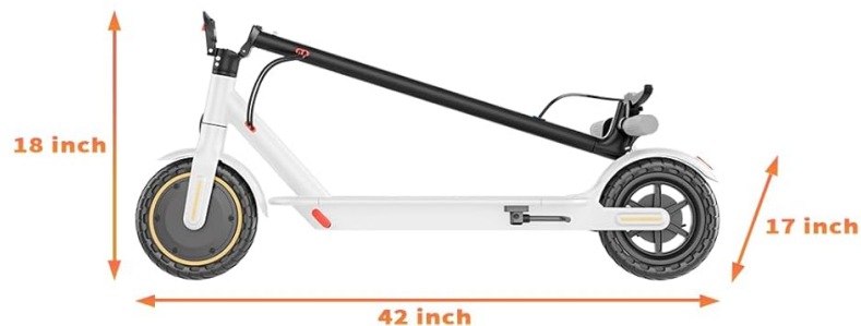
Figure 7.1: Folding the Scooter for Portability in 3 easy steps.