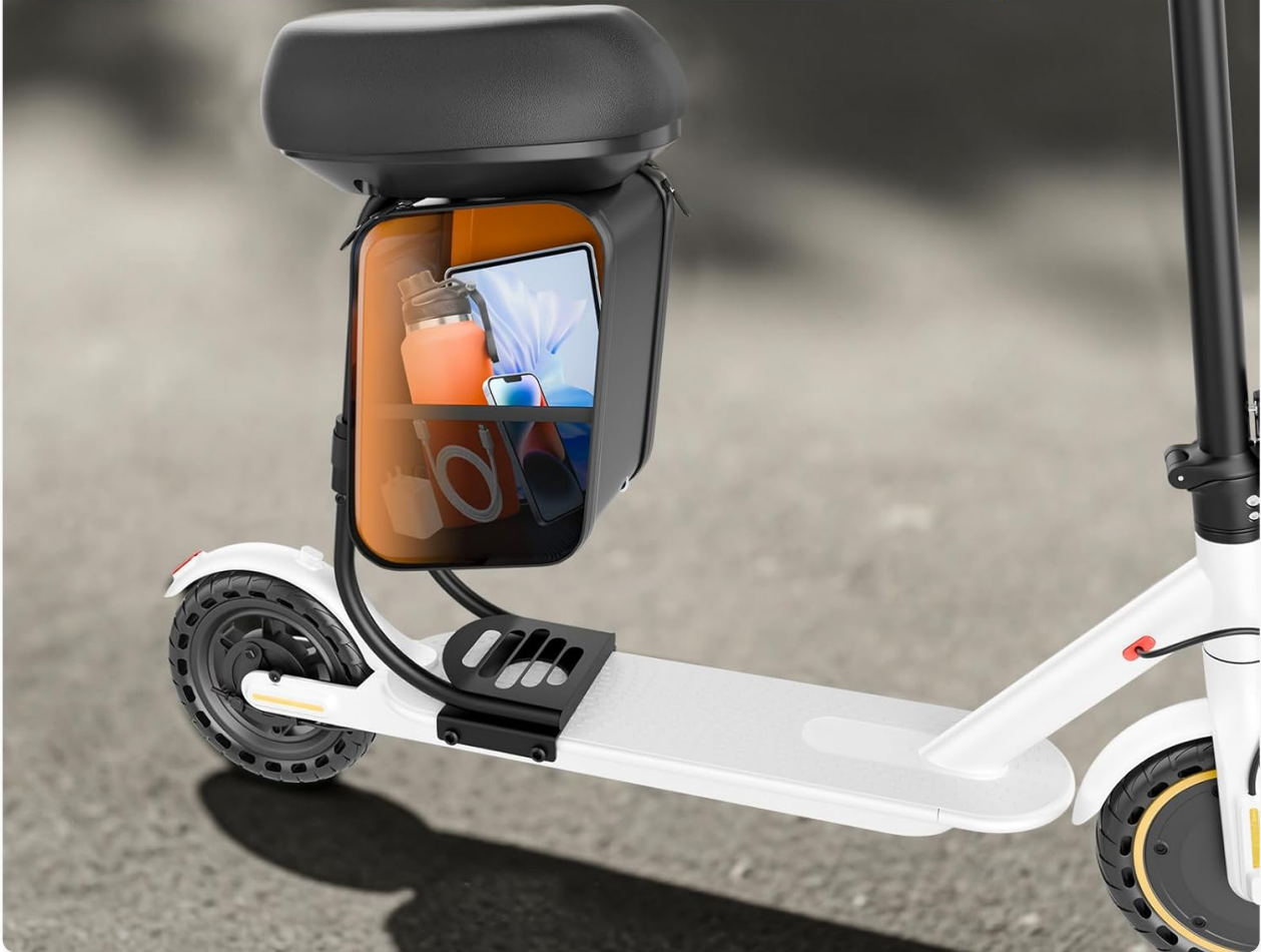
Figure 3.2: 11L Seat-Storage Box for convenience.