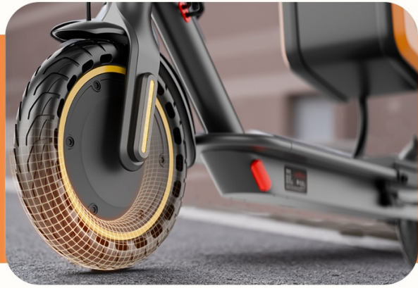
Figure 6.1: Maintenance-Free Solid Tires with honeycomb vibration reduction technology.