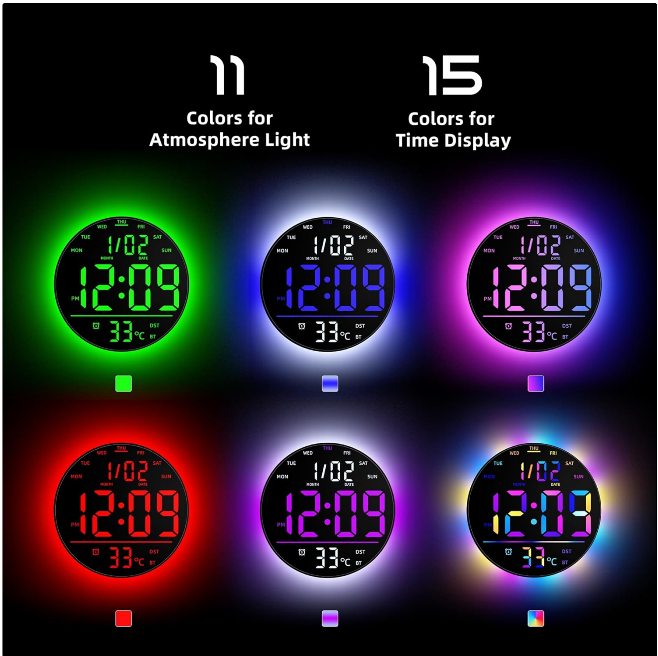
Figure 6.4: Color Options. This image displays various color combinations for both the atmosphere light and the time display, showcasing the 11 atmosphere light options and 15 time display colors.