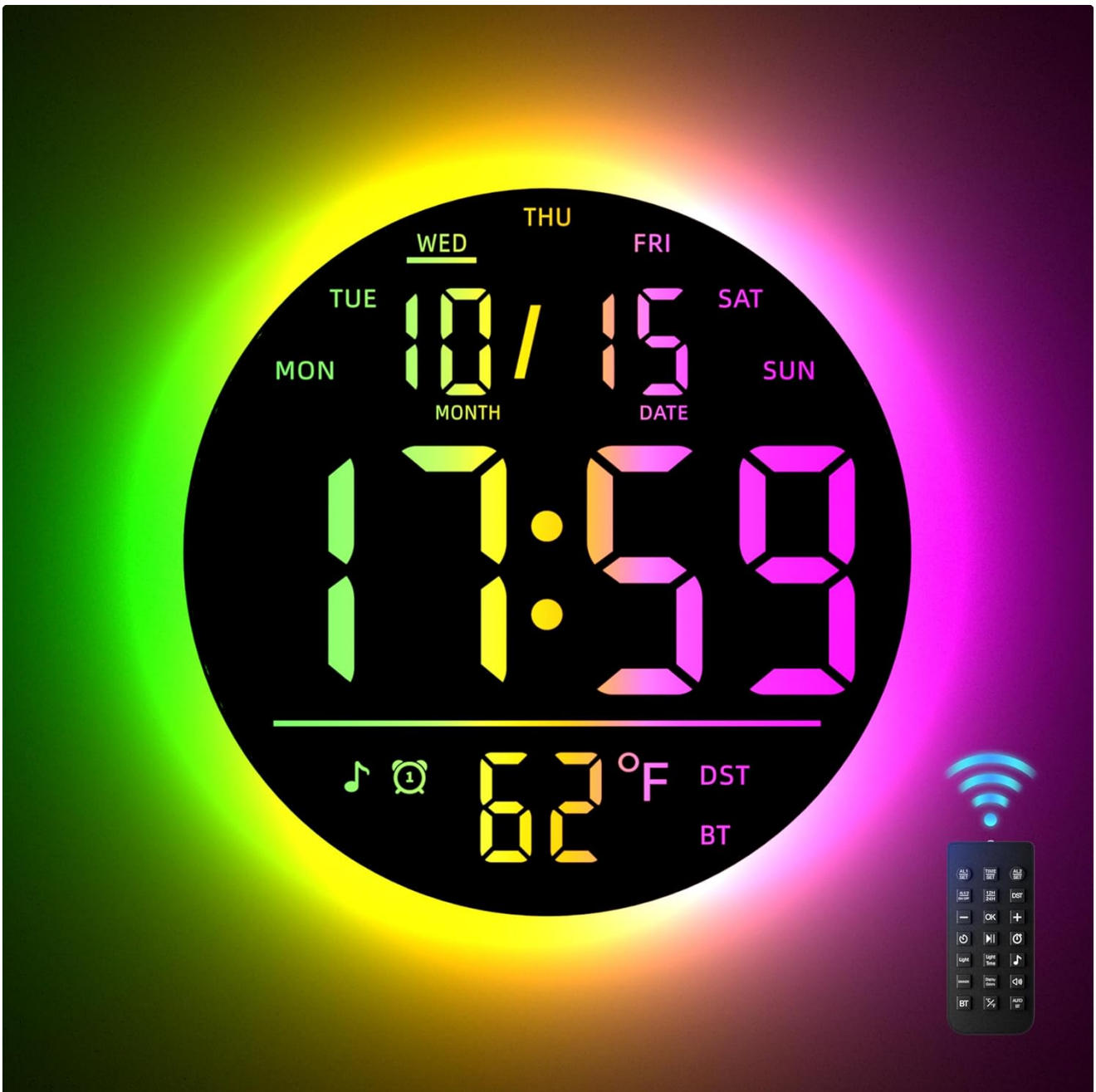
Figure 1.1: EASYERA 10-inch Digital Wall Clock with Remote Control. This image shows the clock's display with time, date, temperature, and Bluetooth indicator, alongside its dedicated remote control.