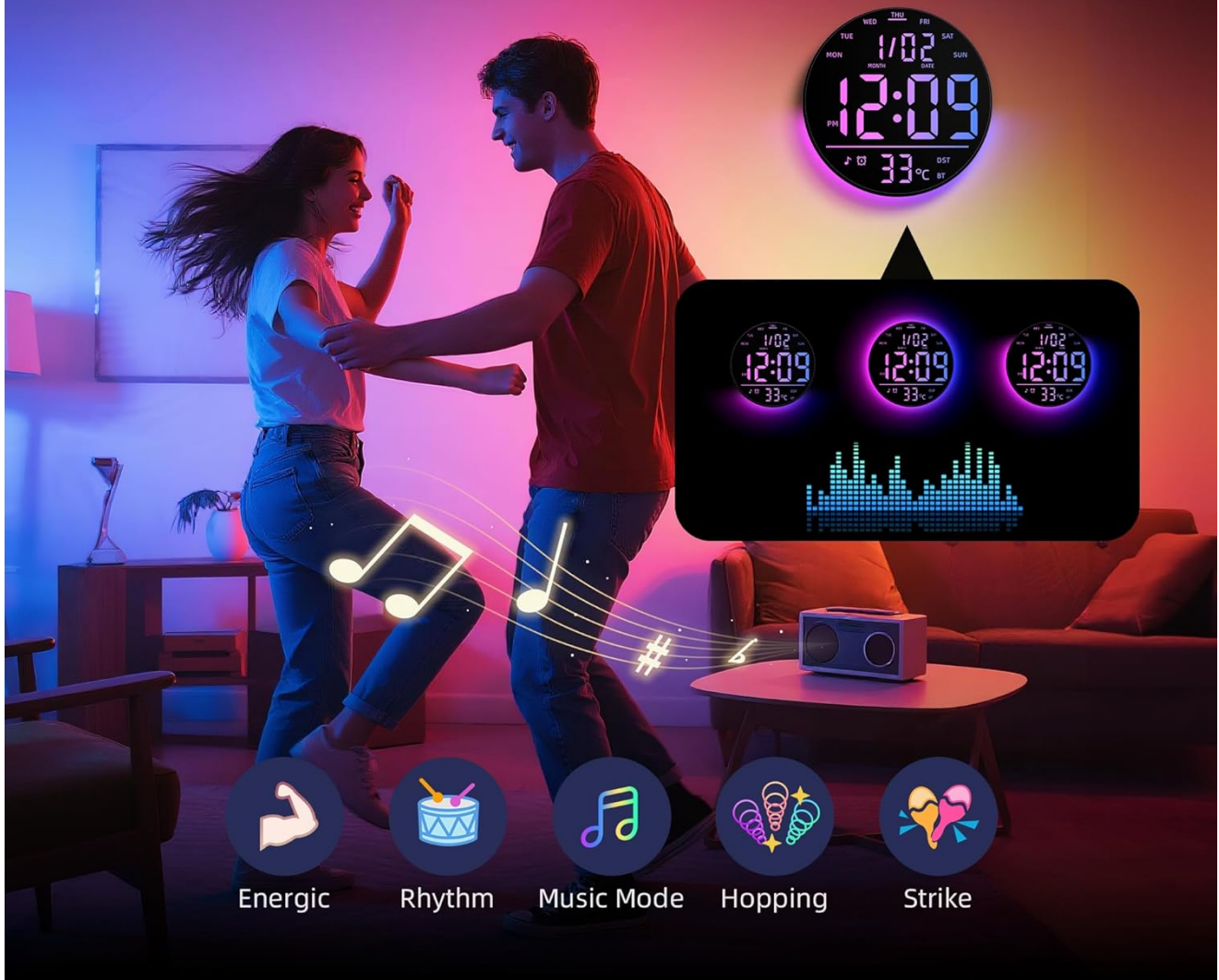
Figure 6.5: Music Rhythm Lighting in Action. This image shows the clock's backlight dynamically responding to music, creating an immersive atmosphere.

The world's first 360° RGB wall clock that dances to the rhythm