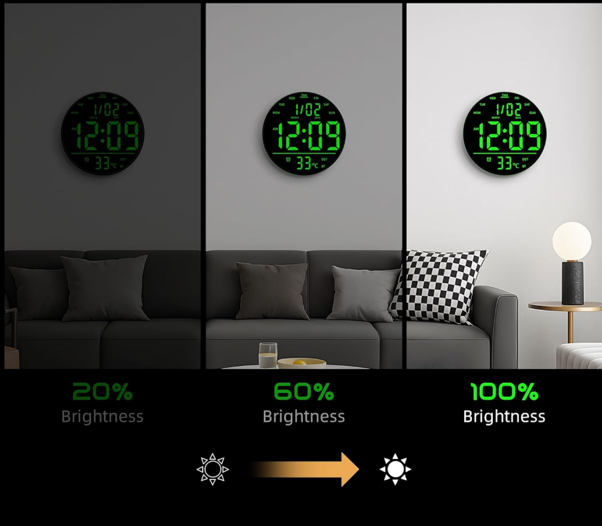
Figure 6.3: Auto Dimming Mode. This series of images demonstrates the clock's automatic brightness adjustment from 20% to 100% based on ambient light.

Always the Right Brightness, Day or Night