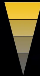
Figure 6.2: Brightness Adjustment Levels. This image details the 10 levels of adjustable backlight brightness and 4 levels of front display brightness.