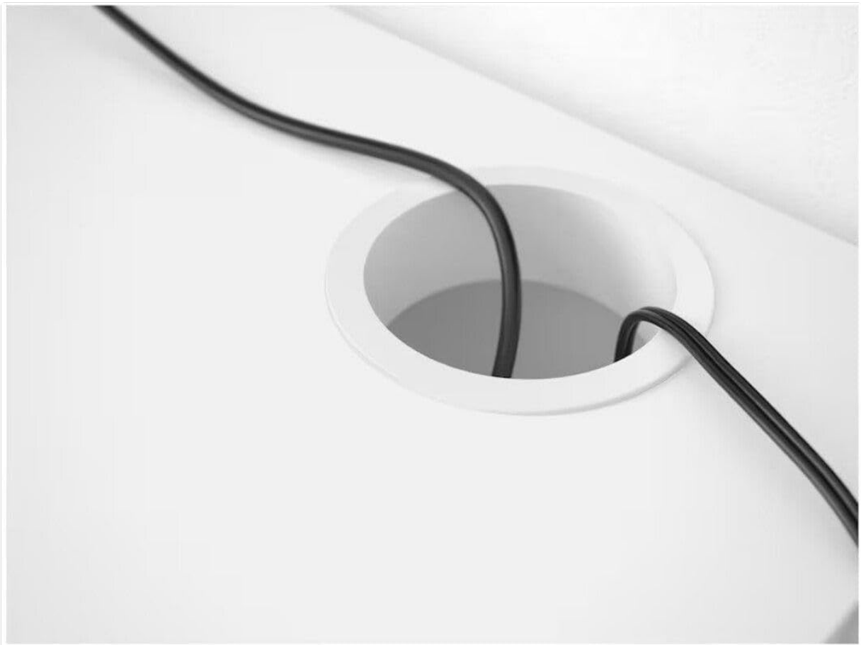
Image 2.3: Detail of the cable management port on the desktop, designed to route power cords and cables efficiently.