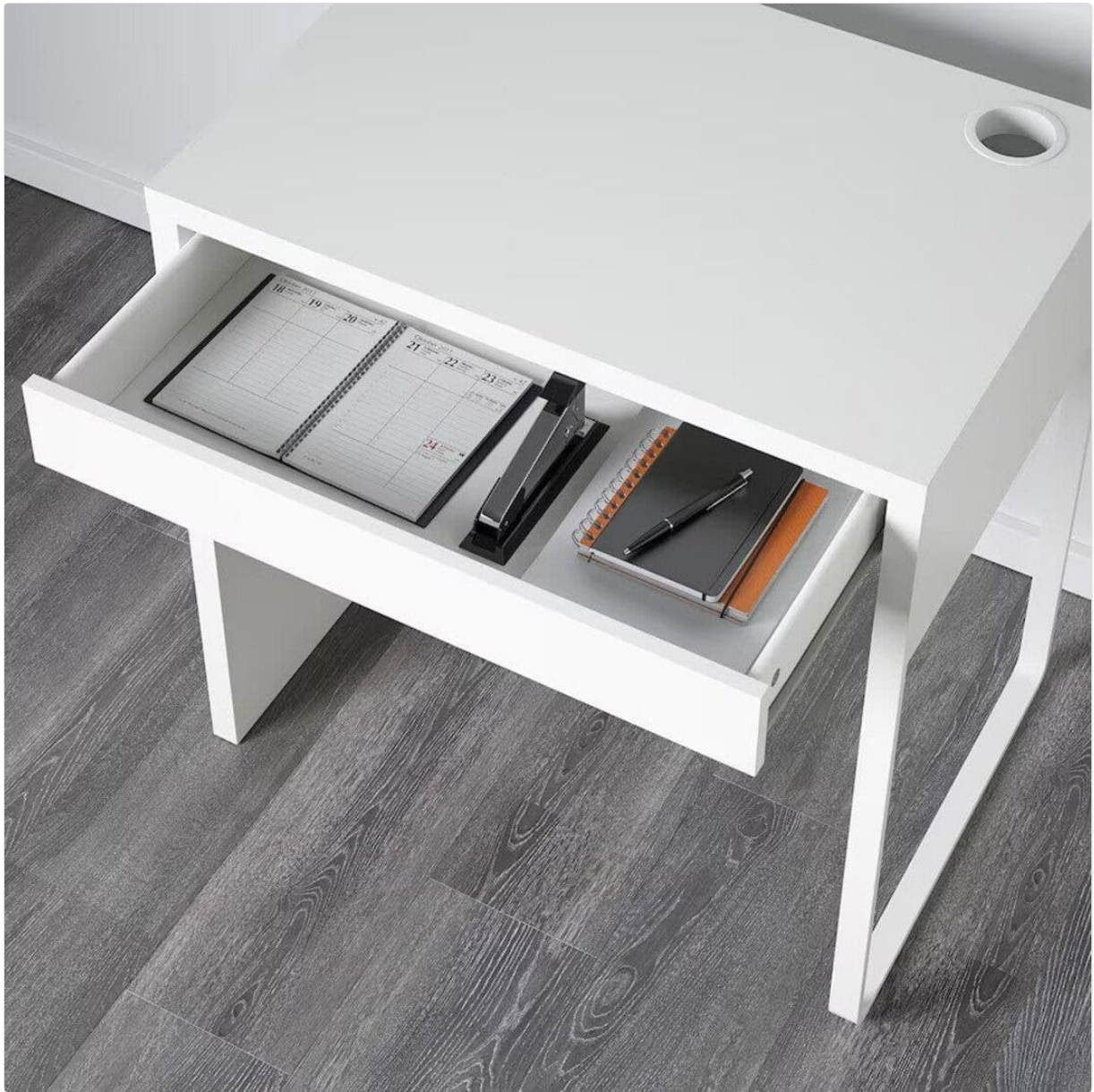
Image 2.2: Close-up view of the desk's drawer, illustrating its storage capacity for office supplies.