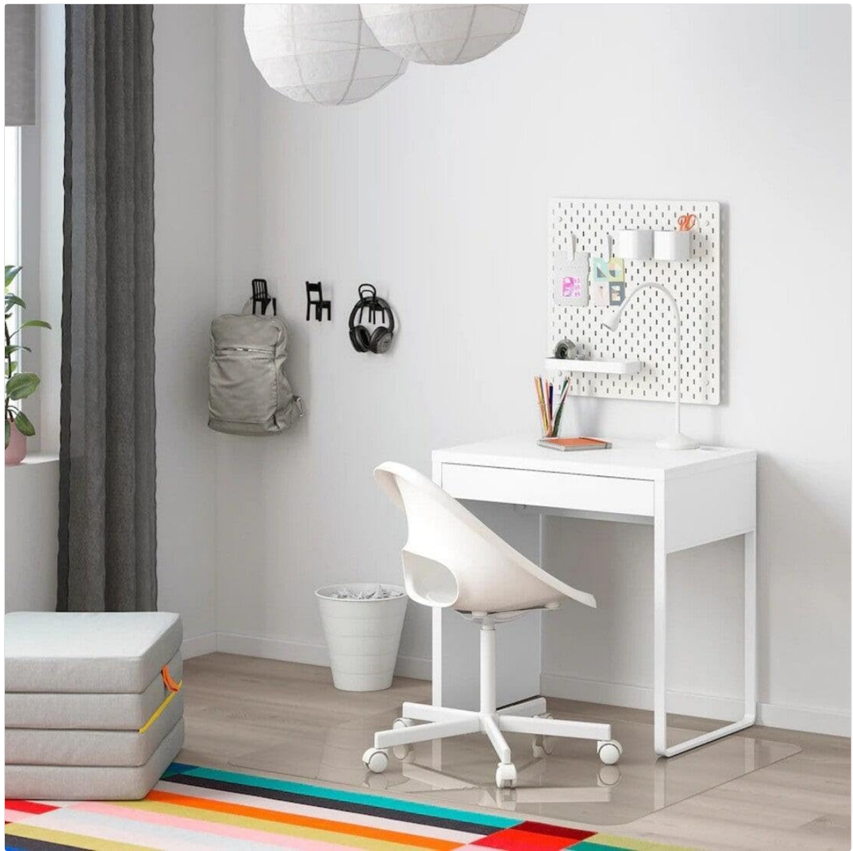
Image 2.1: The IKEA Micke Desk in a typical room setup, showcasing its compact design and clean aesthetic.