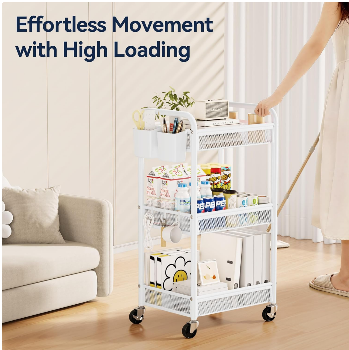
Image: A person effortlessly moving the YASONIC 3 Tier Rolling Cart, demonstrating its smooth mobility even when fully loaded.