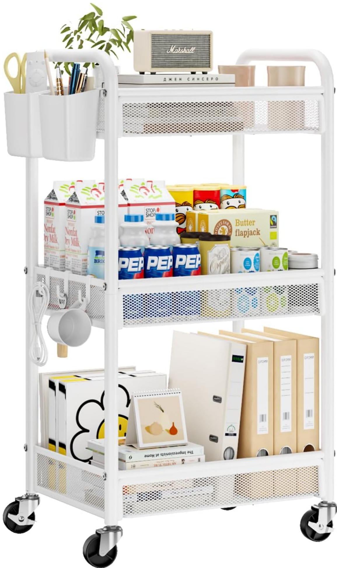
Image: The YASONIC 3 Tier Rolling Cart in white, showcasing its three mesh baskets filled with household and office supplies, along with hanging cups and hooks.