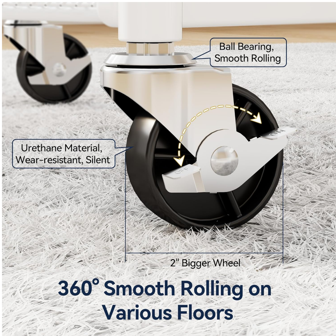
Image: A detailed view of the cart's 2-inch heavy-duty wheel, highlighting its ball bearing for smooth rolling and wear-resistant urethane material for silent operation on various floors.