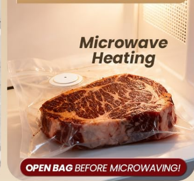
Figure 2: Included BPA-free vacuum sealer bags.