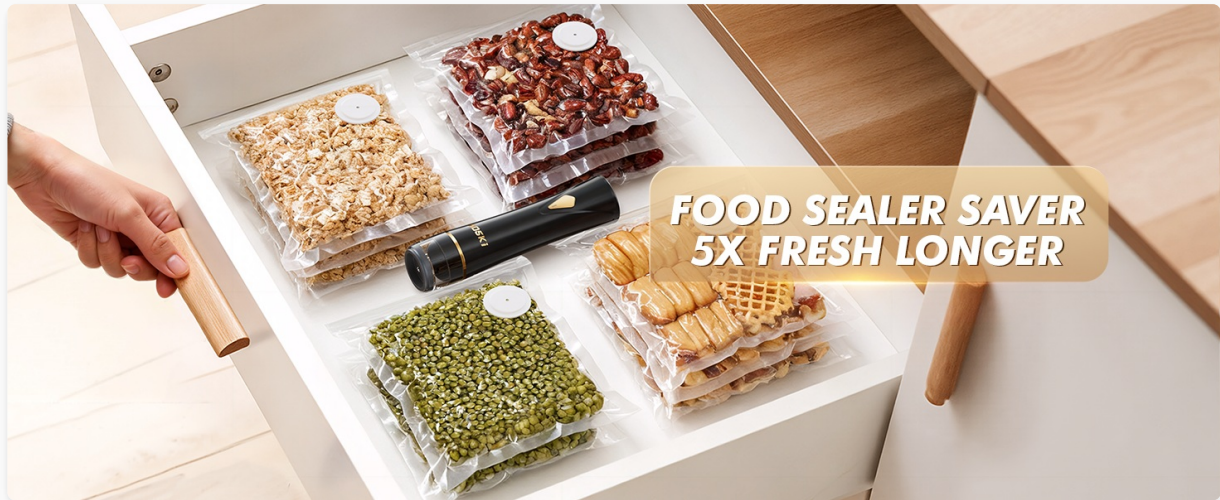
Figure 3: Visual guide for preparing and sealing food.