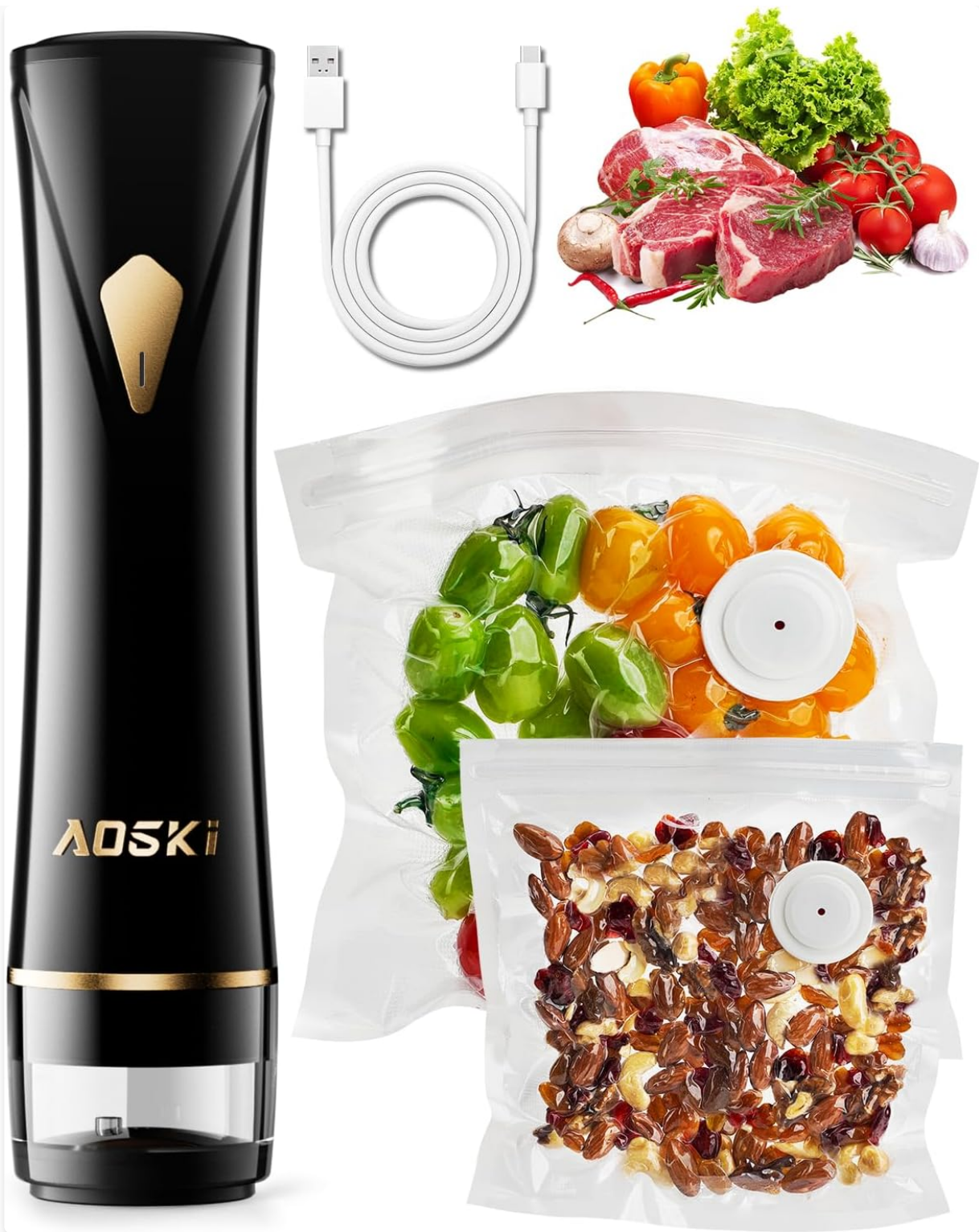
Figure 1: AOSKI Handheld Vacuum Sealer Machine and accessories.