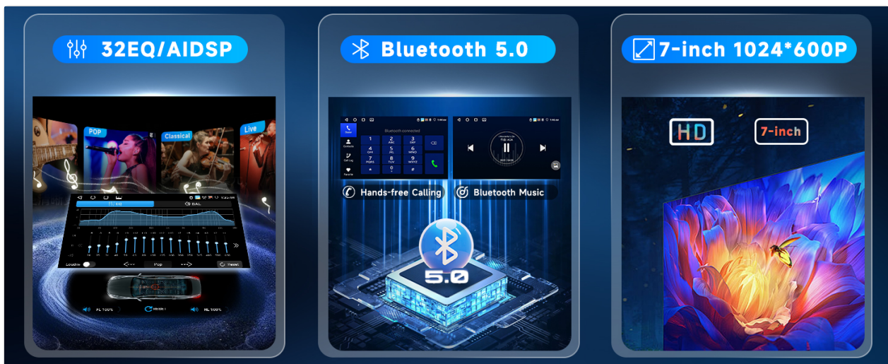
This image highlights the Bluetooth 5.0 connectivity, the detailed 32-band Equalizer for audio customization, and the clarity of the HD screen.