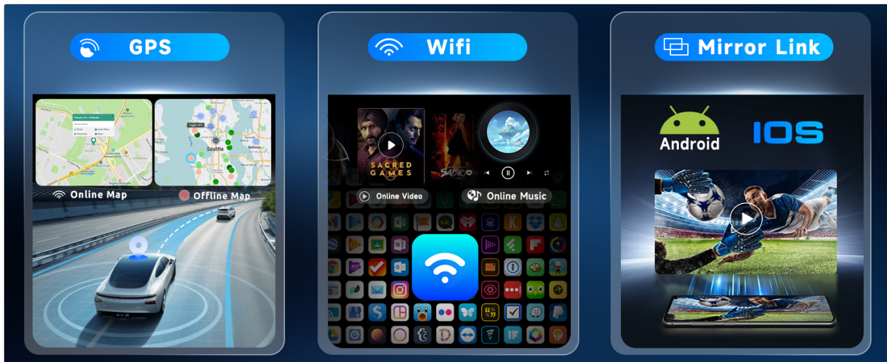
This image illustrates the functionalities of GPS navigation, WiFi internet access, and smartphone screen mirroring via Mirror Link.