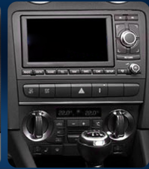
For RS3 Sportback (2011-2012)

This image illustrates the compatible Audi dashboard configurations, showing the original setup and the integrated VECHTEL car stereo.