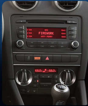
For A3 8P (2003-2012)