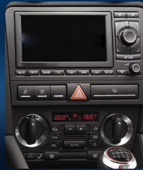
For S3 8P (2006-2012)