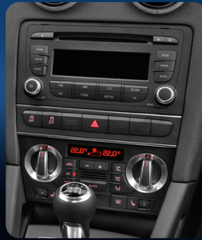
For A3 8P1 3-door Hatchback (2003-2012)