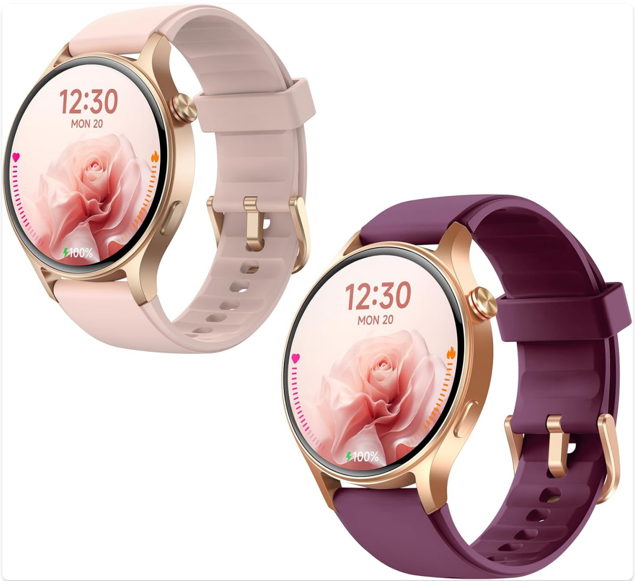
Image: The Fitpolo AR-01 Smartwatch in two color variations.