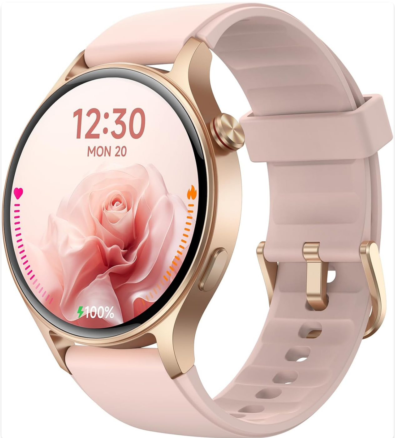
Image: Front view of the Fitpolo AR-01 smartwatch, showcasing its display.