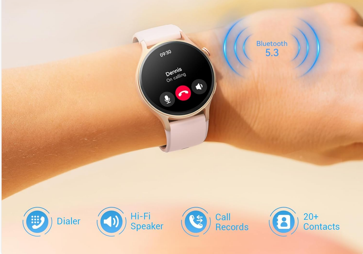
Image: Example of smart notifications displayed on the smartwatch.

With BLE 5.3 and professional DSP audio chip, it delivers superior sound quality to make phone call and answers