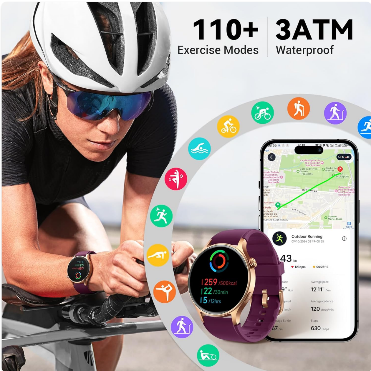
Image: Overview of additional features and battery life information.