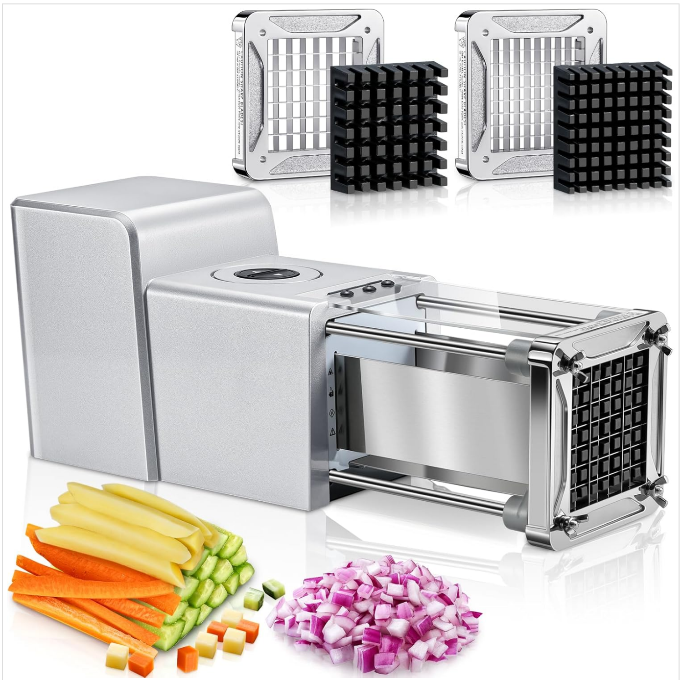
Figure 1.1: Sopito Electric French Fry Cutter with included 1/2" and 3/8" blades, alongside examples of cut potatoes, carrots, and onions.