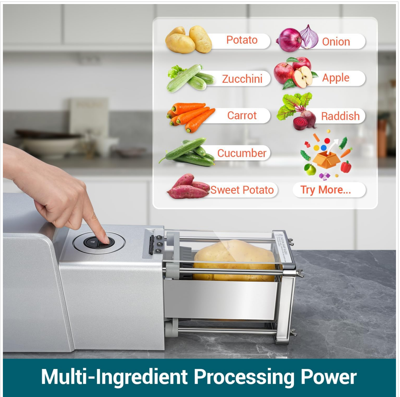
Figure 5.3: The Sopito cutter can process a variety of ingredients beyond potatoes, such as carrots, cucumbers, onions, zucchini, apples, and radishes.