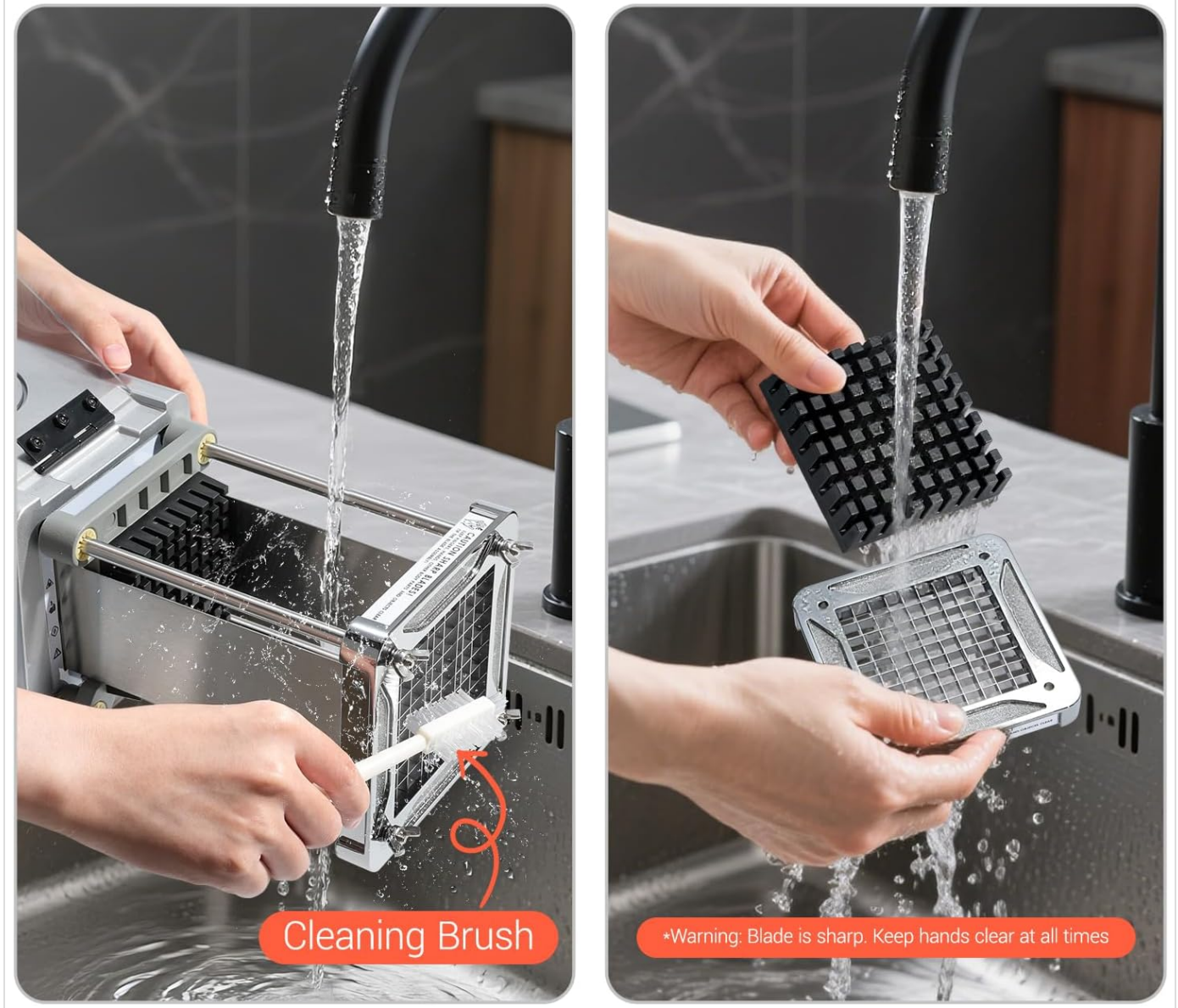
Figure 6.1: Cleaning the Sopito French Fry Cutter. The detachable blades can be rinsed, and the main unit wiped clean.

Includes Custom Cleaning Brush – Effortless Maintenance!