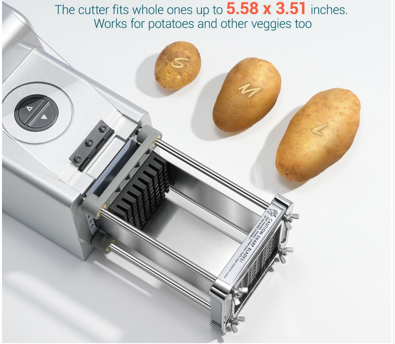
Figure 5.1: Loading a potato into the cutter.

The cutter fits whole ones up to 5.58 x 3.51 inches. Works for potatoes and other veggies too