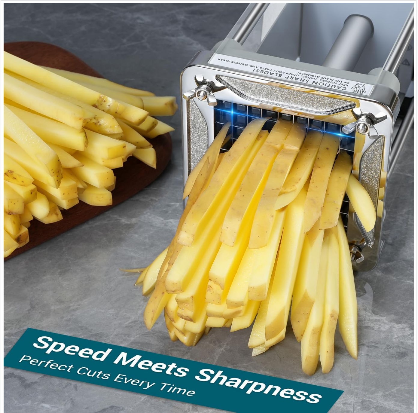
Figure 3.1: Included 1/2-inch and 3/8-inch stainless steel blade assemblies.