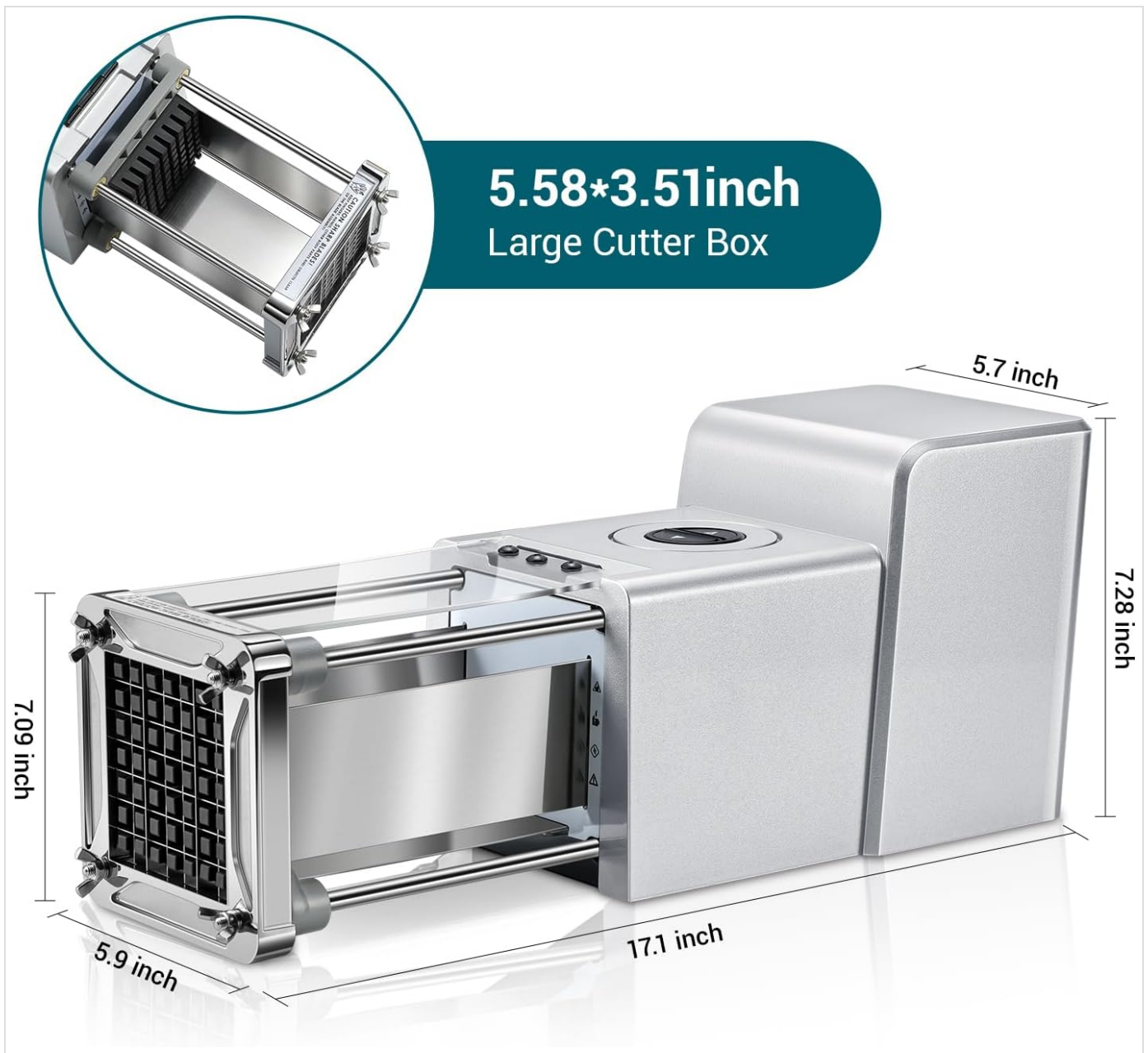
Figure 8.1: Product dimensions for the Sopito Electric French Fry Cutter.