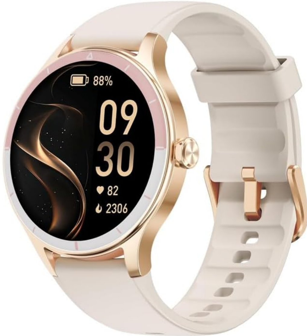
Image: A smartwatch with a watch band, demonstrating the compatible model. This image helps users visualize the type of smartwatch the band is designed for.

Specially Designed for TOOBUR DR06 Smart Watch