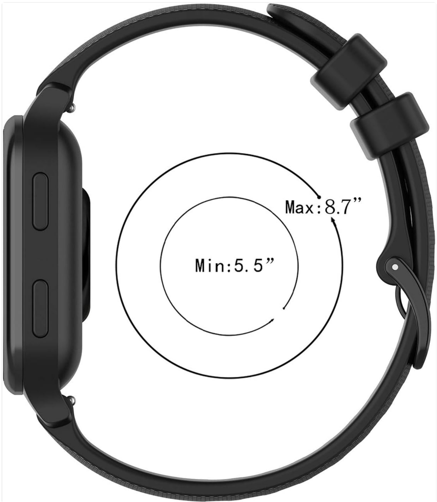
Image: A diagram illustrating the adjustable length of the watch band, showing the minimum (5.5 inches) and maximum (8.7 inches) wrist circumference it can accommodate.