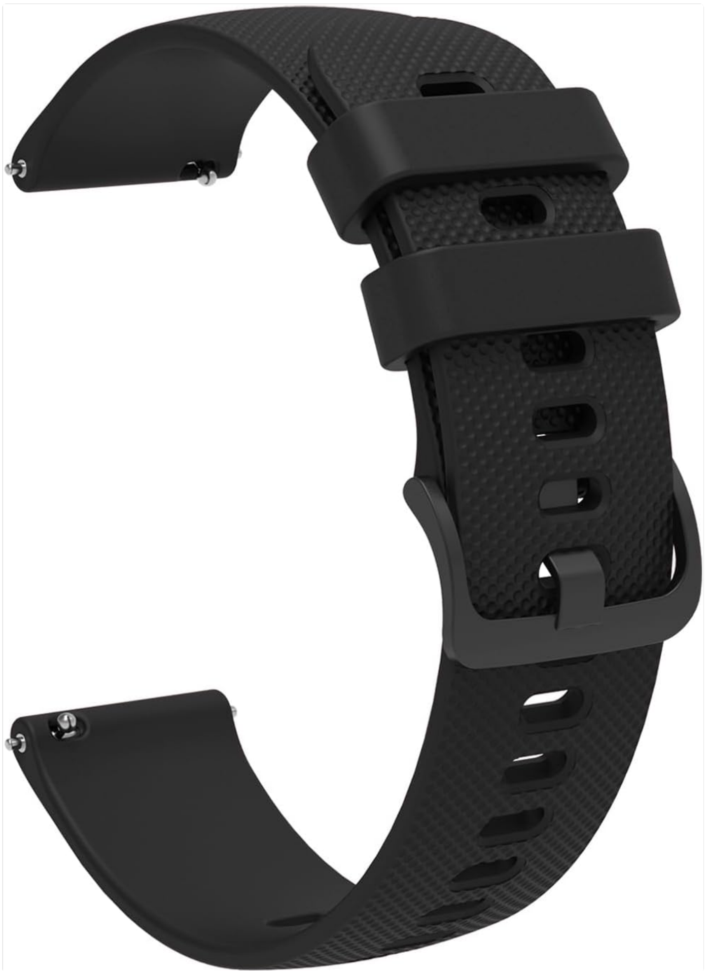
Image: A close-up view of the black silicone watch band, highlighting its texture and quick-release pins.