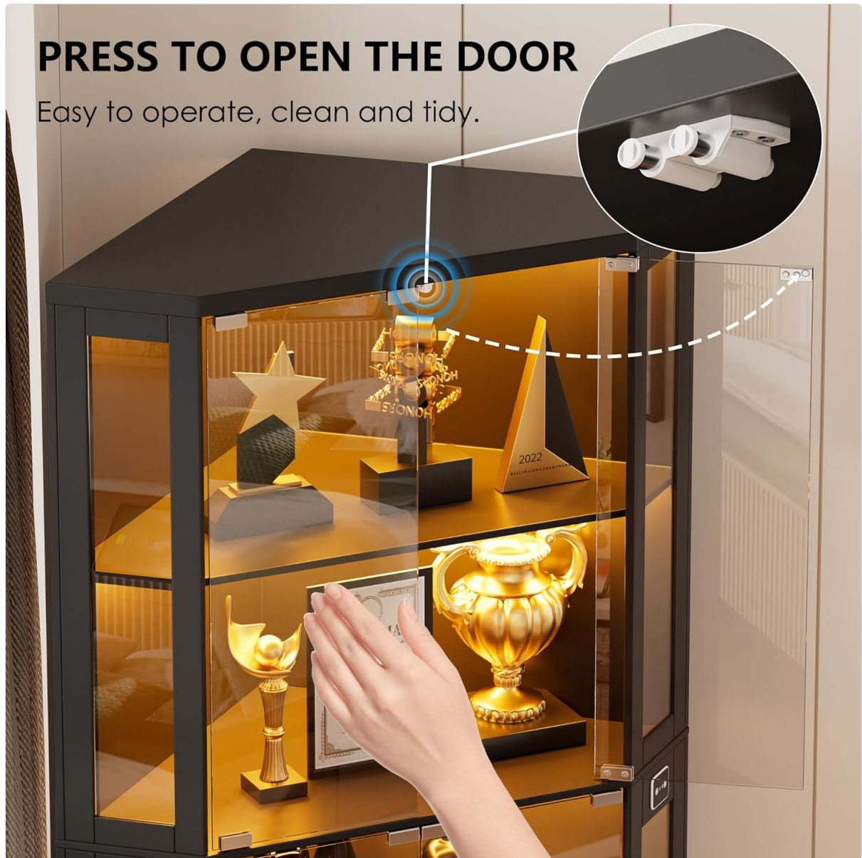
Figure 2: Gently press to open the glass doors.