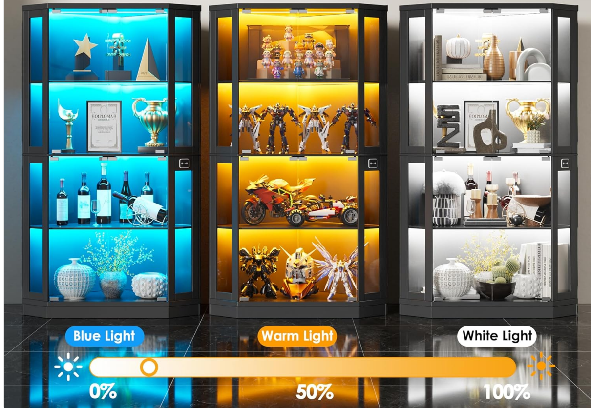
Figure 4: Three Adjustable LED Light Colors (Blue, Warm, White)