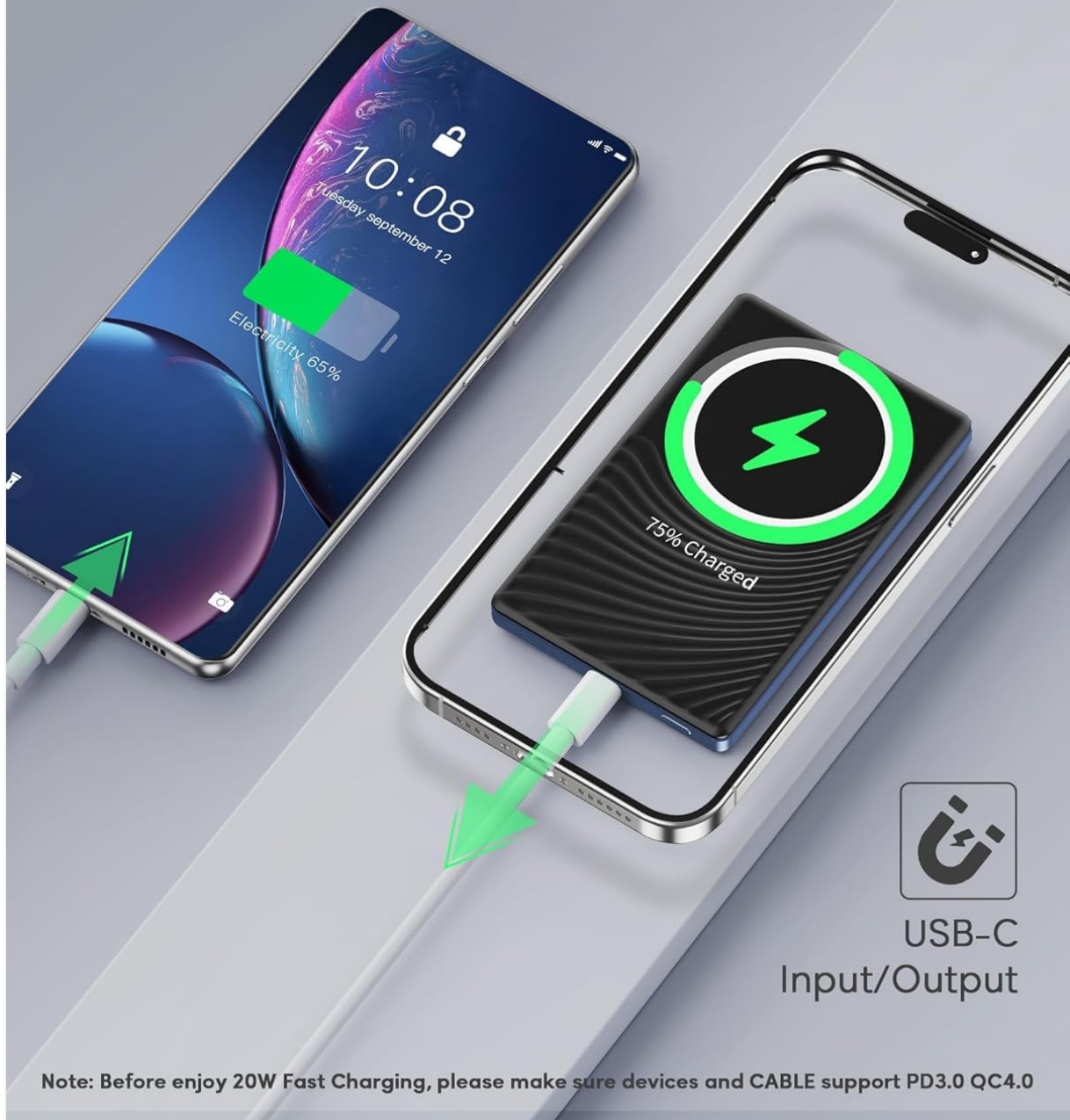
Image: Two smartphones are shown charging simultaneously, one wirelessly attached to the power bank and another connected via a USB-C cable.