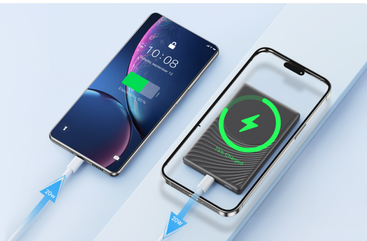
Image: A detailed diagram of the Ntaanoo Magsafe Battery Pack, illustrating the wireless charging area, LED power