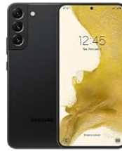
Andriod Support Qi