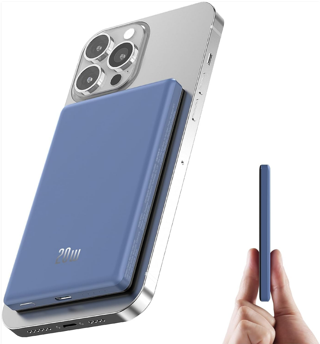
Image: The Ntaanoo Magsafe Battery Pack (MP051) in blue, magnetically attached to the back of a smartphone, highlighting its ultra-slim design.