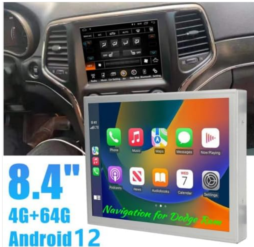
Image: The Zcargel car stereo integrated into a vehicle's dashboard.

After installation, turn on your vehicle's ignition. The stereo should power on automatically. Follow any on-screen prompts for initial setup, such as language selection and time zone.