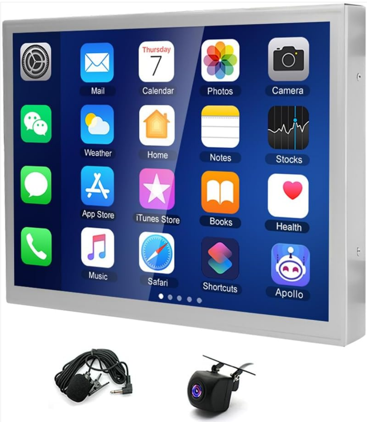
Image: Detailed view of all items included in the product package.