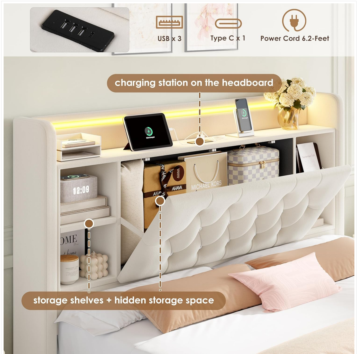
Figure 4.2: Close-up view of the headboard's charging station, showing 3 USB ports, 1 Type-C port, and the 6.2-foot power cord. Also visible are the storage shelves and the hidden cubby space.