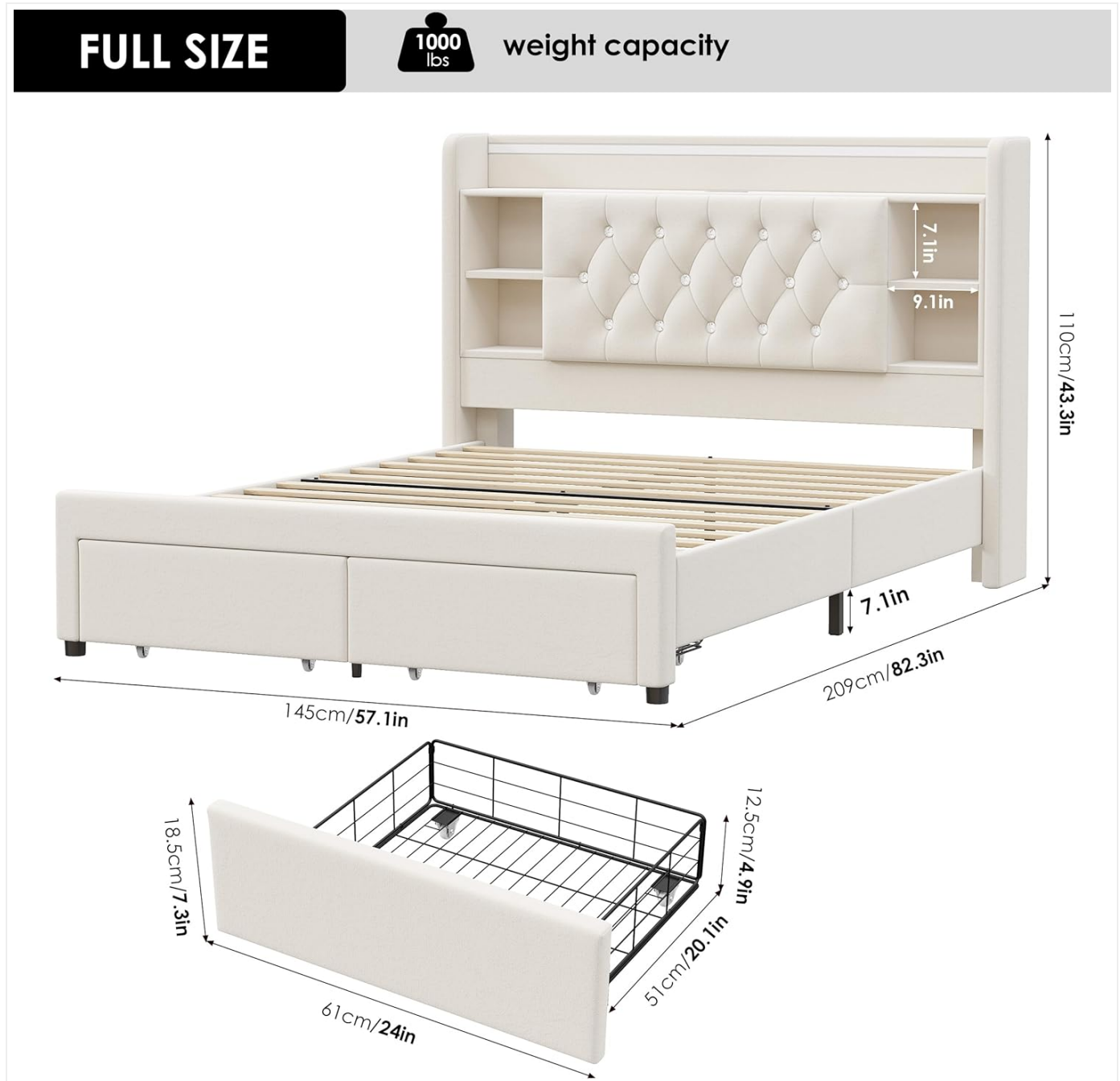
Figure 3.1: Key dimensions of the Full bed frame (82.3"L x 57.1"W x 43.3"H) and its 1000 lbs weight capacity, along with a detailed view of the drawer assembly.

Carefully unpack all components and lay them out on a clean, soft surface to prevent scratches. Verify that all parts listed in the packing list are present. Refer to the included assembly diagram for part identification.