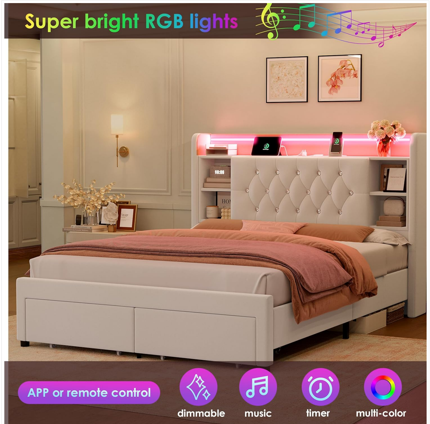
Figure 4.1: The headboard's RGB LED lights in operation, highlighting features such as APP or remote control, dimmable settings, music sync mode, timer function, and multi-color options.