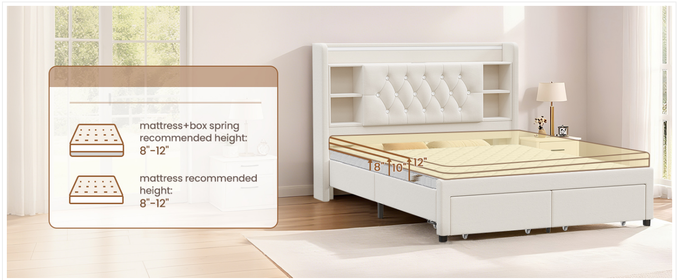
Figure 7.1: Illustration of recommended mattress height (8"-12") for optimal fit and comfort with the bed frame, indicating no box spring is needed.