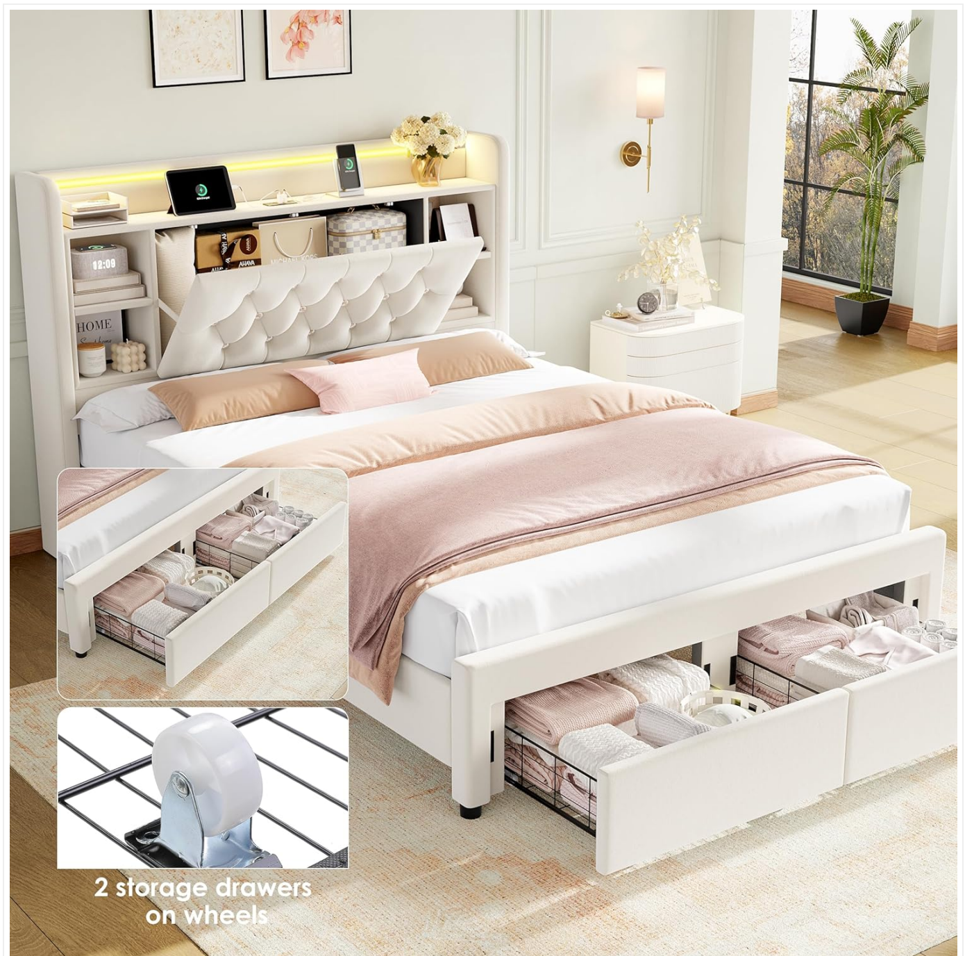
Figure 4.3: The two spacious under-bed storage drawers, demonstrating their capacity and smooth operation on wheels.