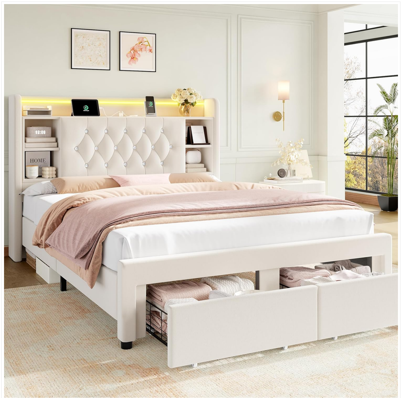
Figure 1.1: Overview of the Keyluv Full Bed Frame, showcasing the upholstered headboard with LED lights, integrated shelves, and under-bed storage drawers.