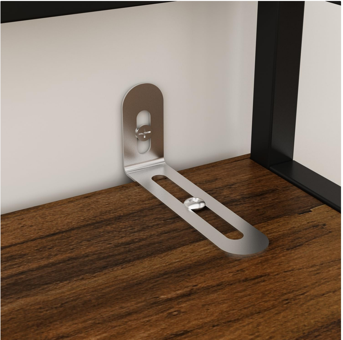
Figure 2: Example of the anti-tipping device installation for enhanced stability.