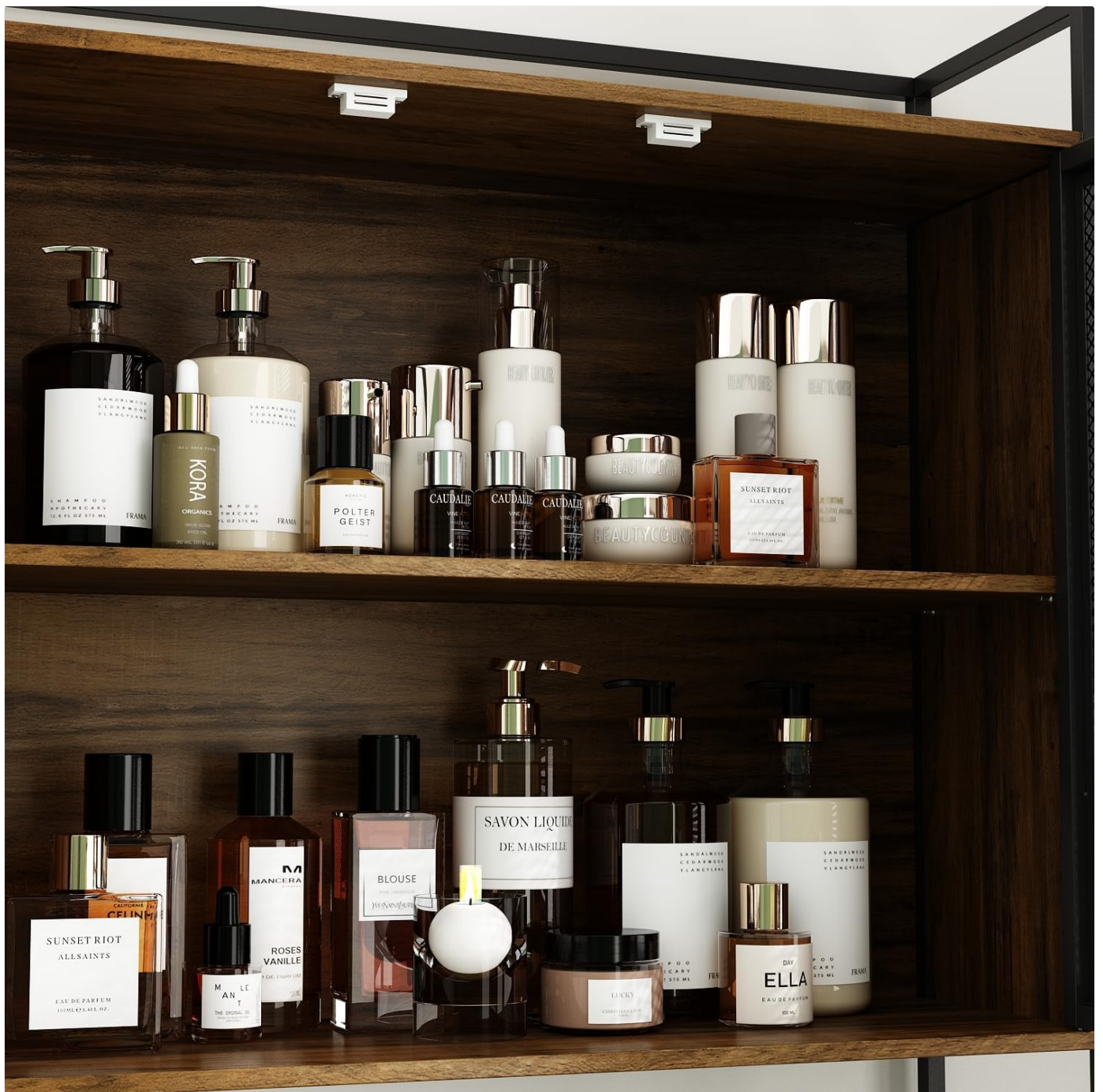
Figure 3: The upper cabinet with metal mesh doors provides concealed storage.