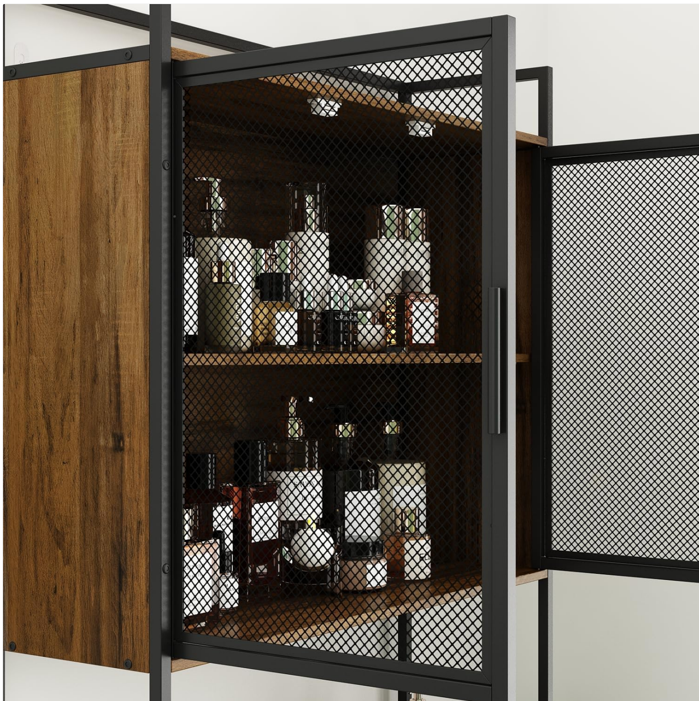
Figure 4: Side shelves offer convenient access to frequently used items.