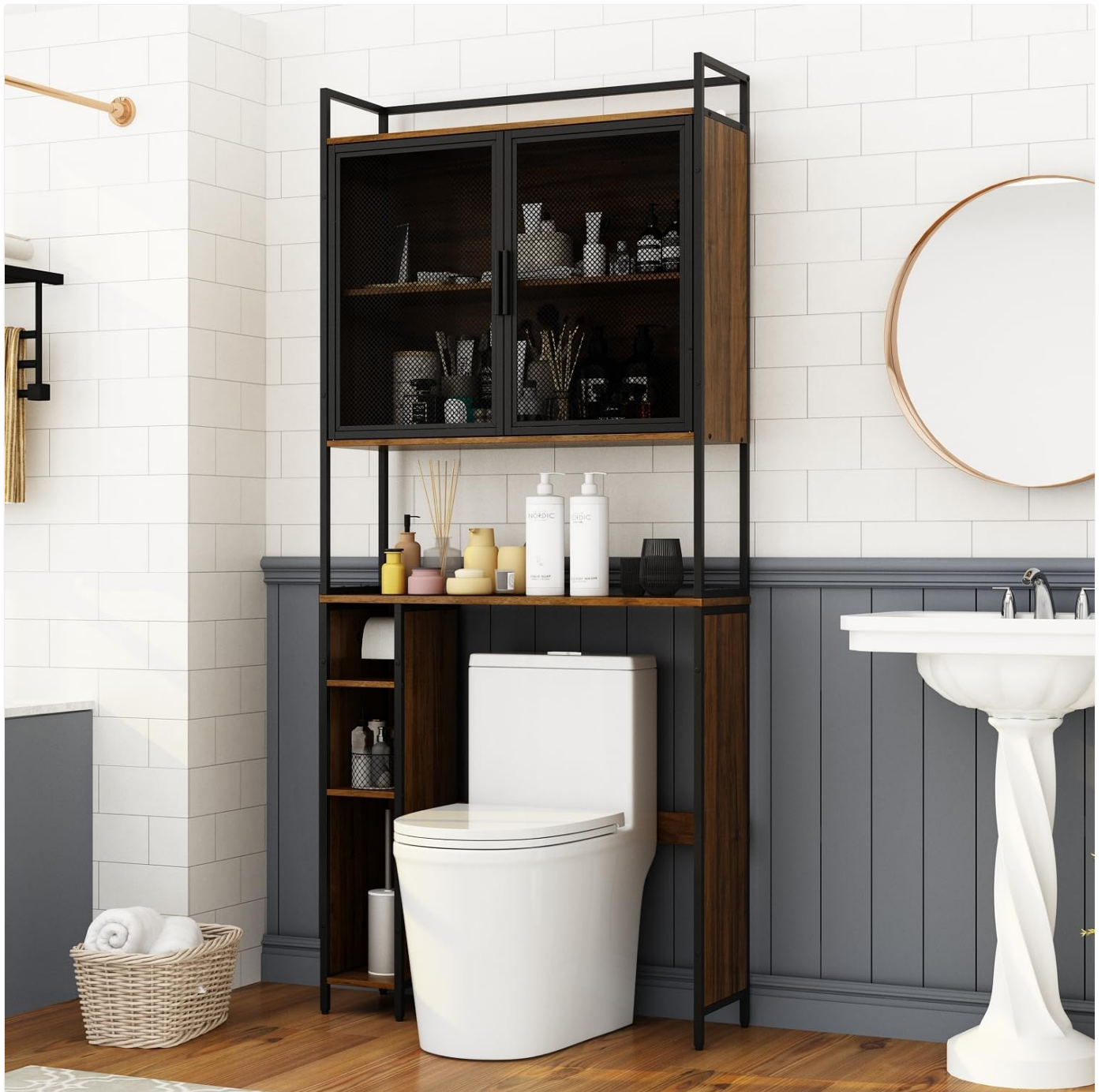
Figure 1: Fully assembled FAMAPY Over The Toilet Storage Cabinet.