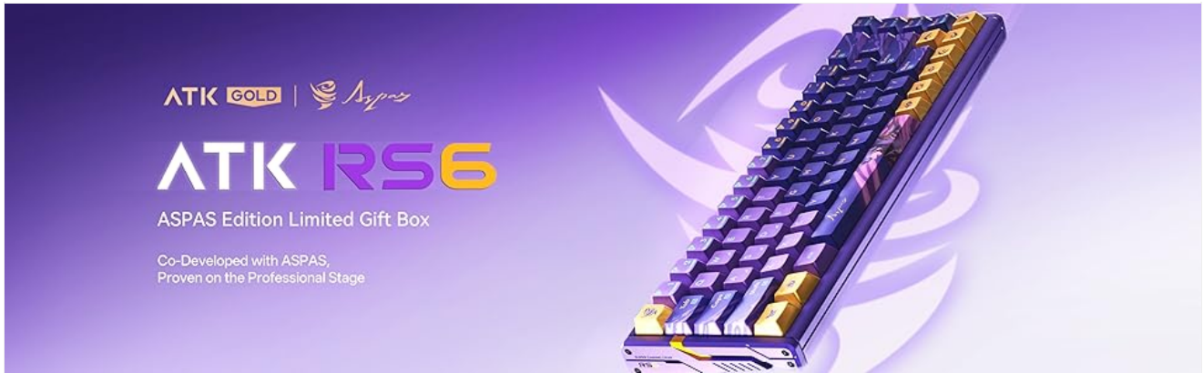
Image: The ATK RS6 Ultra keyboard showcasing its compact 65% layout, highlighting its space-saving design.

The ATK RS6 Ultra features a compact 65% layout, which optimizes desk space by removing the number pad while retaining essential arrow keys and function keys. This design is particularly beneficial for gamers who require more mouse movement space.