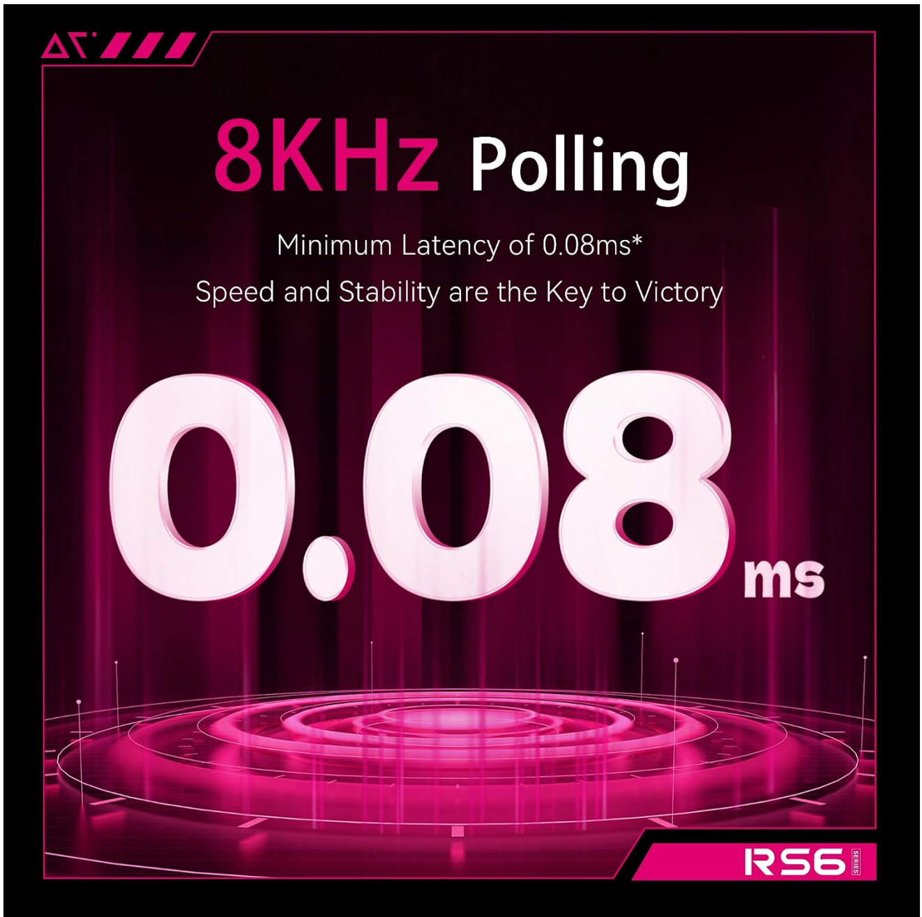
Image: Graphic illustrating the 8000Hz polling rate and 0.08ms latency of the ATK RS6 Ultra keyboard.