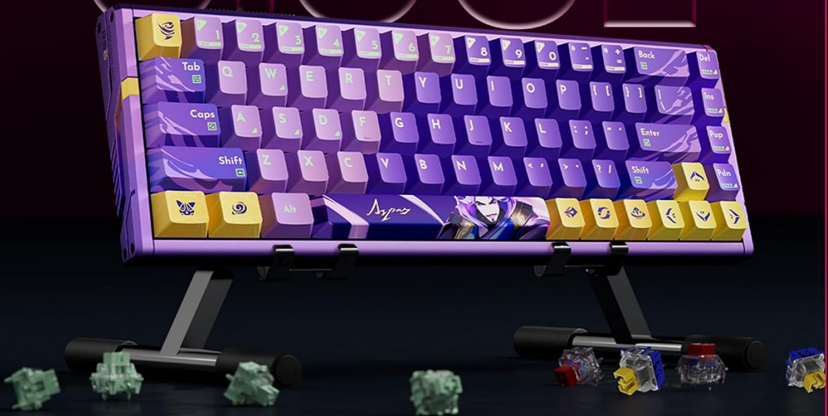
Image: Illustration demonstrating the extreme RT precision of 0.001mm step actuation on the ATK RS6 Ultra keyboard.