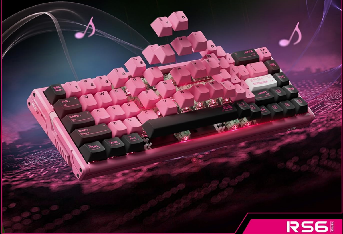
Image: The ATK RS6 Ultra keyboard displaying its music rhythm feature, with lighting effects synchronized to music notes.

Lighting Effects Sync with Music Changing with the Beat of the Notes