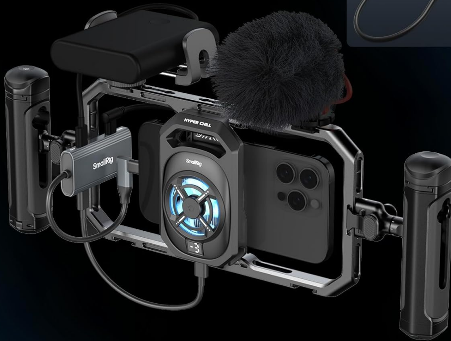
Image: A fully rigged phone cage demonstrating various expansion options including cold shoe mounts, 1/4"-20 threaded holes, and quick release interfaces for accessories like microphones and filters.