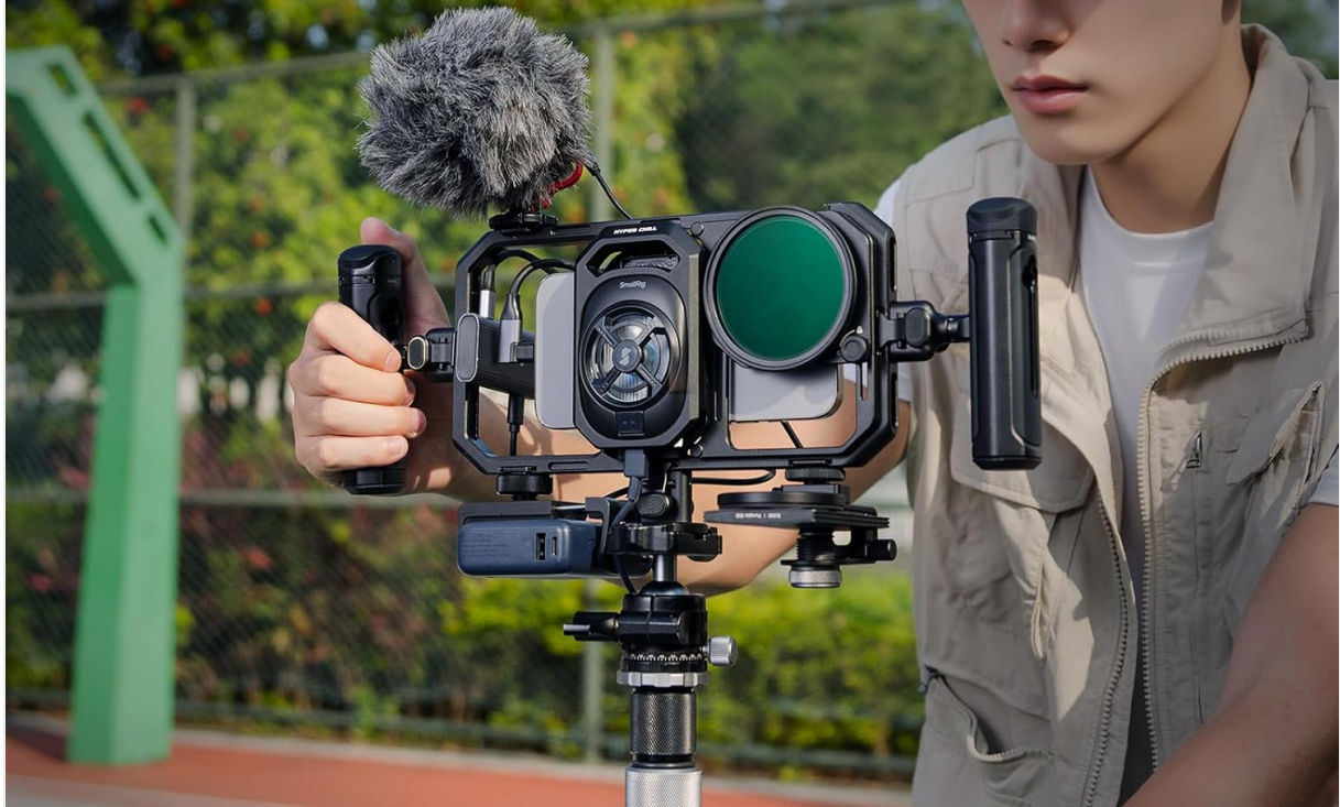
Image: Diagram illustrating the universal compatibility of the phone cage, showing the adjustable width for various smartphone models.