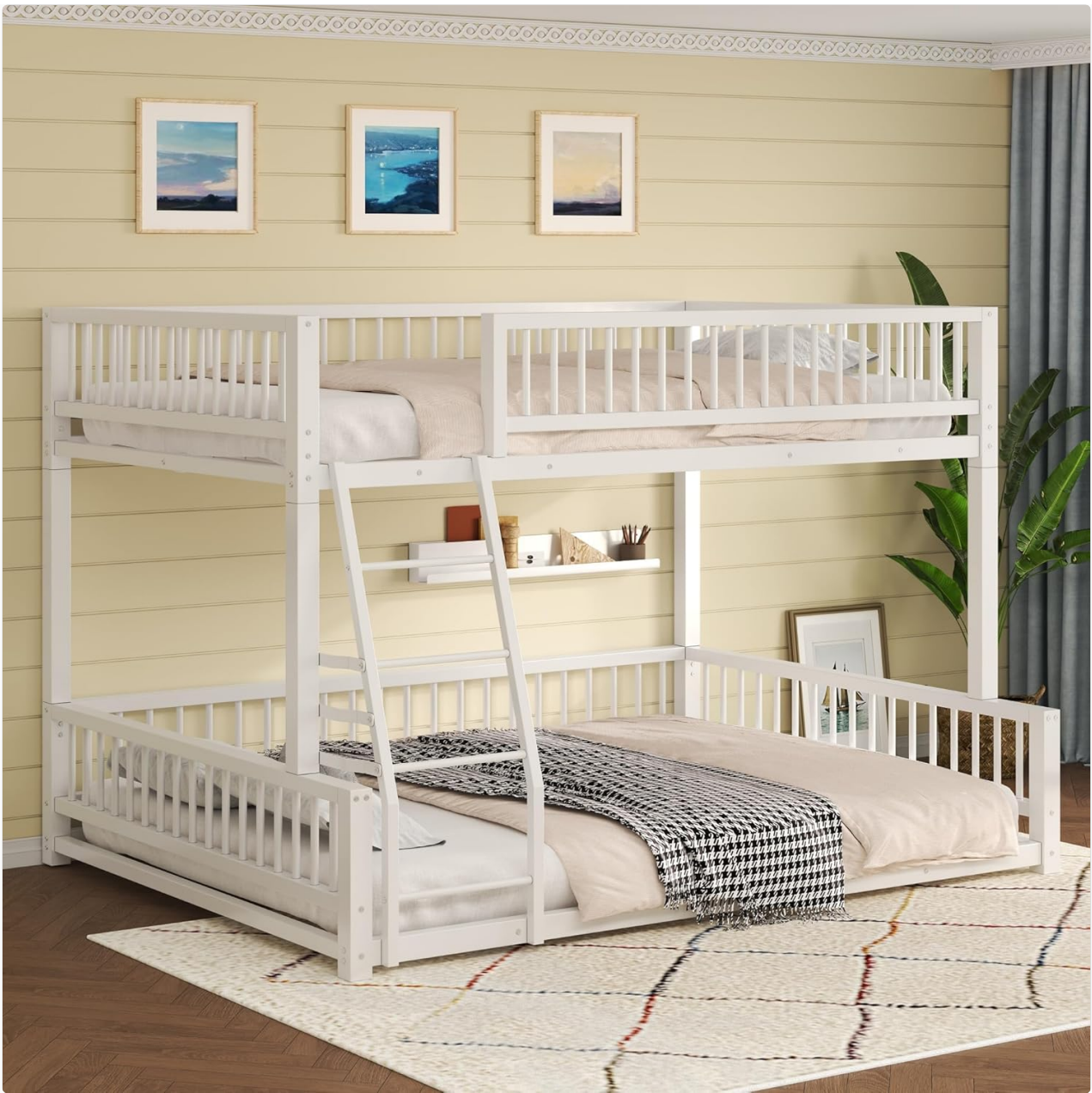
Figure 1: Fully assembled QVUUOU Full XL Over Queen Metal Bunk Bed. This image displays the bunk bed in its complete configuration, featuring a white lacquered finish, safety guardrails on the top bunk, and an integrated ladder. Mattresses and bedding are shown for illustration.