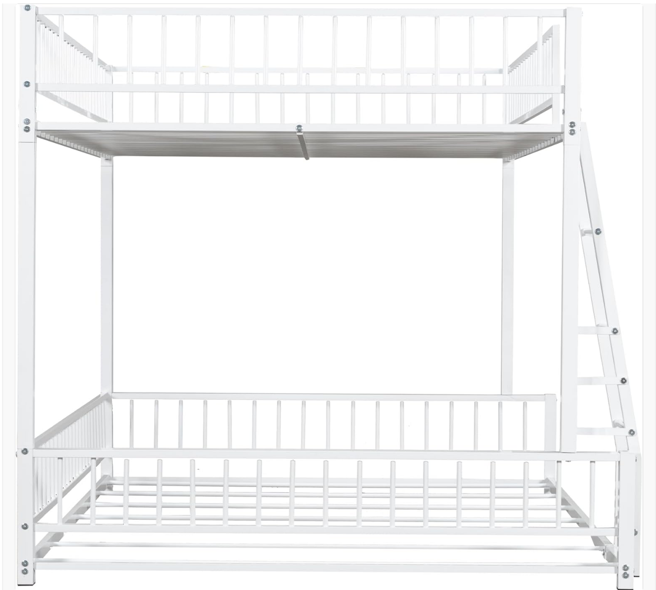
Figure 2: Front view of the metal bunk bed frame. This image highlights the robust metal construction, integrated ladder, and the protective guardrails on the upper bunk. The metal slat system for mattress support is also visible.