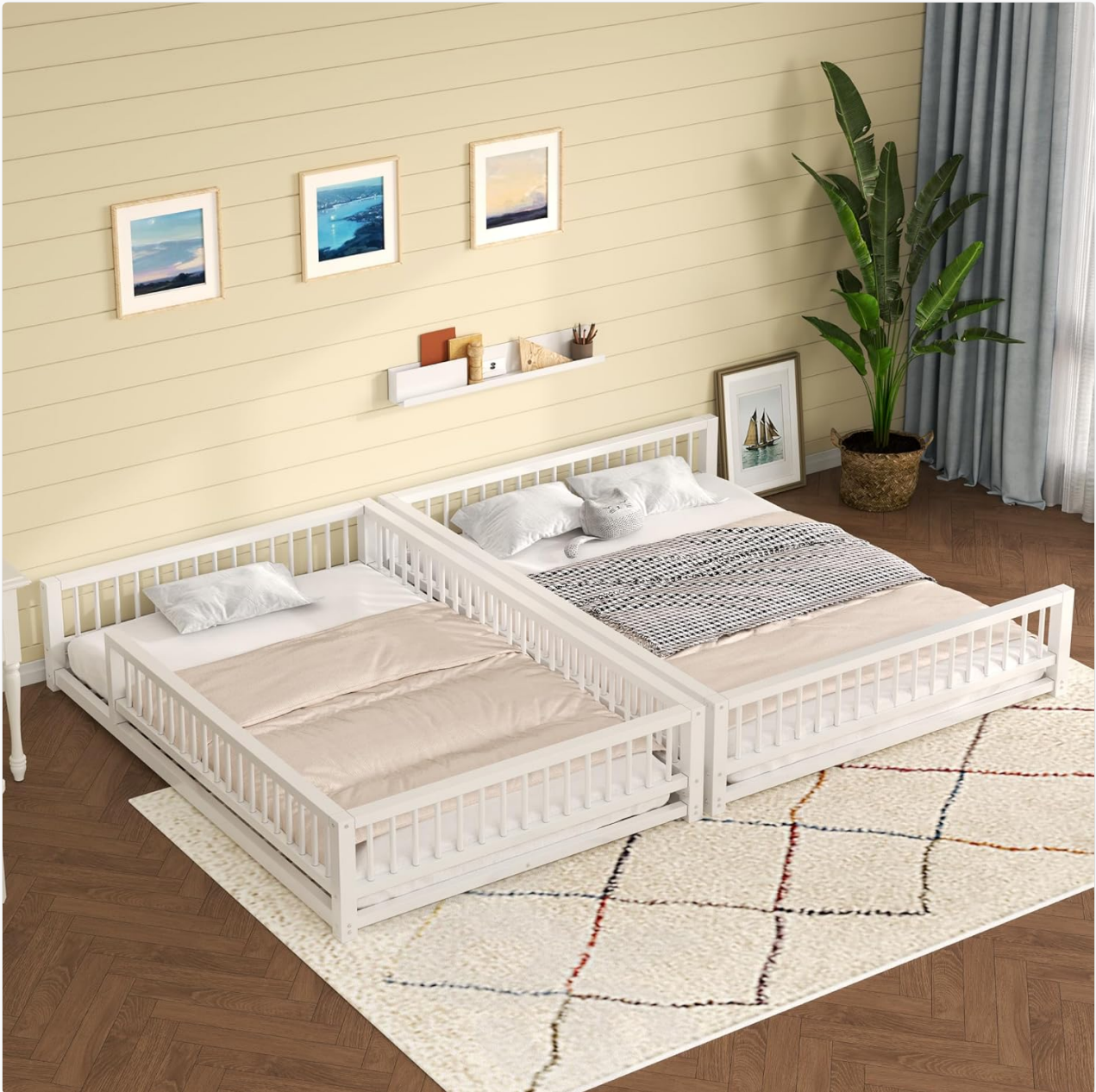
Figure 3: Detached bunk beds. This image demonstrates the bunk bed's detachable feature, showing the upper Full XL bed and lower Queen bed configured as two separate, independent platform beds. This allows for flexible room arrangements.

Detachable Design: This bunk bed can be separated into two independent platform beds. To convert, carefully reverse the stacking steps, ensuring all connecting hardware is removed and stored safely. The guardrails and ladder are specific to the bunk bed configuration.