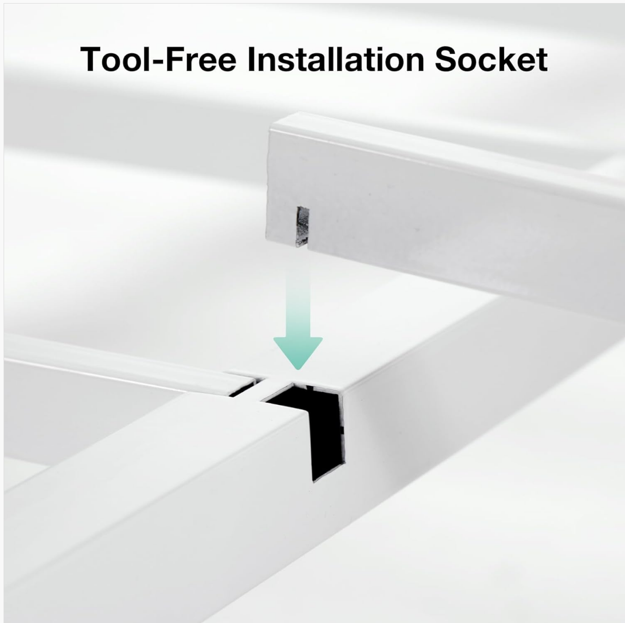
Image: Detail of the tool-free installation socket for quick and easy assembly.

Connect the side rails to the headboard and footboard using the provided bolts and the Allen wrench. Ensure all connections are secure but do not overtighten initially. The frame features a tool-free installation socket for certain connections, allowing parts to slide and lock into place.