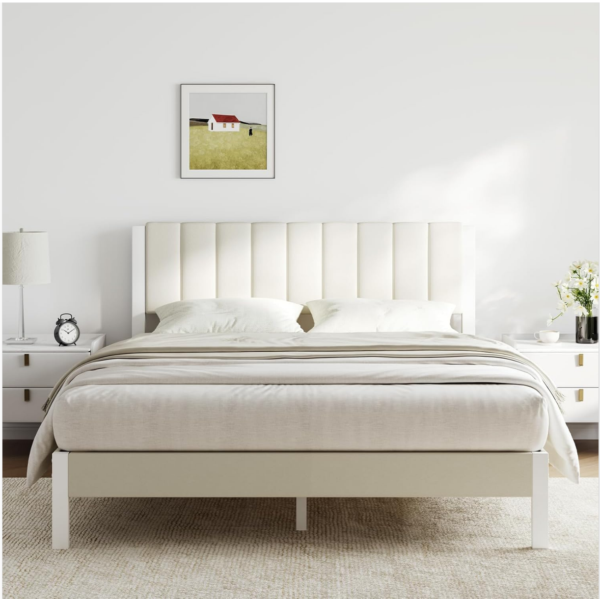
Image: The Novilla Full Bed Frame fully assembled, showcasing its design and appearance.