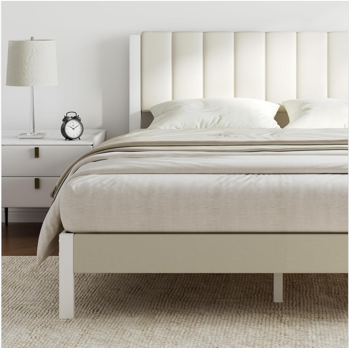
Image: The upholstered headboard and side panel, demonstrating how the mattress sits directly on the frame.