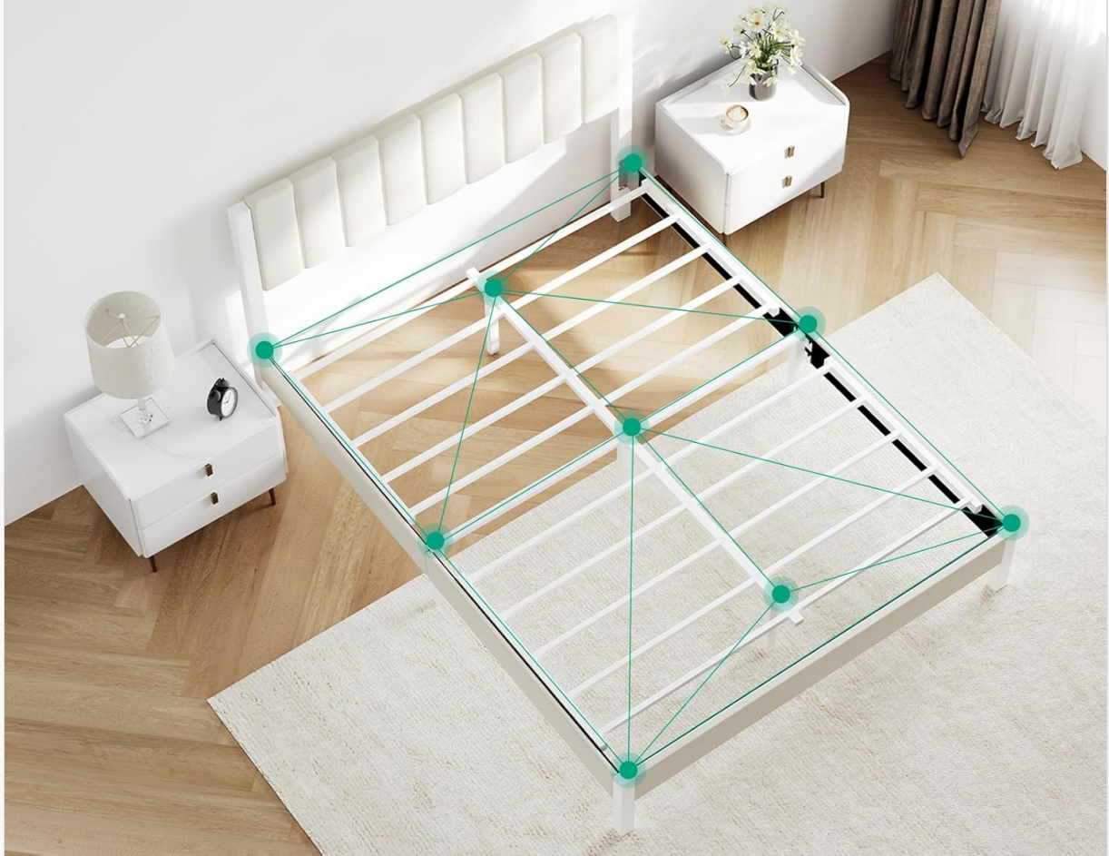
Image: Illustration of the 9-stronghold base and multi-directional support system for enhanced stability.

9-Stronghold Base Multi-Directional Support Dual Internal & External Support