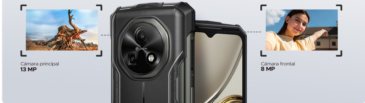
Image: Details of the 13MP main camera and 8MP front camera.