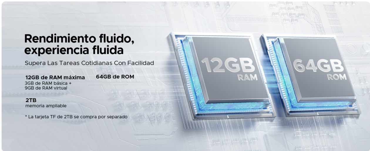
Image: Representation of 12GB RAM and 64GB ROM storage.

Image: The Unisoc SC9863A Octa-core chipset.