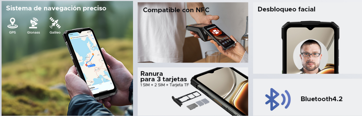
Image: Illustration of SIM card tray and NFC functionality.