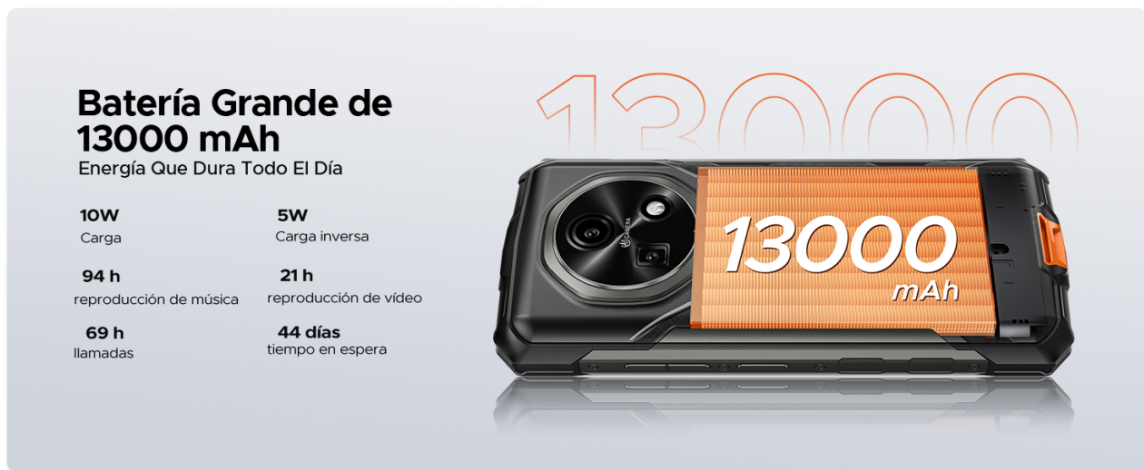
Image: Visual representation of the 13000mAh battery.