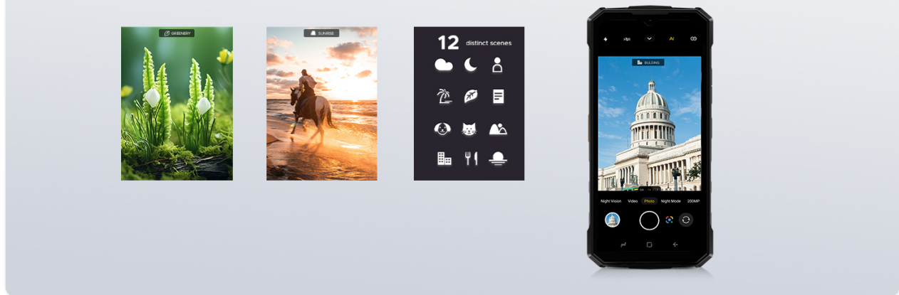
Image: AI recognition feature for optimizing photo settings.