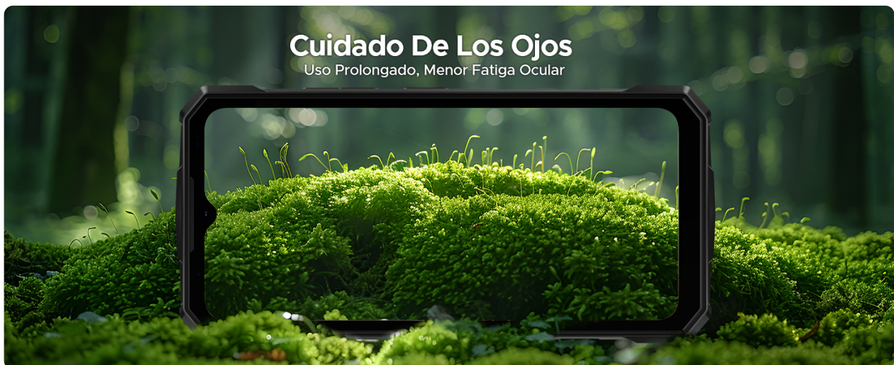
Image: The Eye Care feature for reduced eye fatigue.