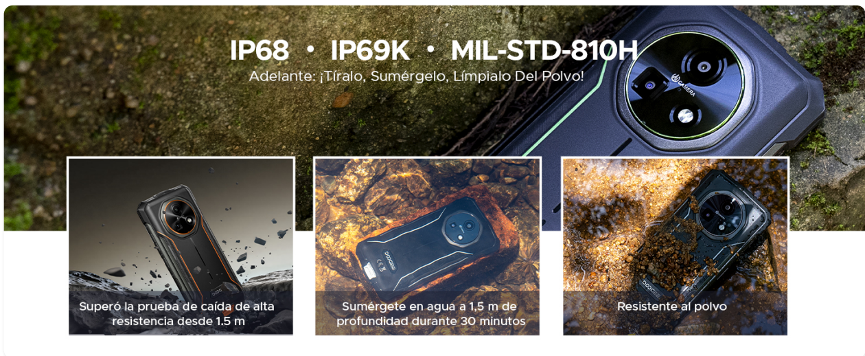
Image: Visual demonstration of the phone's water, dust, and drop resistance.