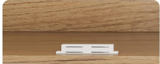
Magnetic Contact Device