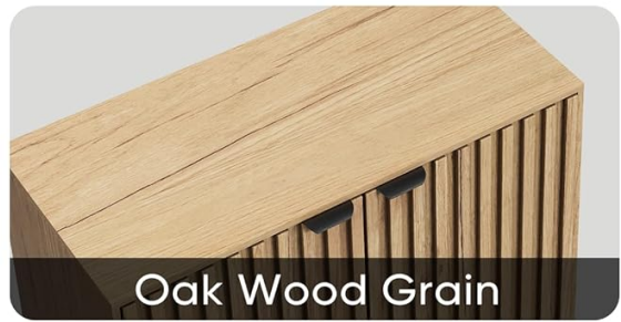
Oak Wood Grain