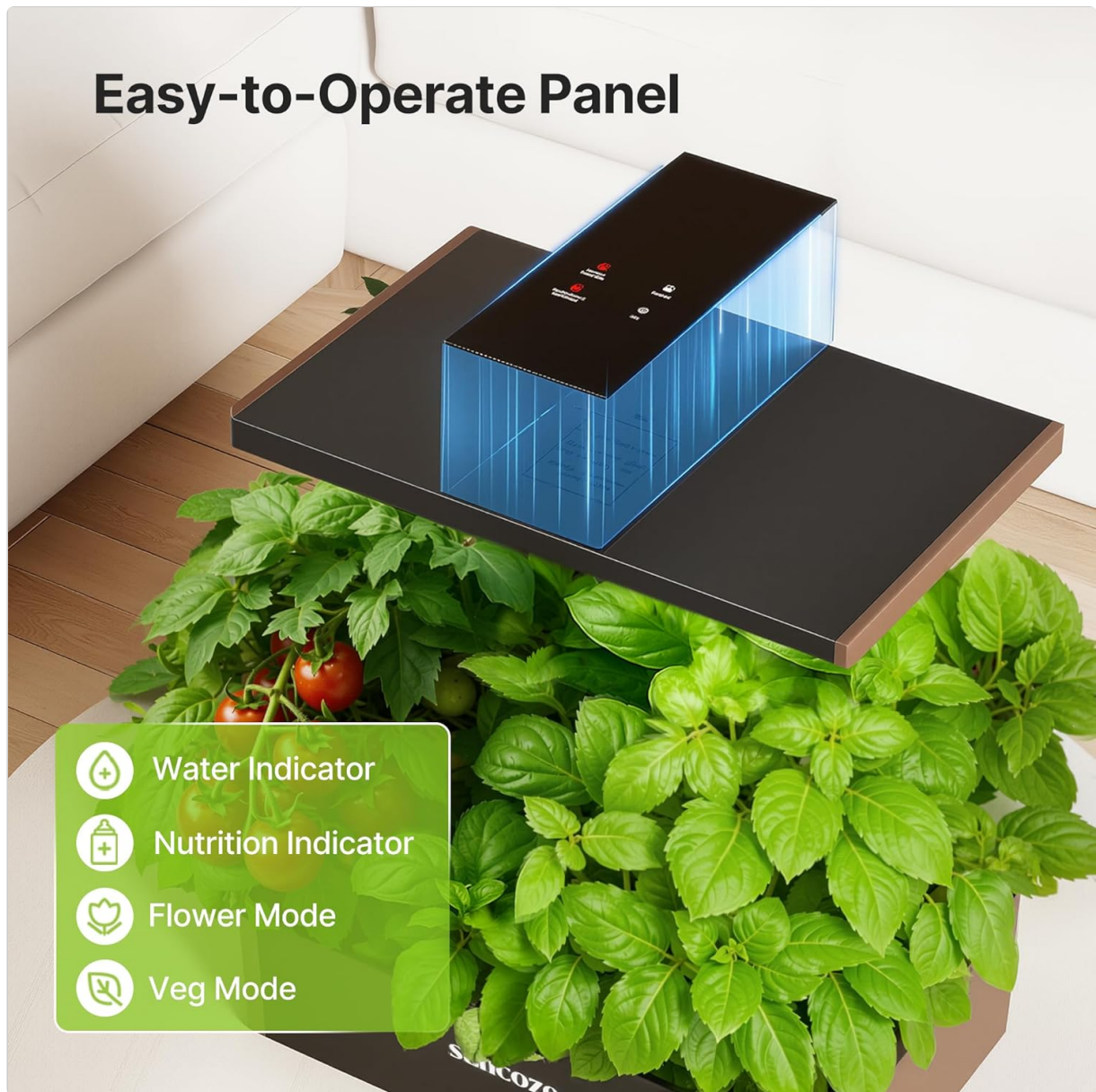
Image: The LCD control panel displaying indicators for water, nutrition, flower mode, and vegetable mode.