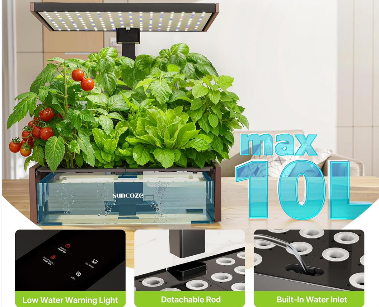
Image: The 10L water tank, highlighting the built-in water inlet and the smart pump system.