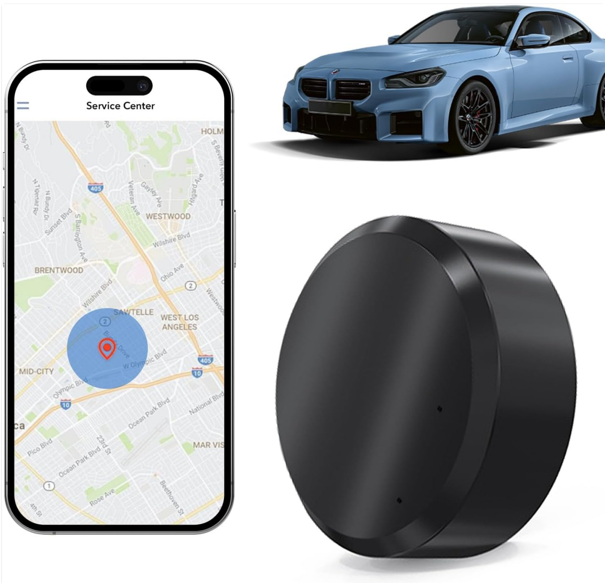
Image: The koyetubs GF11-M4 Mini GPS Tracker, shown alongside a smartphone displaying its tracking interface and a vehicle, highlighting its primary use.