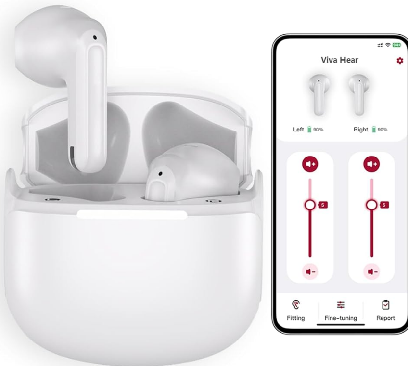
Figure 1: Viva Hear MH03 Hearing Aids and companion app interface.