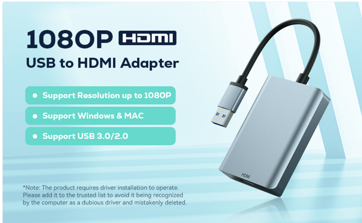
Image: WENTER USB 3.0 to HDMI Adapter showcasing universal compatibility with various operating systems and display devices.