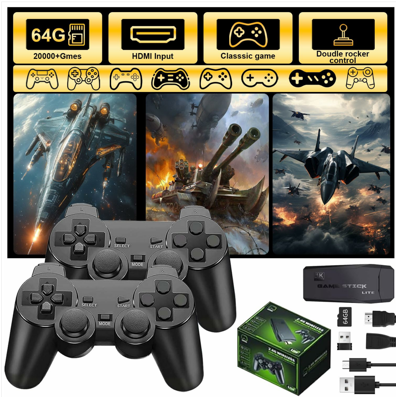
Image: The Polaring M8 Wireless Retro Game Console, including the game stick, two wireless controllers, and various cables.