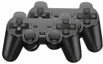
Wireless Controller X2