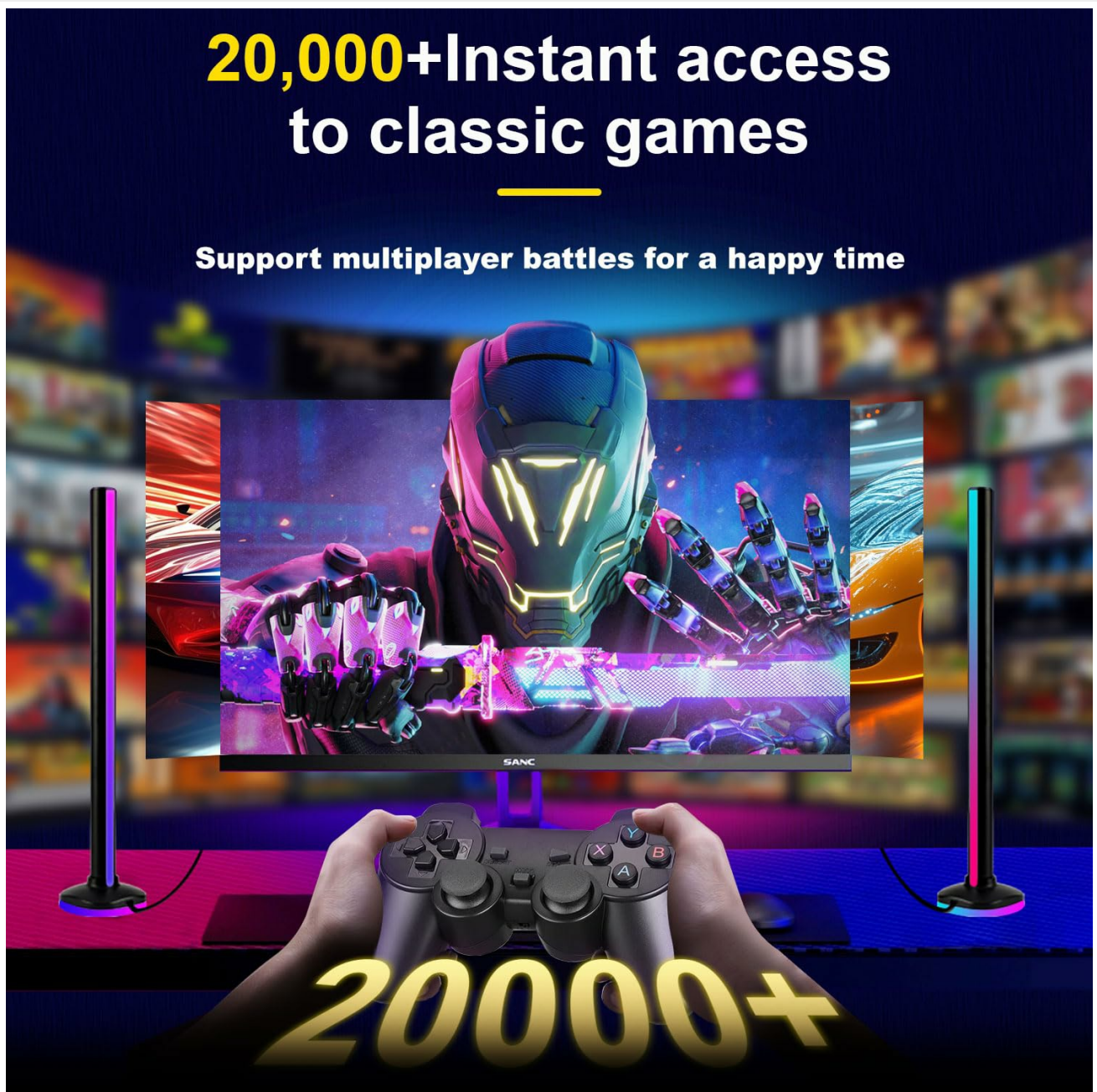
Image: Gameplay demonstration with wireless controllers.