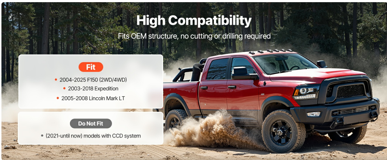
Image 3: A visual guide detailing the specific Ford F150, Expedition, and Lincoln Mark LT models that are compatible with this leveling lift kit, along with a clear exclusion for newer models with CCD systems.