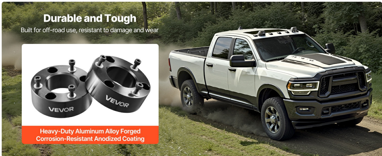
Image 2: The VEVOR leveling lift kit spacers, showcasing their robust forged aluminum alloy construction and corrosion-resistant anodized coating, designed for durability.