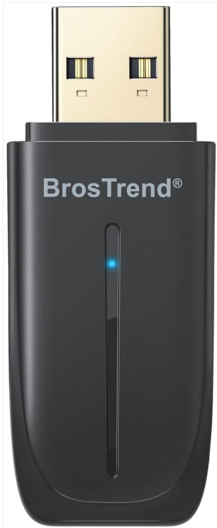
Image: BrosTrend AX900 USB WiFi 6 and Bluetooth 5.4 Adapter, front view.