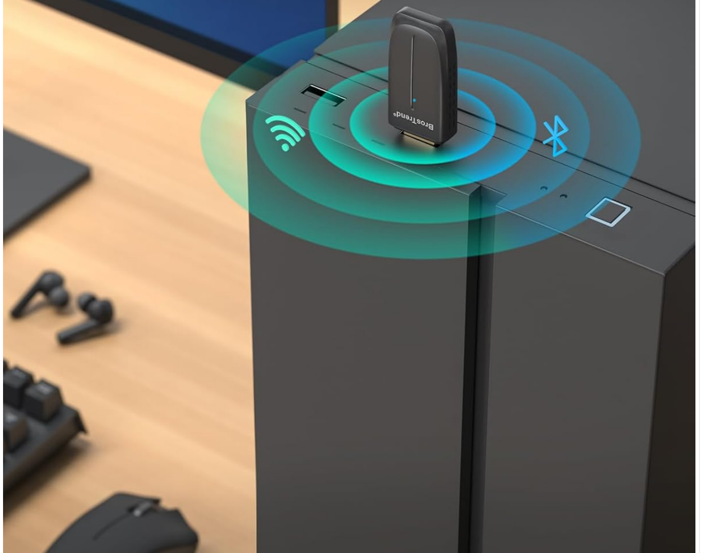
Image: The BrosTrend AX900 USB adapter being inserted into a USB port on a desktop computer, illustrating its compact size and ease of connection.