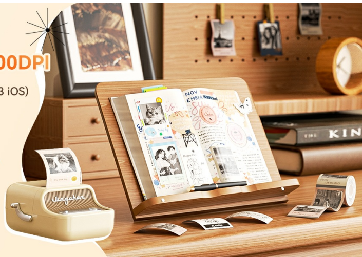
Image: An overview of the NIIMBOT B21 Pro's updated features, including 300DPI resolution, smart paper return, and various printing capabilities.