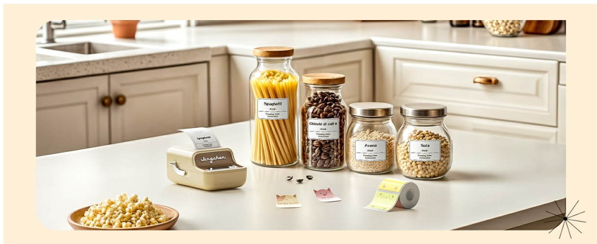
Image: A kitchen scene featuring labeled glass jars on a countertop, demonstrating the use of the B21 Pro for pantry organization.