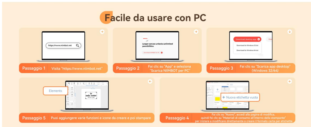
Image: Visual guide demonstrating how to download the NIIMBOT PC driver from the official website, create, and print labels using the desktop application.