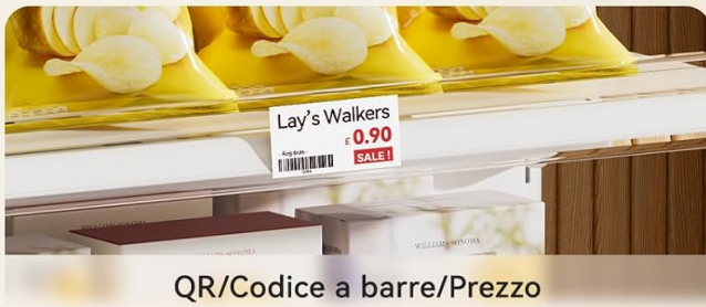
QR/Codice a barre/Prezzo