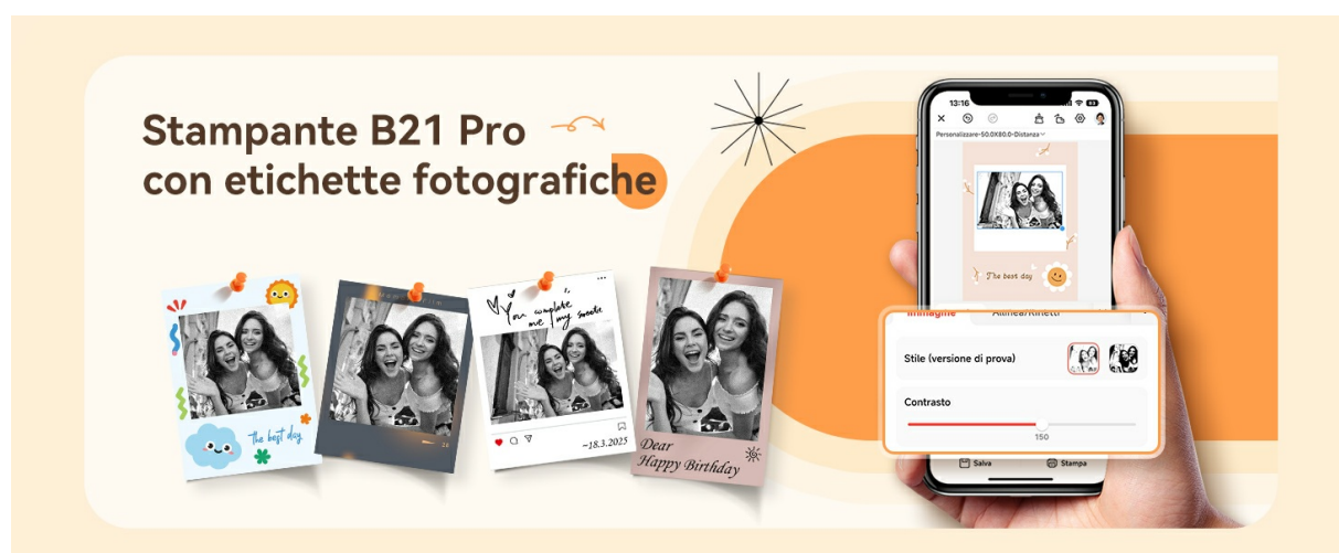
Image: The B21 Pro printer shown with various photo labels, demonstrating its capability to print images from a smartphone.

Leverage the 300DPI resolution of the B21 Pro to print high-quality black and white photos on compatible thermal labels. Simply select an image from your device within the NIIMBOT app, adjust its size and position to fit the label, and print.