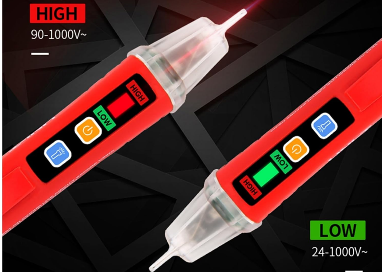
Image: Intelligent induction electric field. The detector is shown sensing an electric field around electrical wiring, demonstrating its non-contact high-sensitivity capability.