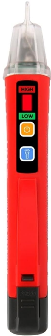
Image: Non-contact measurement in progress. The UT12D detects voltage from an electrical outlet, indicated by a red light at the tip.