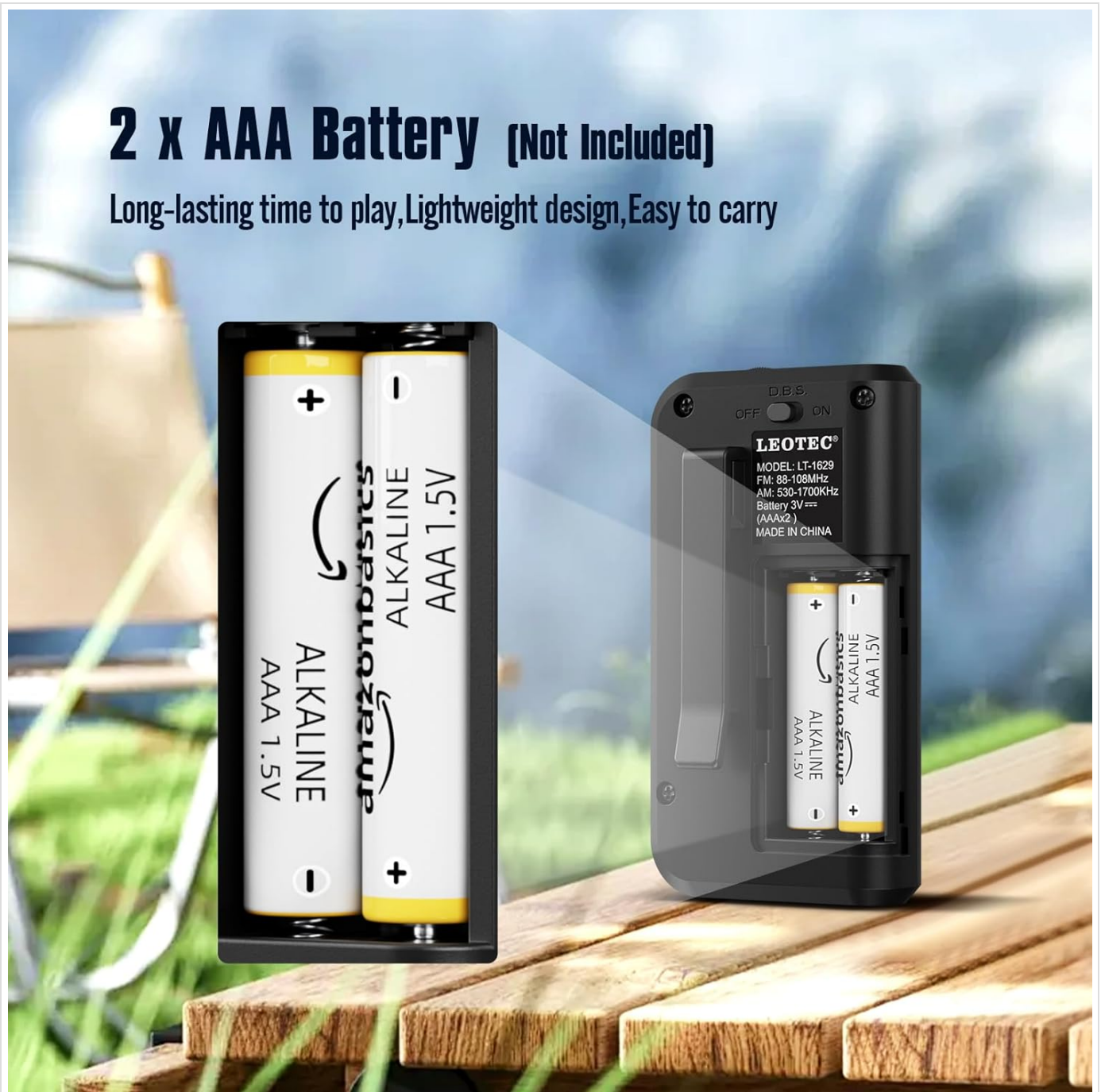
Image: The open battery compartment of the radio, clearly showing the slots for two AAA batteries and their polarity markings.

Long-lasting time to play, Lightweight design, Easy to carry