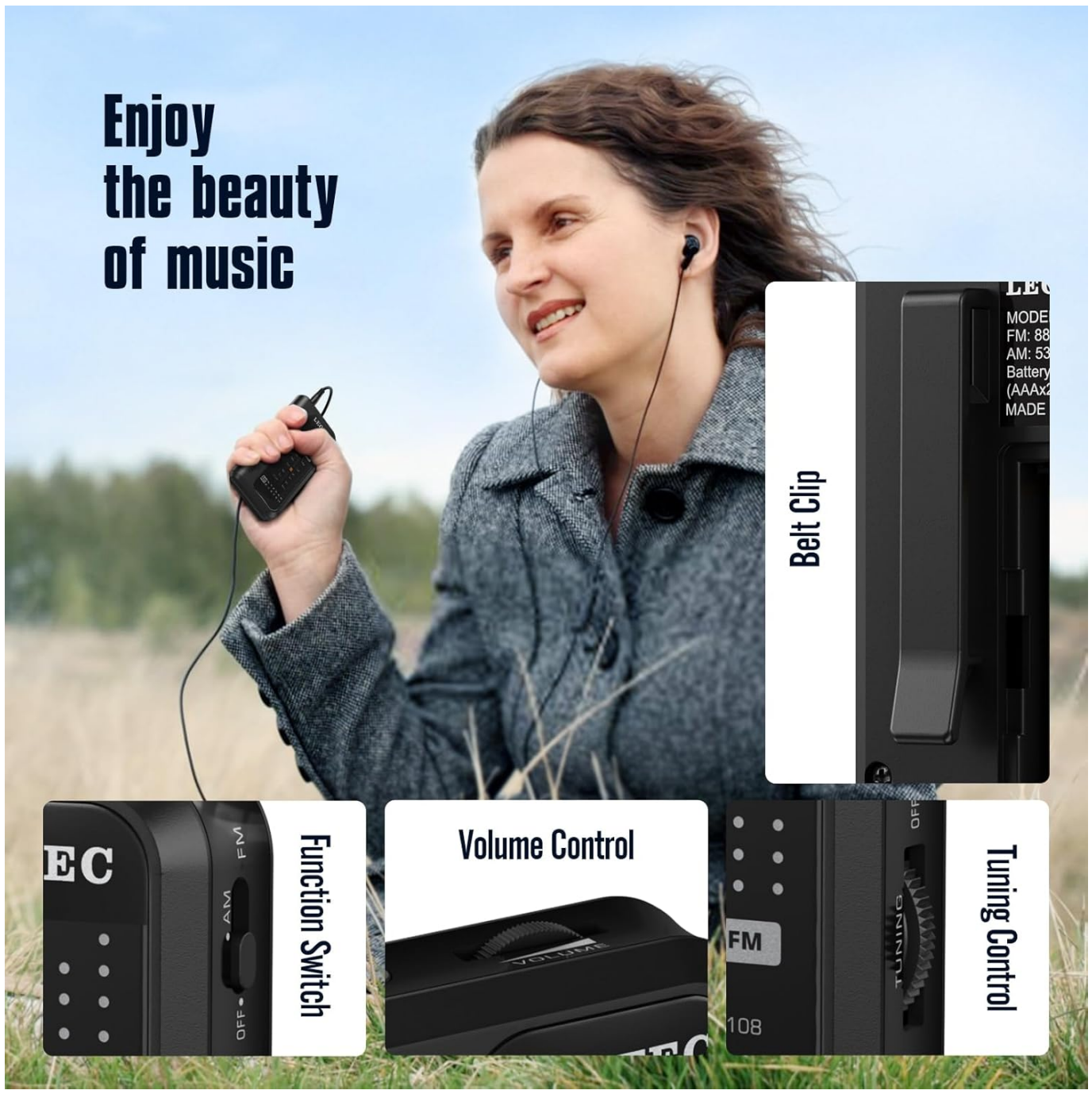
Image: Close-up view highlighting the radio's controls: Function Switch (OFF/AM/FM), Volume Control, and Tuning Control. A belt clip is also visible on the side.