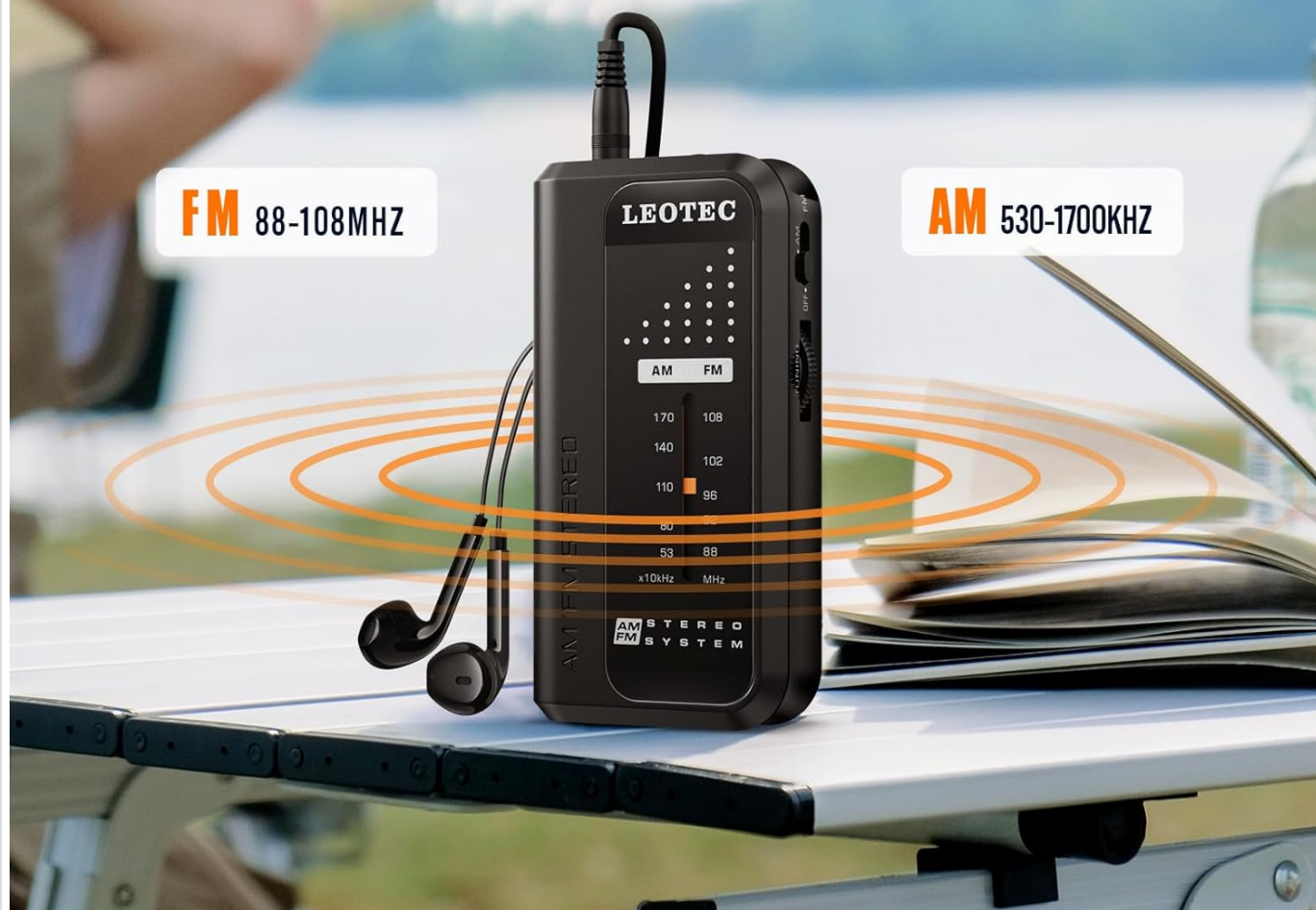
Image: Front view of the LEOTEC Portable AM FM Radio, showing the display, controls, and connected earphones.