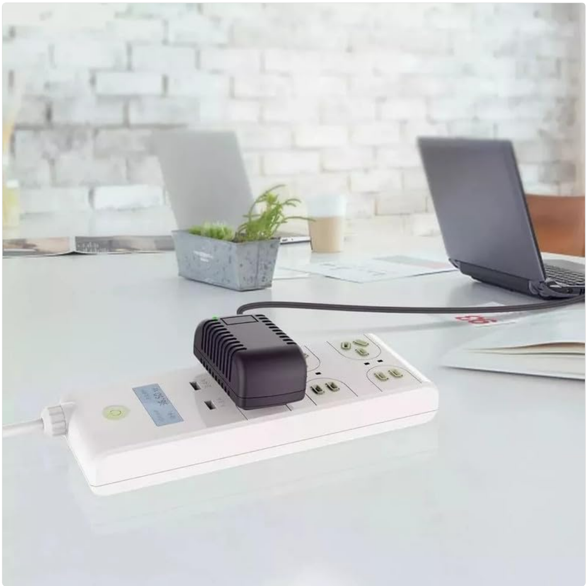
Image: The power adapter plugged into a power strip, demonstrating a typical setup for use.