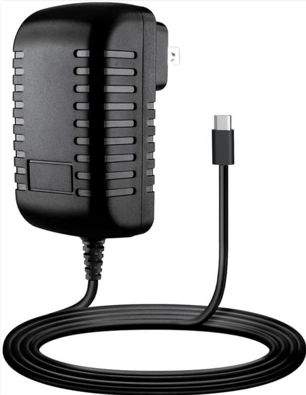
Image: The Pxdliiry 5V USB Type-C Replacement Power Adapter, showcasing its compact design and integrated USB-C cable.