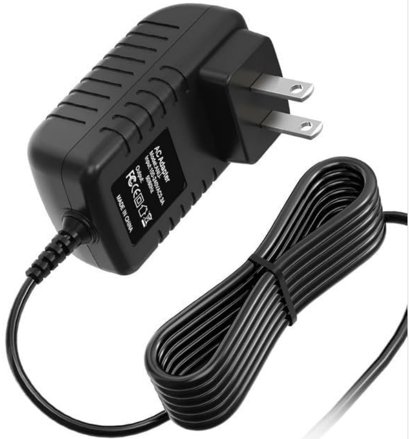
Image: Detailed view of the adapter, highlighting its robust construction including the American plug, thick copper core, and the flexible design of the power cord for durability.