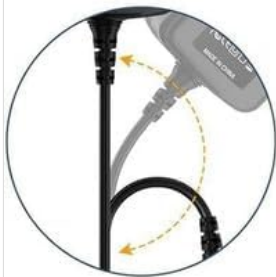
The Flexibility of the power cord