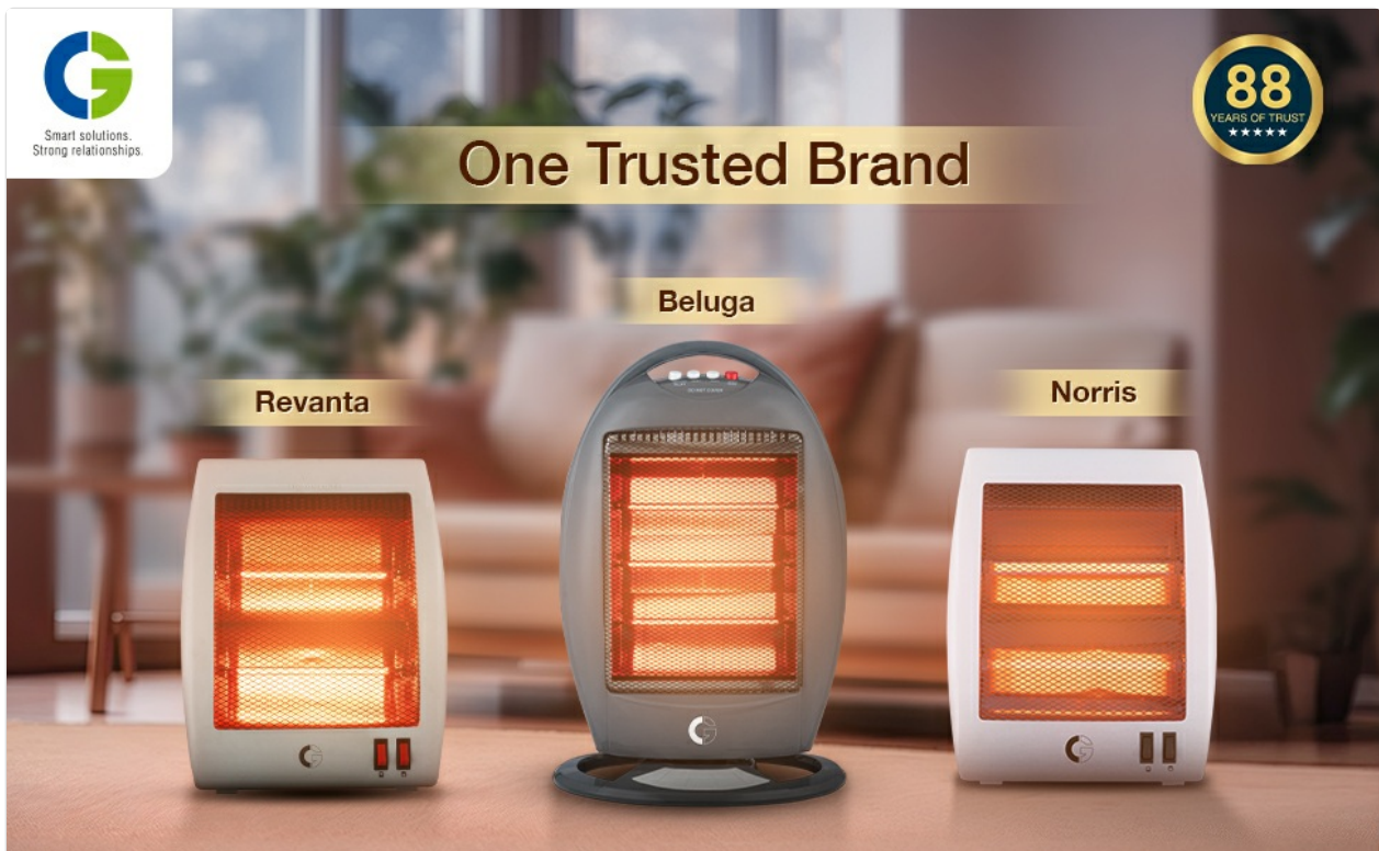
Image: The heater's long cord provides flexible placement options.