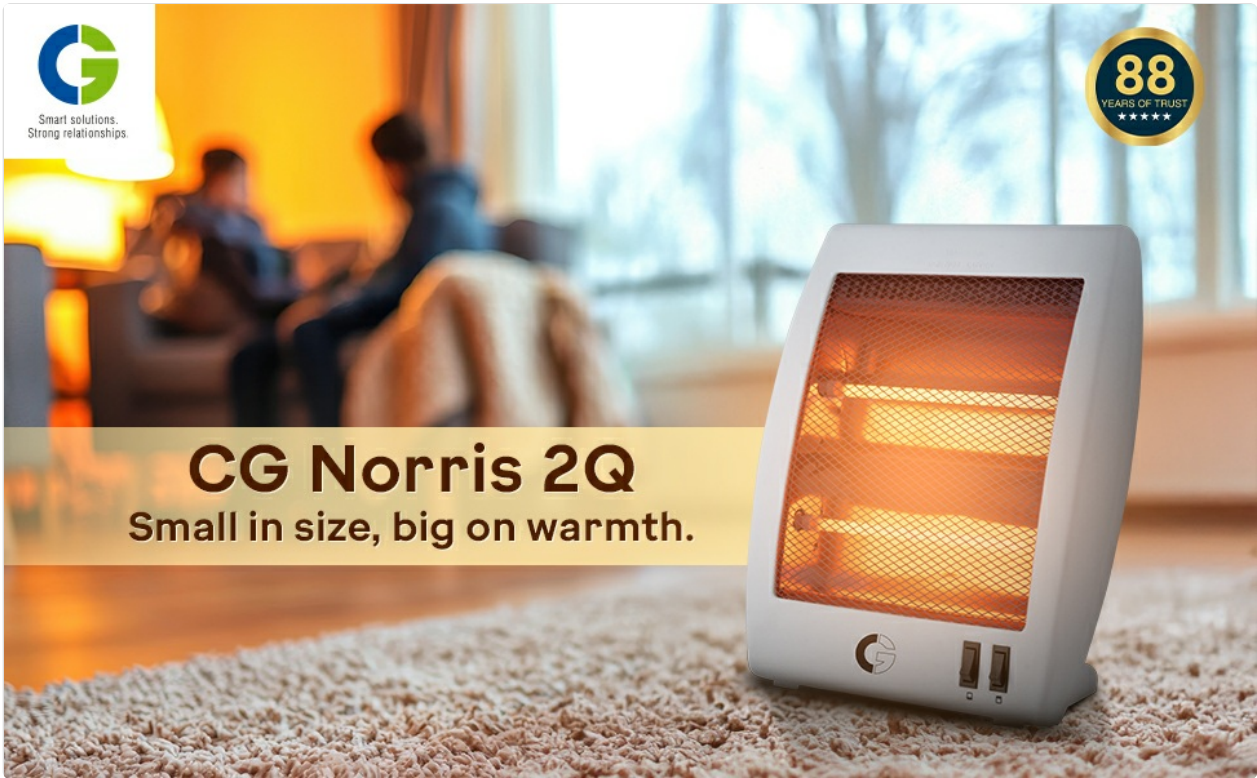
Image: Overview of key product features.