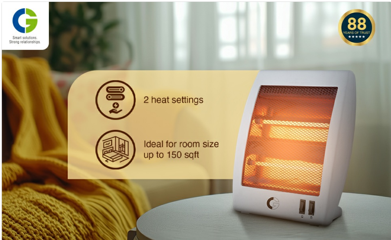
Image: The heater is suitable for various indoor spaces.

The product is marketed by CG Power and Industrial Solutions Limited, and manufactured by Morex Industries.