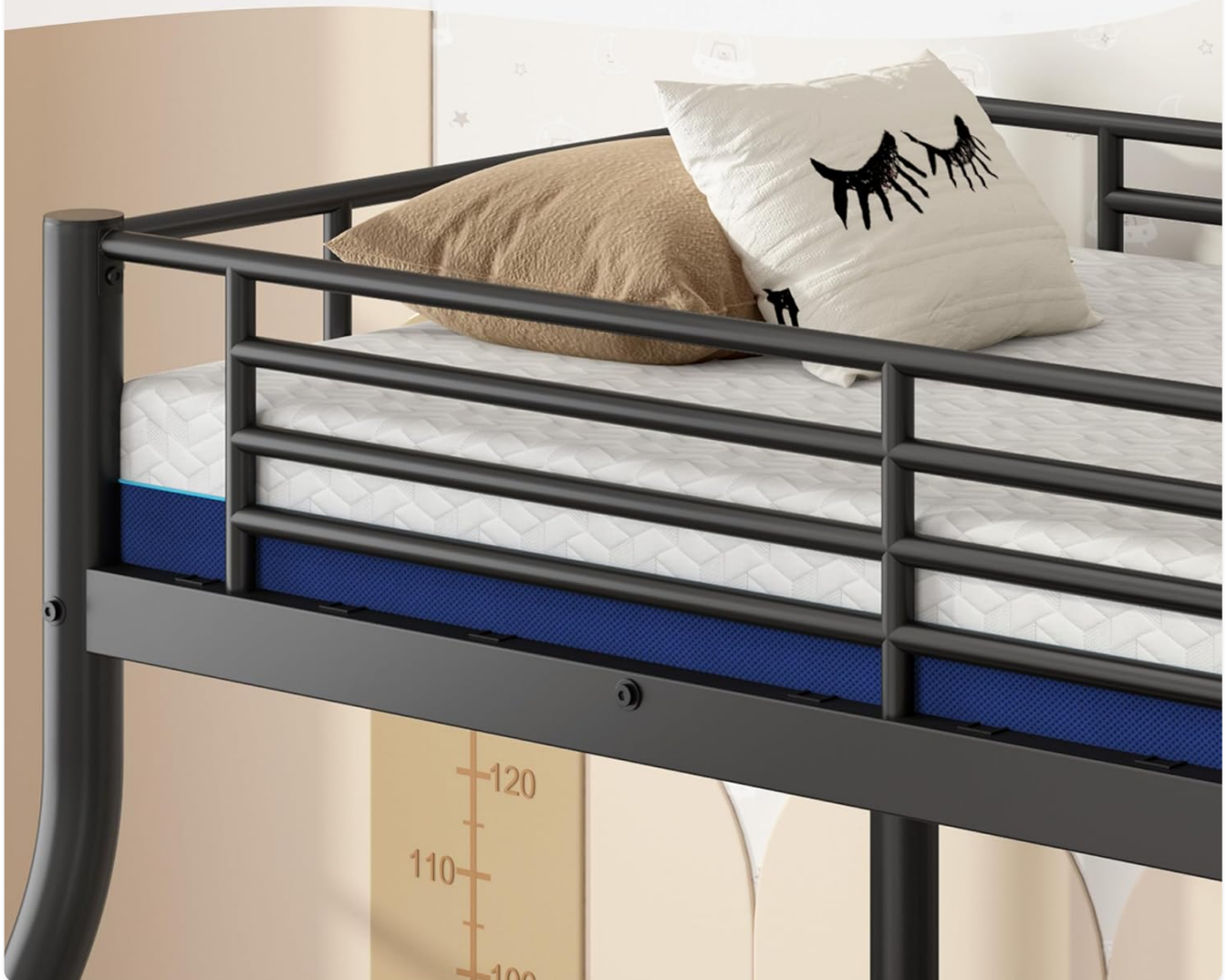
Image: Close-up of the top bunk showing the security guardrail and mattress.