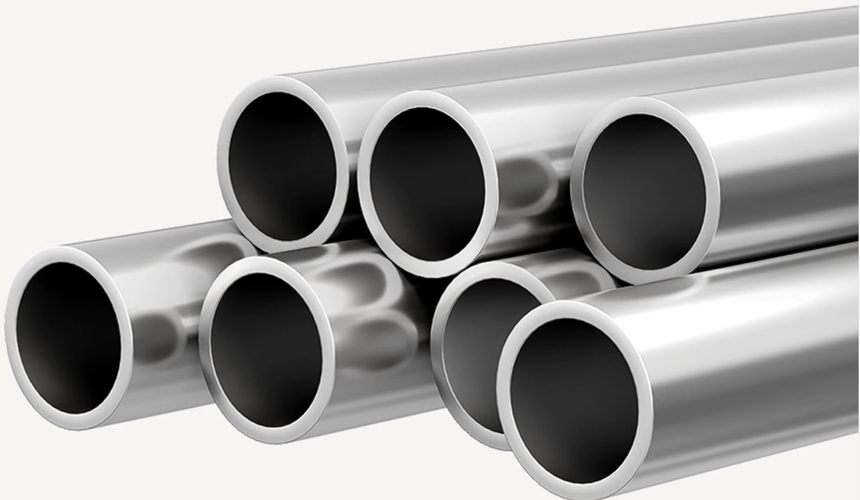
Image 4.1: Detail of the 1.5-inch thickened pipe wall, designed for robustness and corrosion protection.