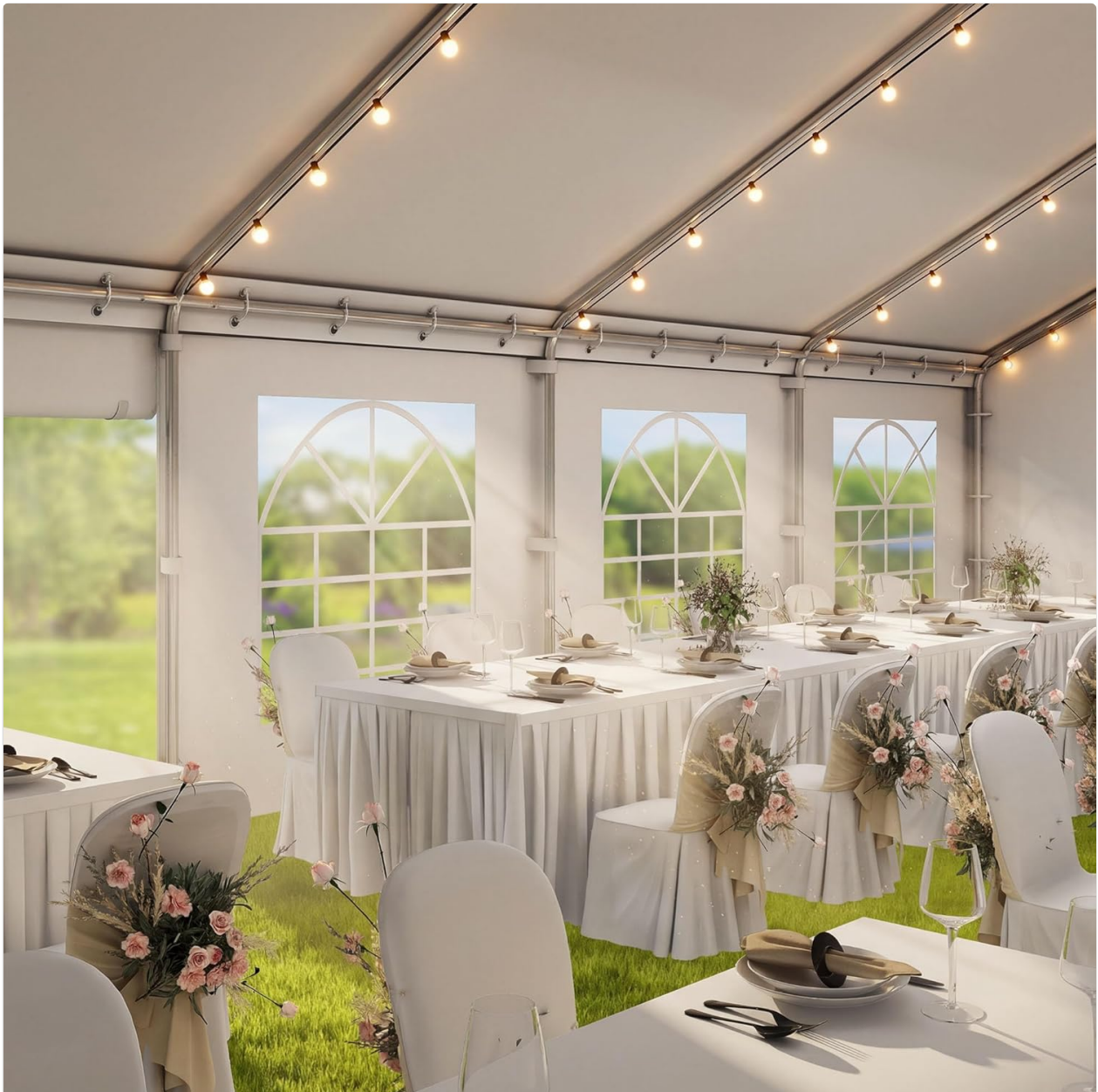
Image 5.1: Interior view showcasing the spacious comfort and natural light provided by the tent's design.