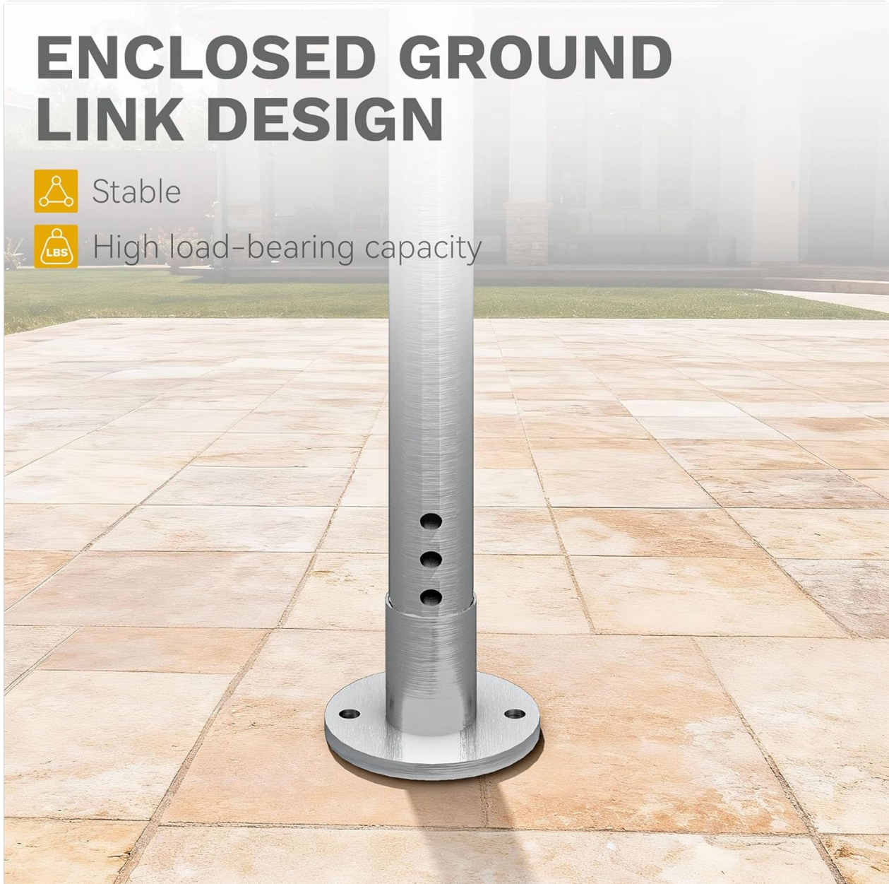
Image 4.5: The enclosed ground link design ensures stable and high load-bearing capacity.