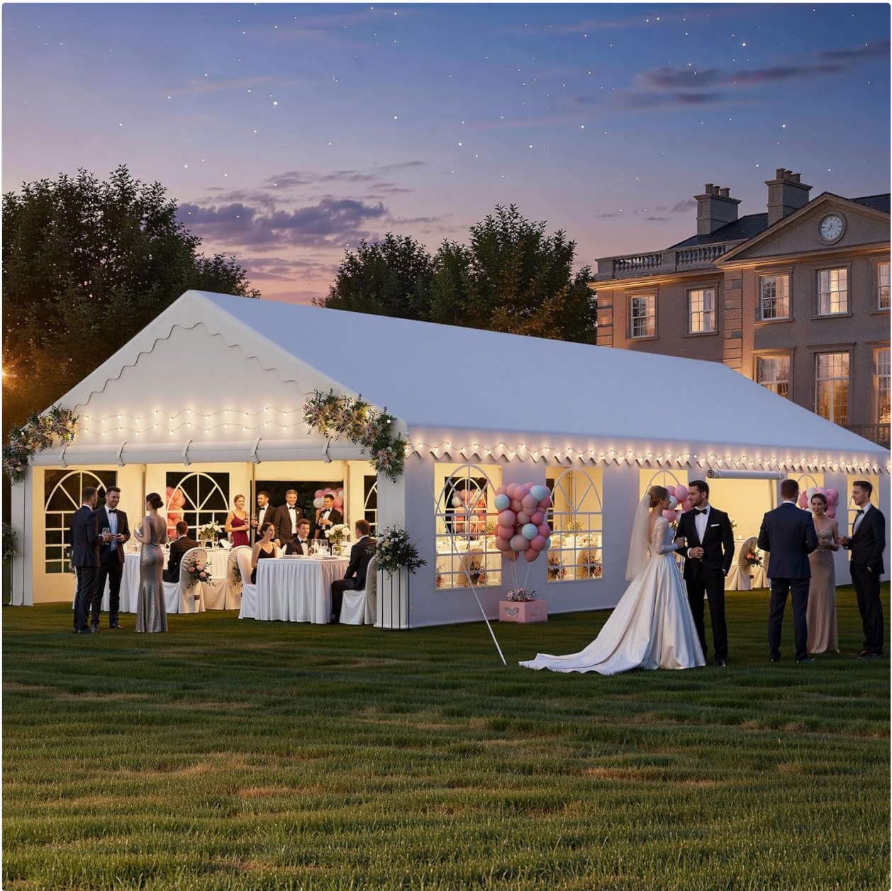
Image 1.1: The DWVO 20x40FT Party Tent providing shelter for an outdoor event.