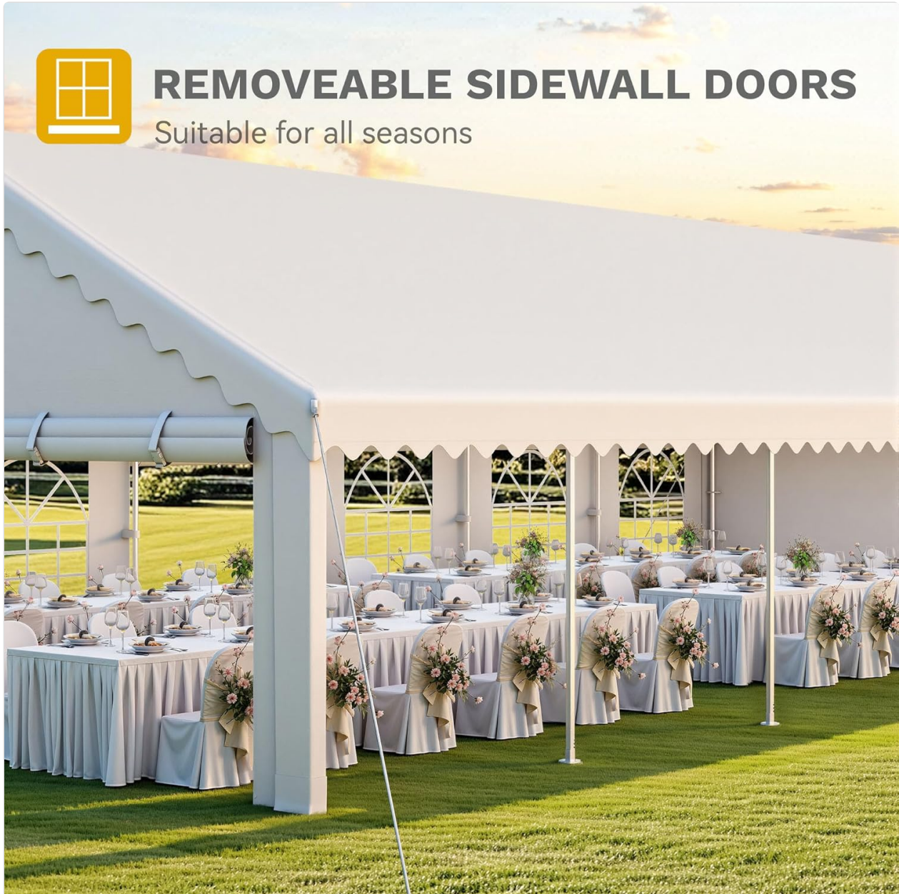
Image 4.3: Removable sidewall doors offer versatility for various seasons and events.