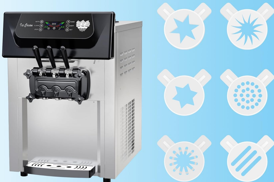
Figure 3.2: Selection of six interchangeable dispensing tips to create various soft serve shapes.