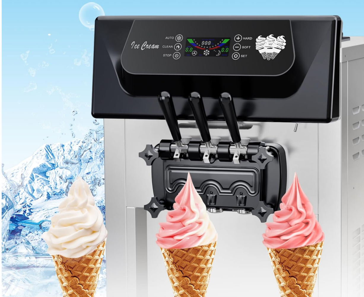
Figure 5.2: The machine can dispense two individual flavors and one combined 'twist' flavor.