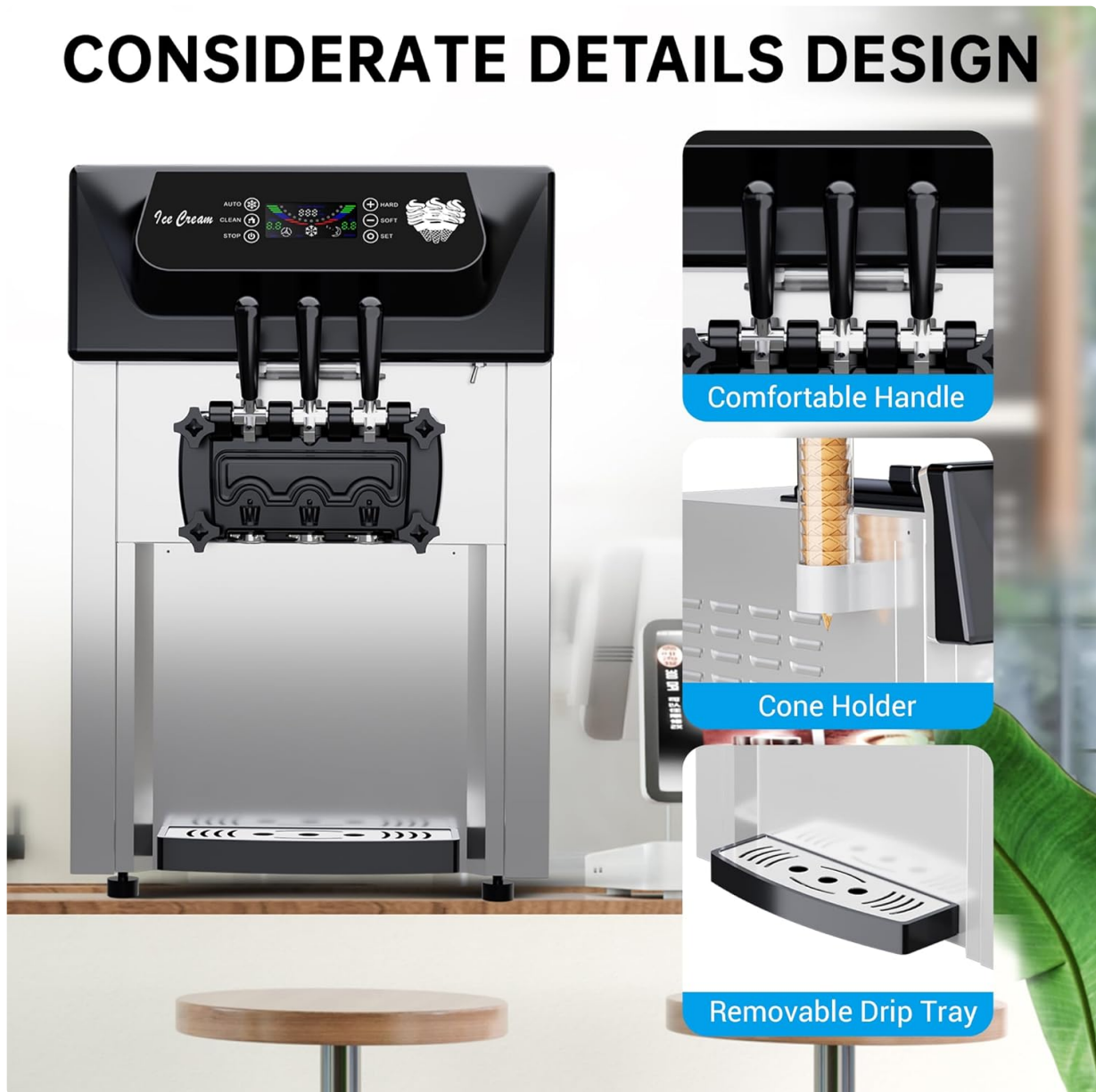
Figure 3.1: Key design details including the comfortable dispensing handles, integrated cone holder, and removable drip tray for easy cleaning.