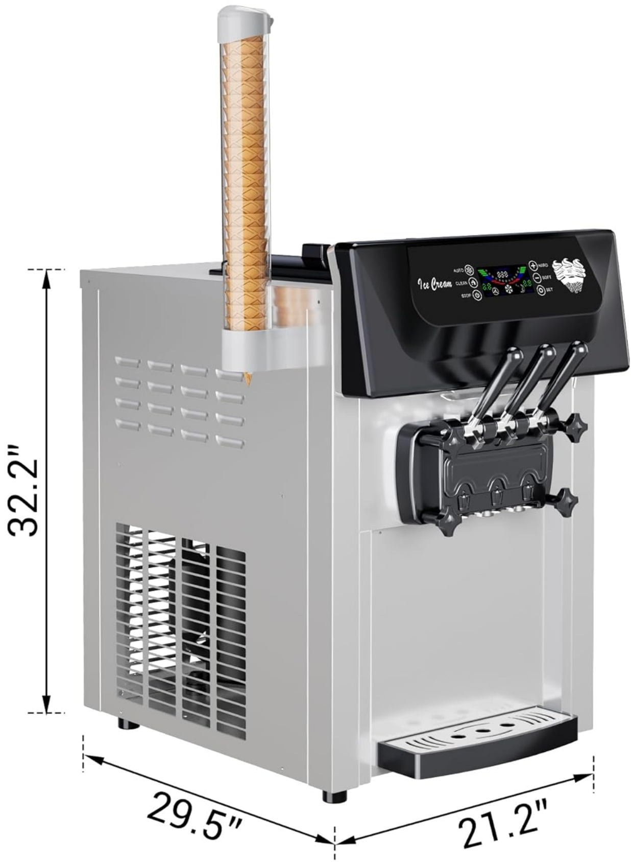
Figure 8.1: Product dimensions of the Festisoul YKF-8216T.