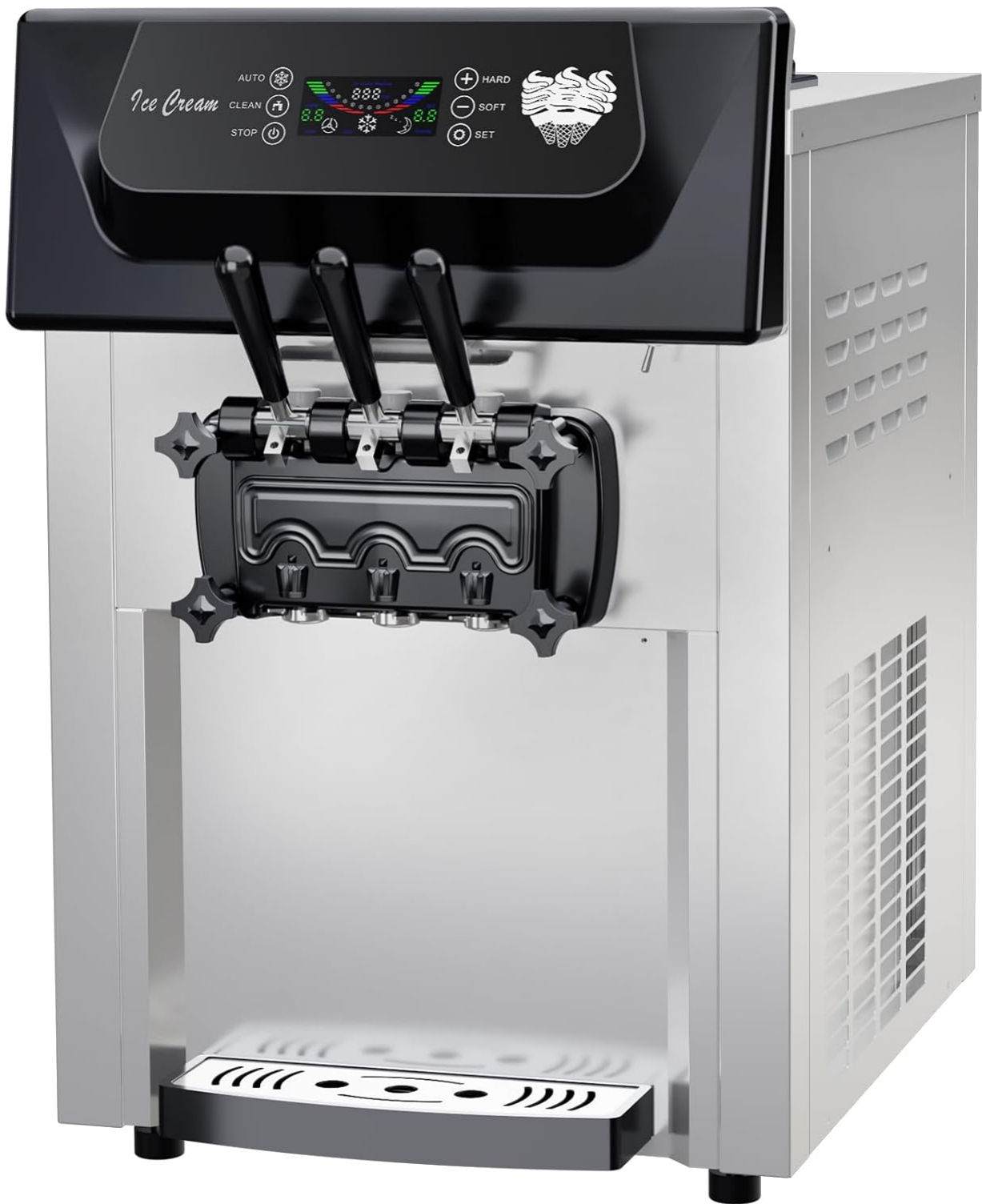
Figure 1.1: Front view of the Festisoul YKF-8216T Commercial Soft Serve Ice Cream Maker Machine.