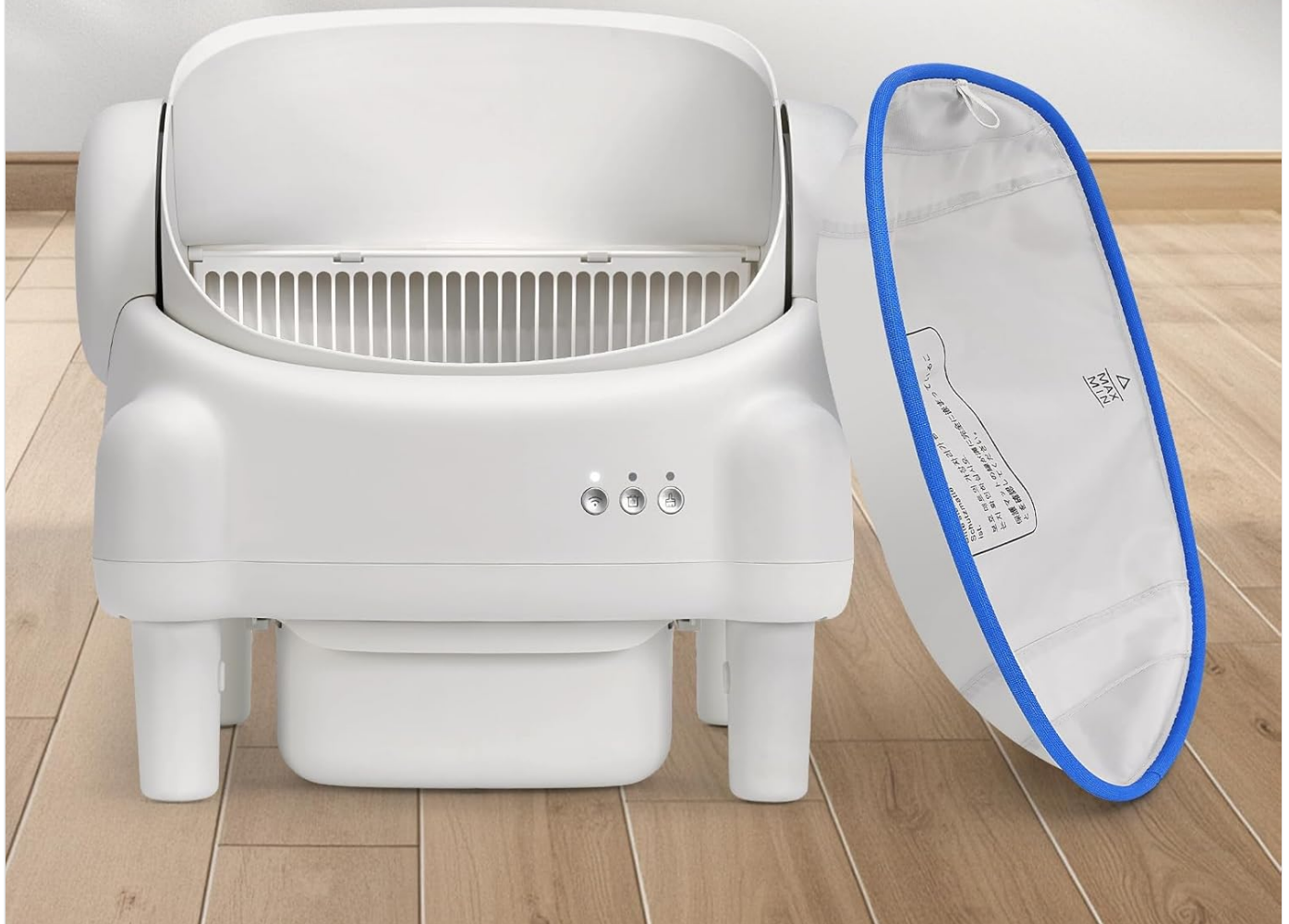
Image 2.1: The PARUUNTYS Waterproof Pad shown with a compatible self-cleaning litter box, highlighting its anti-stick, scratch-resistant, and waterproof features.