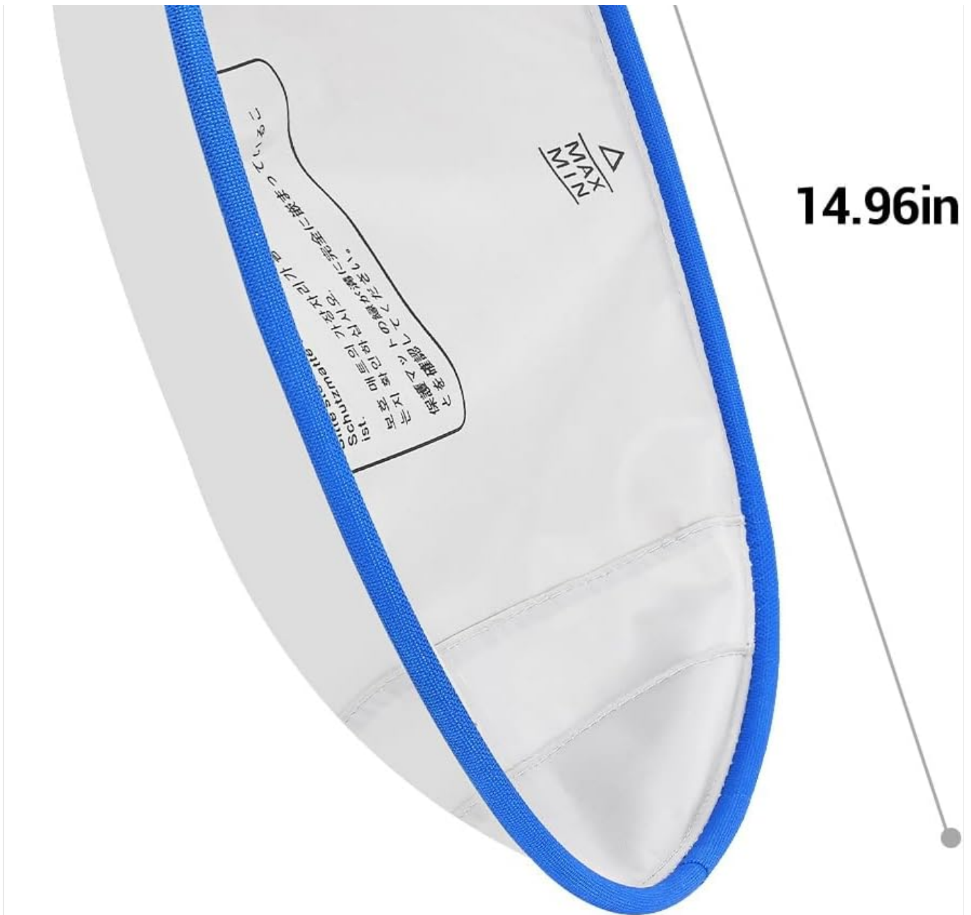
Image 7.1: The waterproof pad displaying its approximate dimensions for reference.