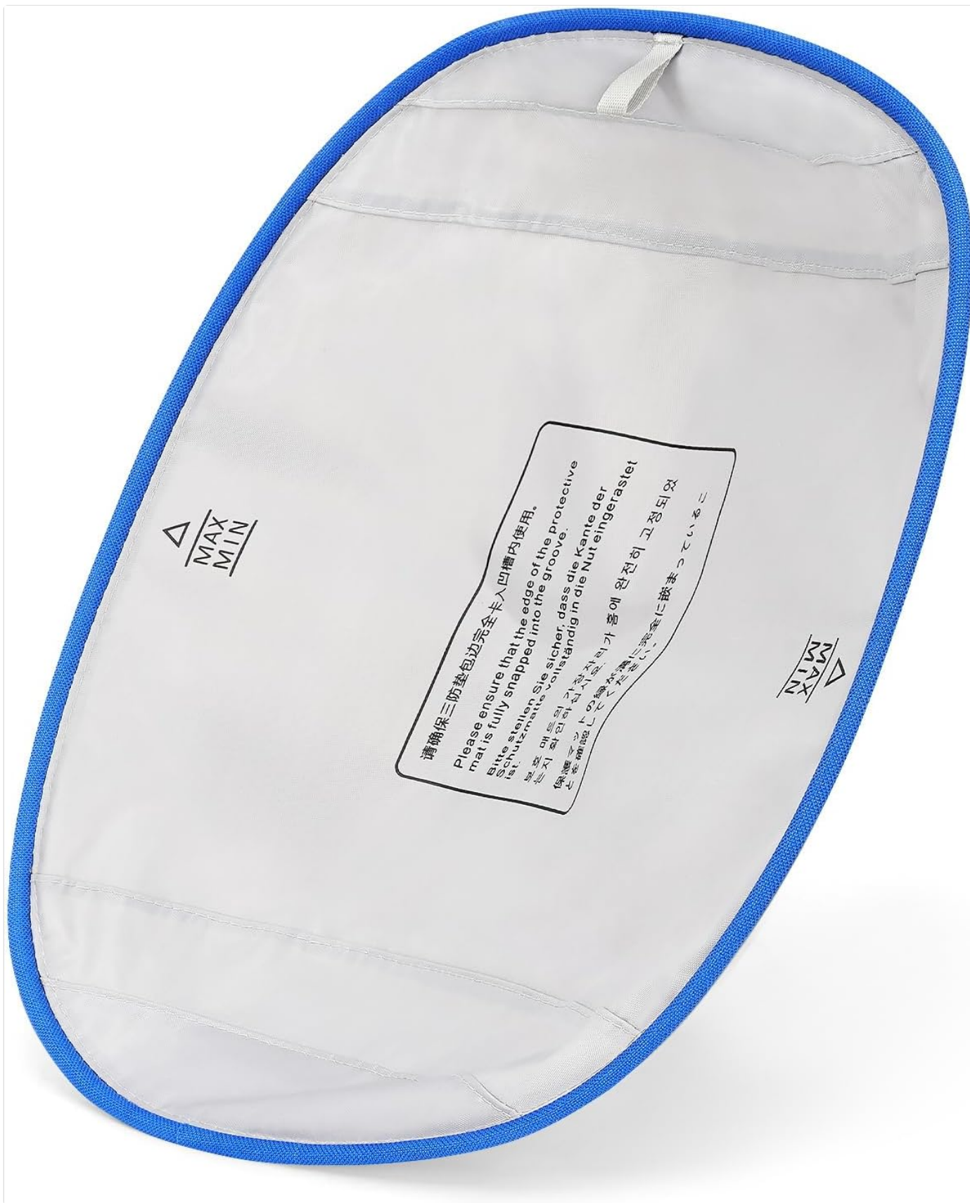
Image 3.1: The waterproof pad showing the protective edge, which should be securely fitted into the litter box.