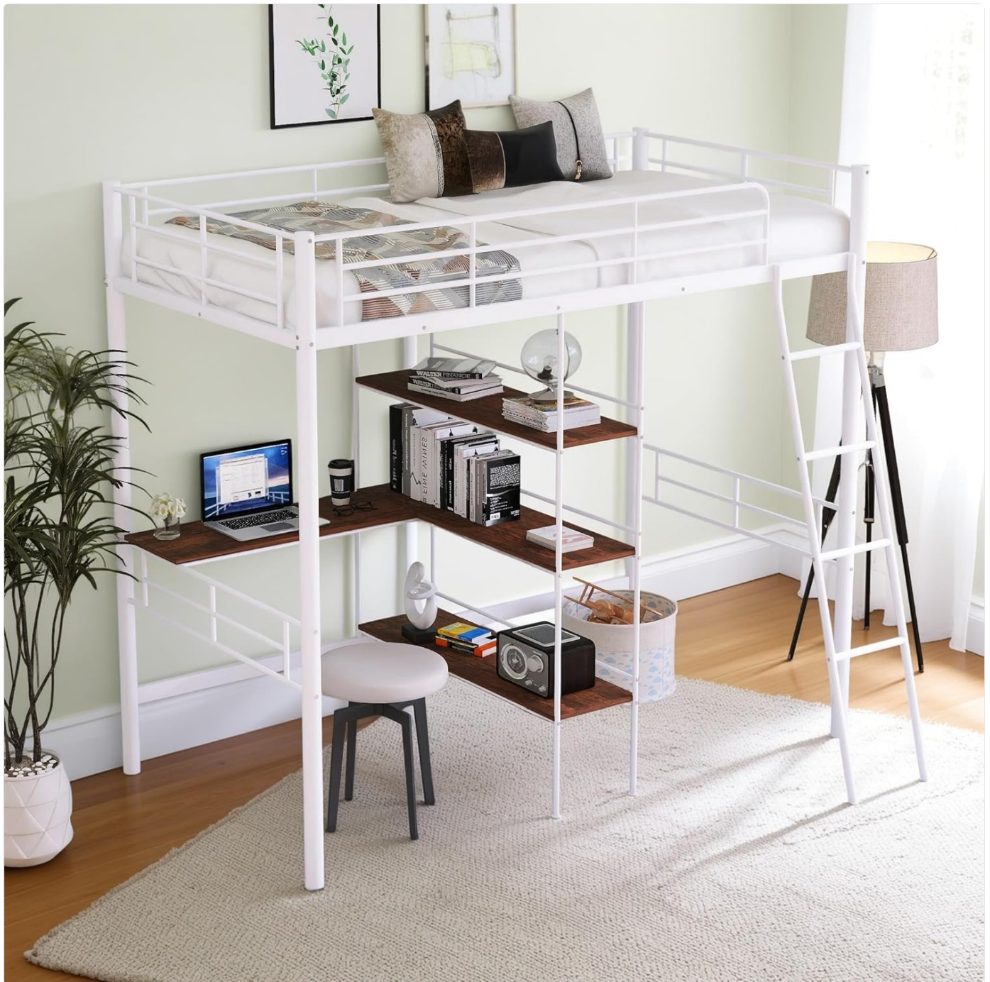
Figure 1: Overall view of the LINKHOO Twin Size Loft Bed, showcasing the elevated bed, L-shaped desk, and integrated shelving unit.