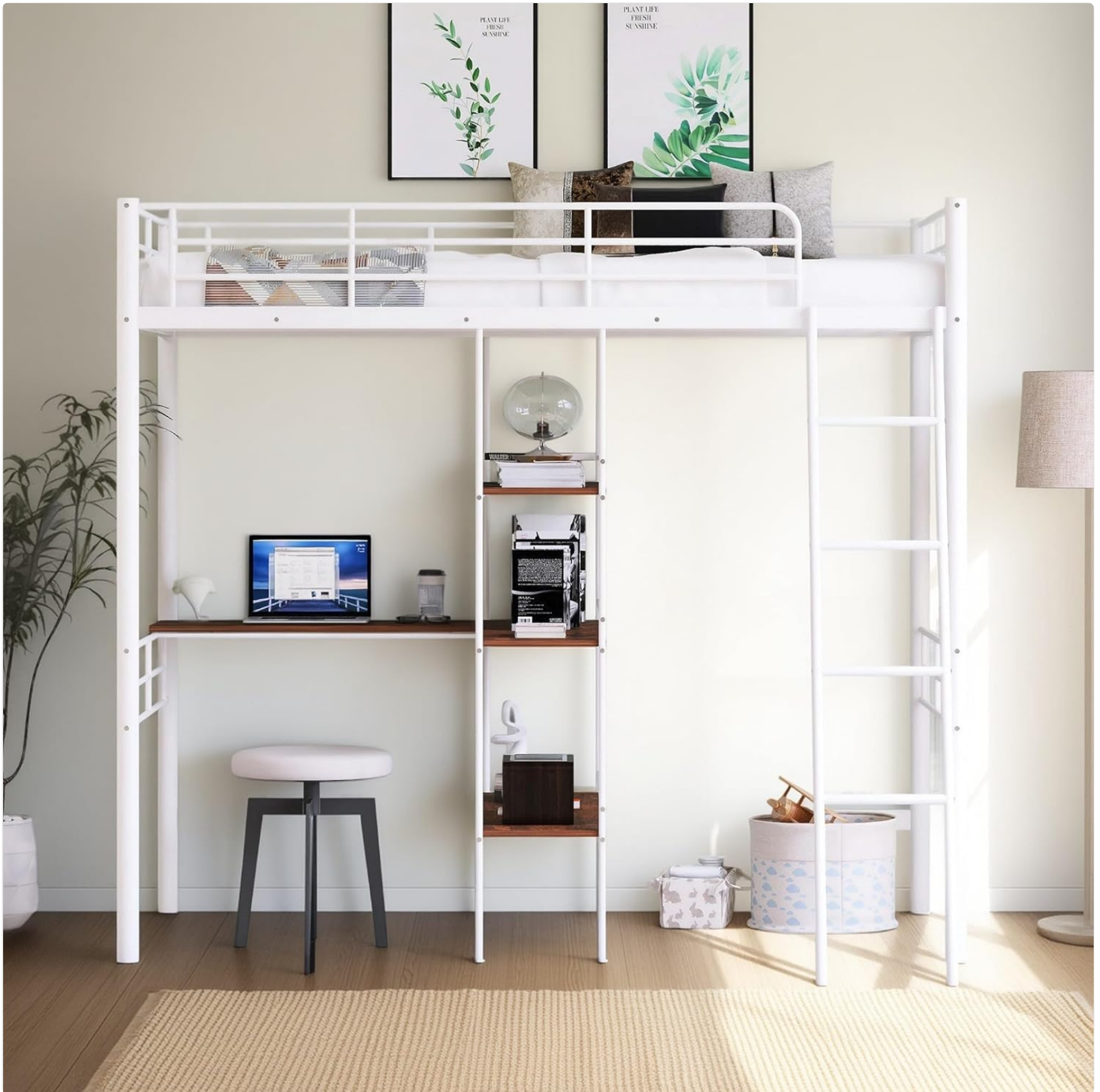
Figure 4: Front view of the loft bed, highlighting the spacious L-shaped desk and the three-tier shelving unit, ready for use.