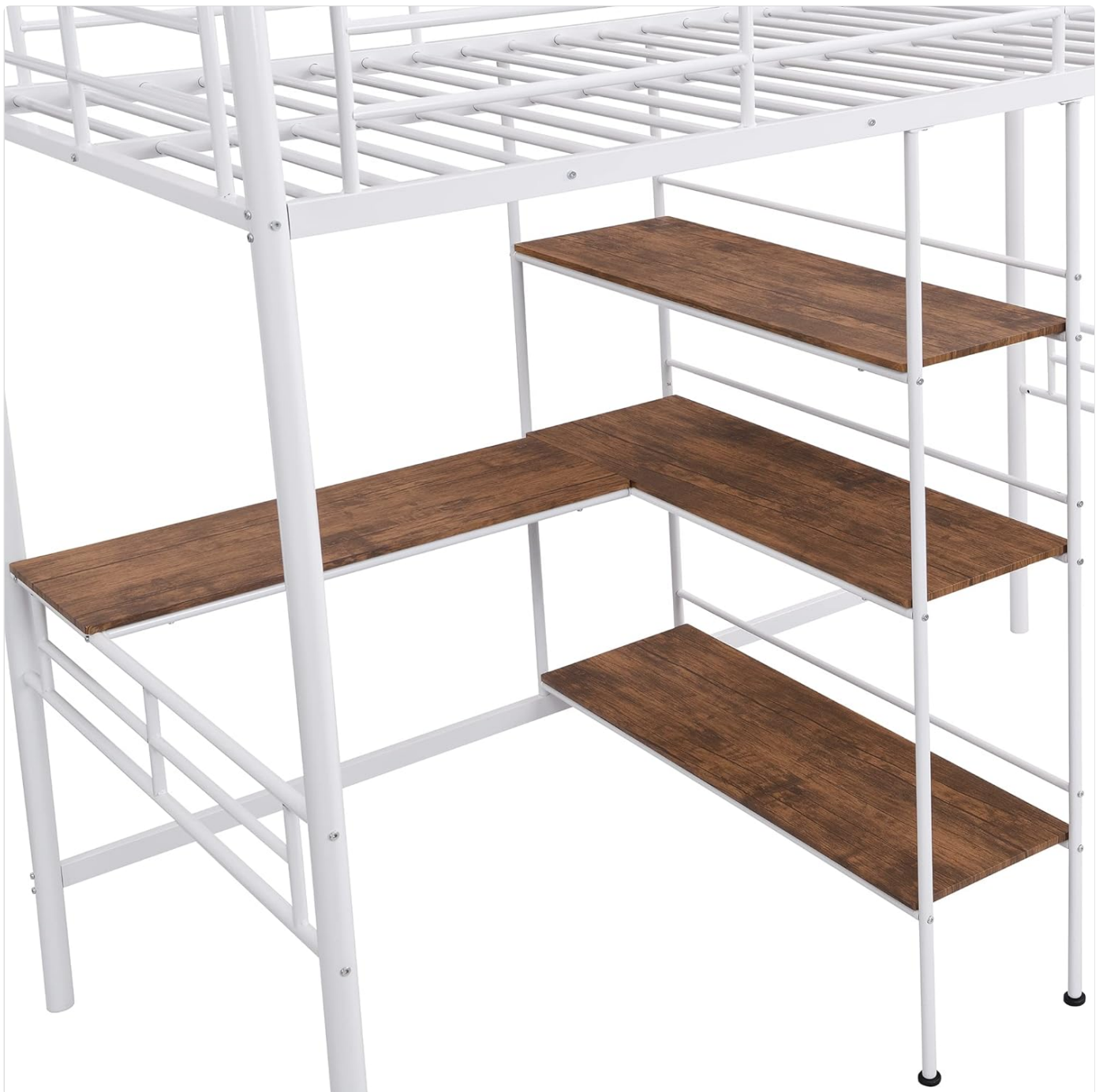
Figure 5: Close-up view of the L-shaped desk and integrated shelves, demonstrating the functional workspace and storage capabilities.