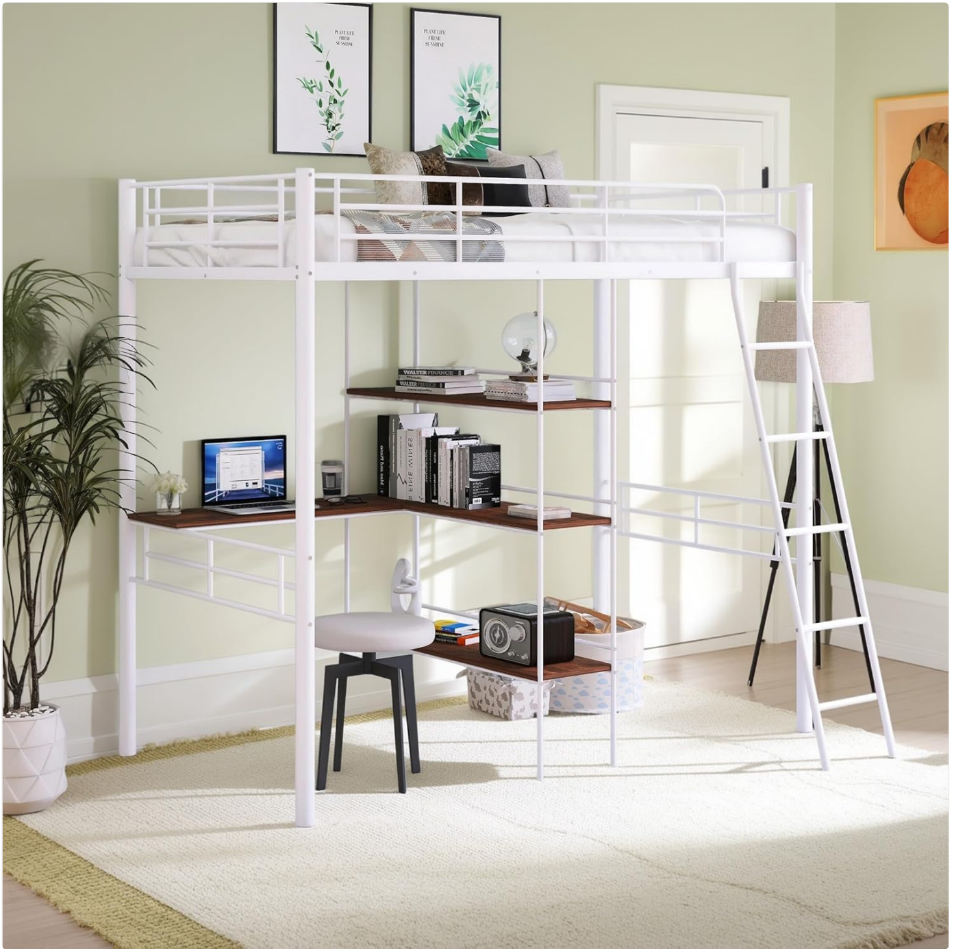
Figure 2: View of the loft bed structure, illustrating the metal frame and the L-shaped desk and shelves.