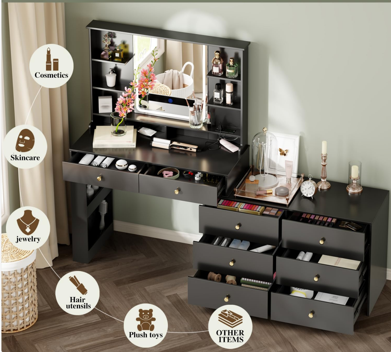
Image 2.1: Illustration of the vanity desk's extensive storage capacity, with drawers and shelves organized for various items.

Maximize storage in limited space and enhance convenience.