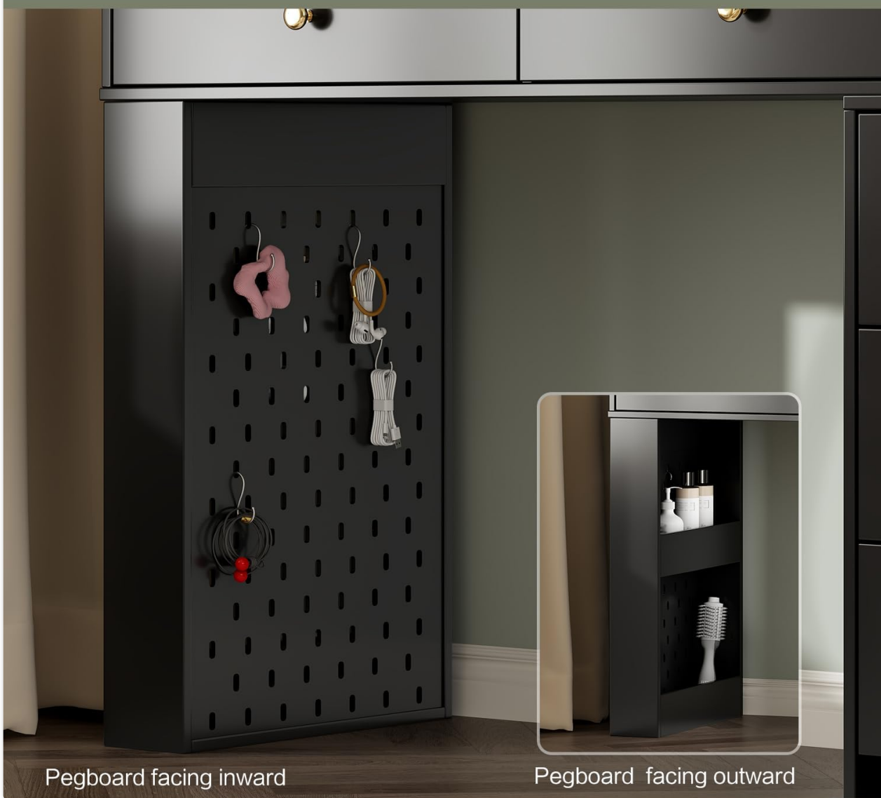
Image 2.2: Detail of the leg-area storage, featuring a pegboard for hanging small items and an alternative shelf configuration.

Double-sided storage design / two installation methods