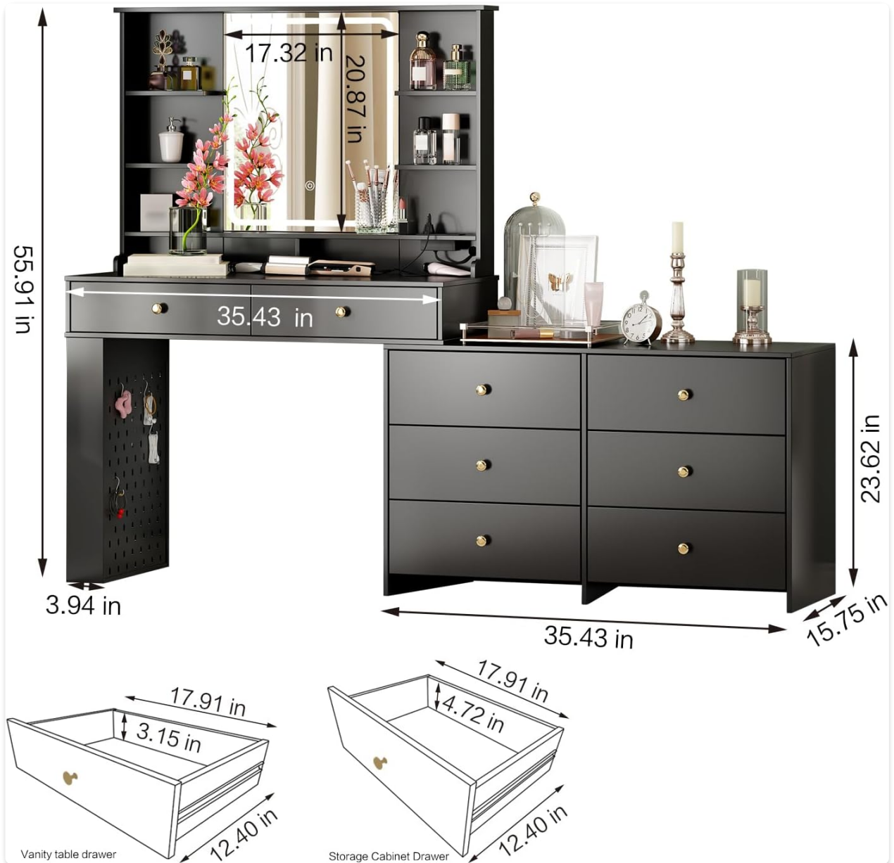
Image 3.1: Dimensional diagram of the vanity desk, useful for planning placement and assembly.