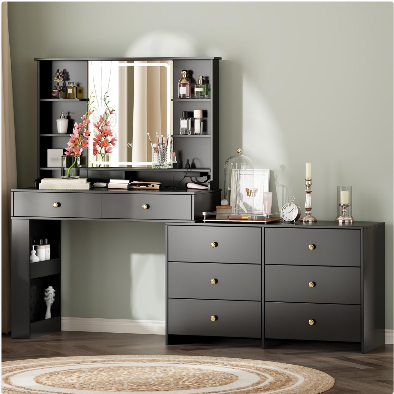
Image 1.1: The leejdn Makeup Vanity Desk with Mirror and Lights, Model 808, in a typical bedroom setting.