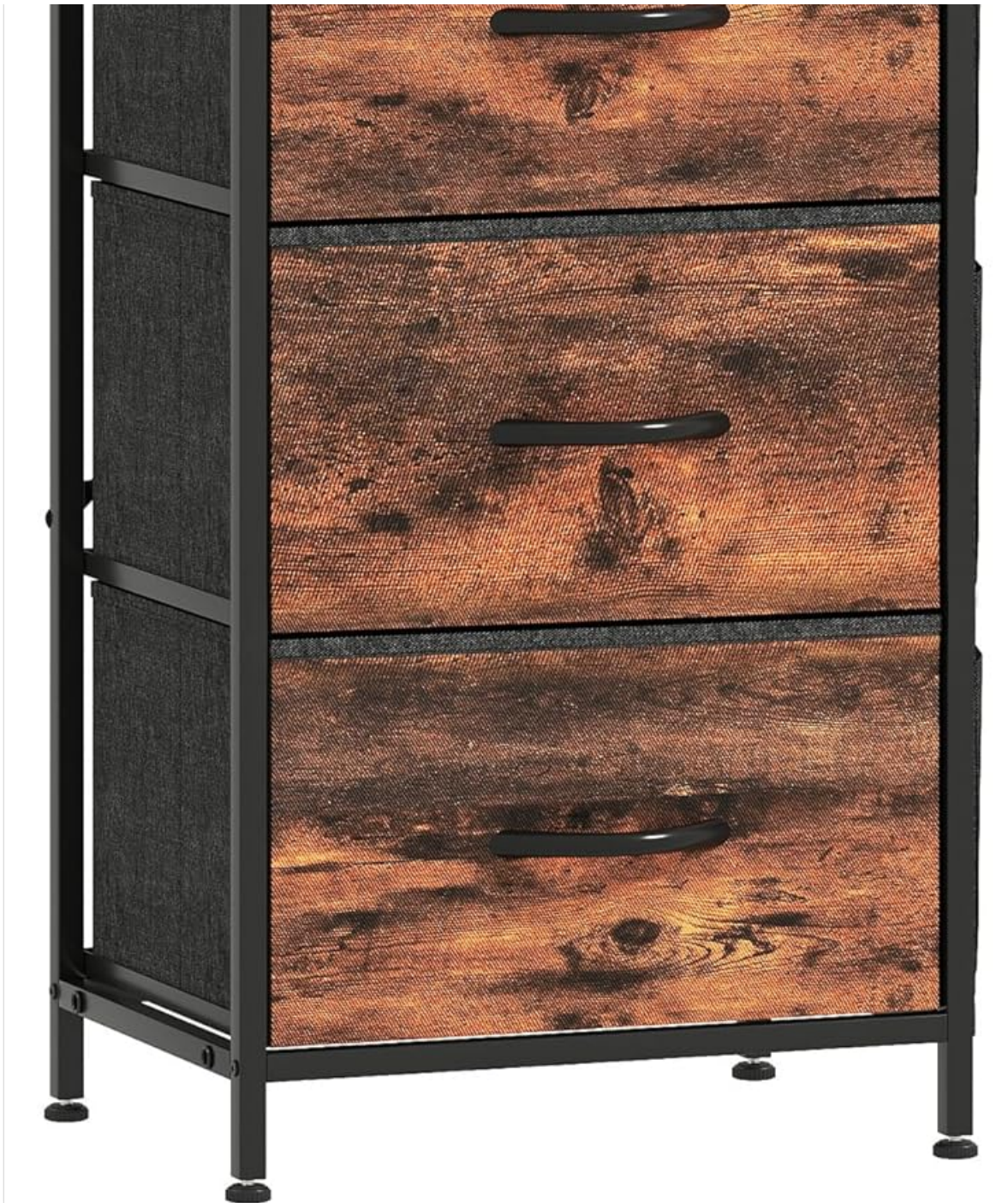
Image: Front view of the HOMCOM 4-Drawer Fabric Dresser, showcasing its rustic brown fabric drawers, black steel frame, and top surface.