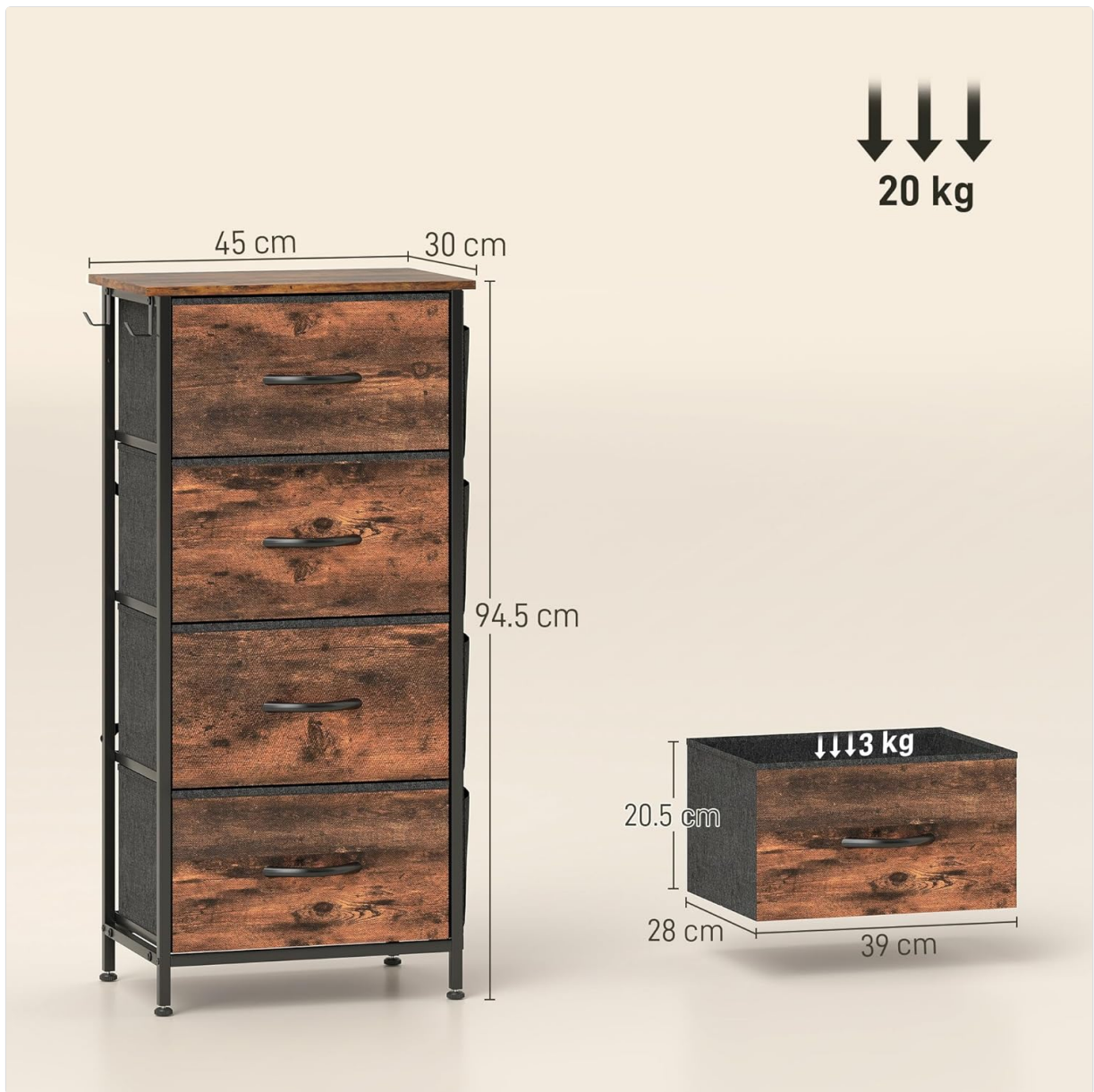
Image: Diagram illustrating the overall dimensions of the dresser (45W x 30D x 94.5H cm) and the inner dimensions of a single drawer (39W x 28D x 20.5H cm), along with total and individual drawer weight capacities.