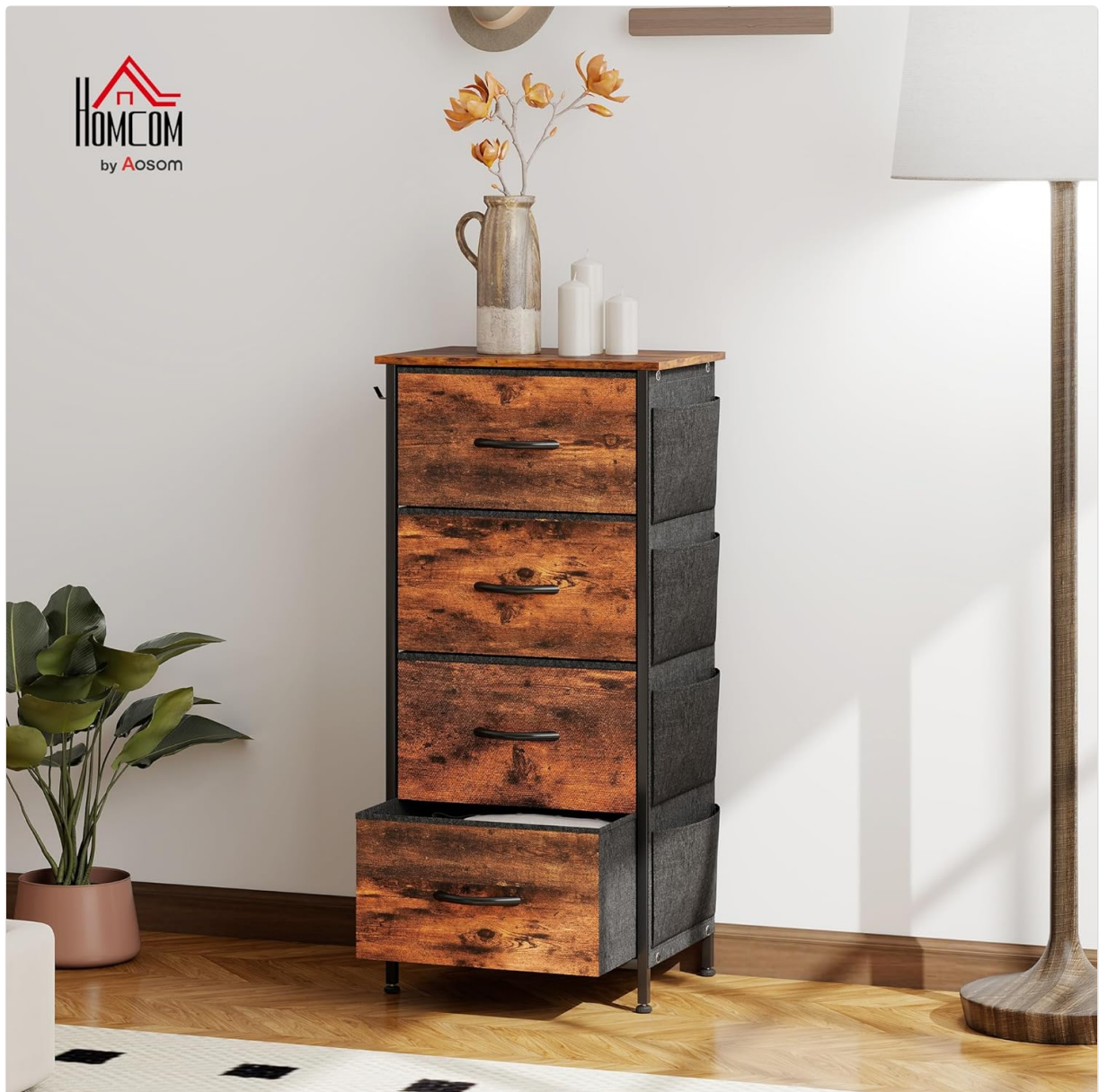
Image: The HOMCOM dresser positioned in a room, demonstrating its functional design with one drawer partially open, revealing storage space.

All necessary tools for assembly are typically included in the package.