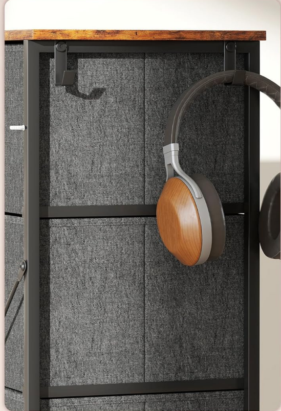
Image: Detailed view of the dresser's side, showing the four storage pockets holding small items and two hooks with headphones, demonstrating extra storage capabilities.

Hang hats, headphones, towels for easy grab-and-go access