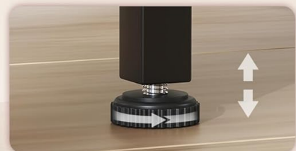
Adjustable Foot Pads

Image: Detailed view of the dresser's steel frame, X-shaped reinforcement bars, adjustable feet, and the anti-tip kit, highlighting structural stability and safety features.