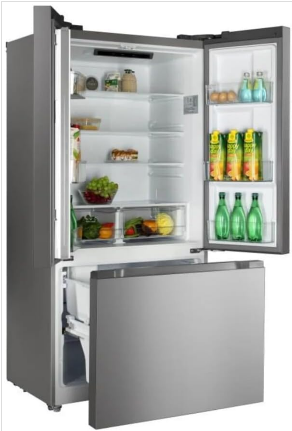
Image: The interior of the refrigerator compartment, displaying adjustable glass shelves, two crisper drawers, and door bins filled with

The fresh food section includes three spill-proof glass shelves that can be adjusted to accommodate items of various heights. Two humidity-controlled crisper drawers are ideal for storing fruits and vegetables, helping to maintain their freshness. Six door racks, including a gallon door balcony, provide ample space for condiments, beverages, and larger containers.