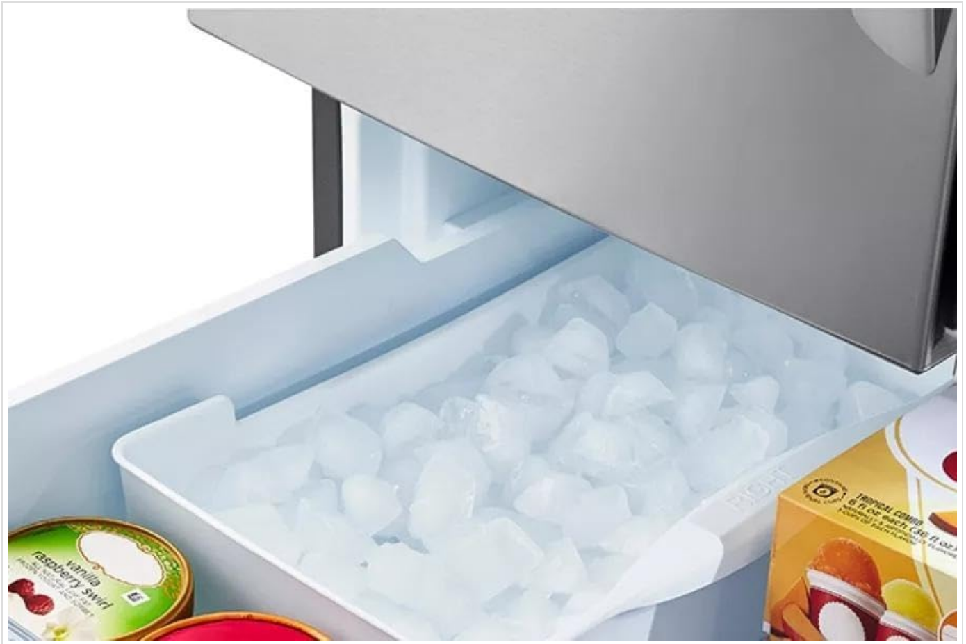
Image: A close-up view of the freezer drawer, showing the automatic ice maker bin filled with ice cubes.

The bottom-mount freezer features an inner drawer for organized storage of frozen goods. The automatic ice maker continuously produces ice, which is stored in a dedicated bin for easy access. Bottom ventilation ensures enhanced freezing performance.