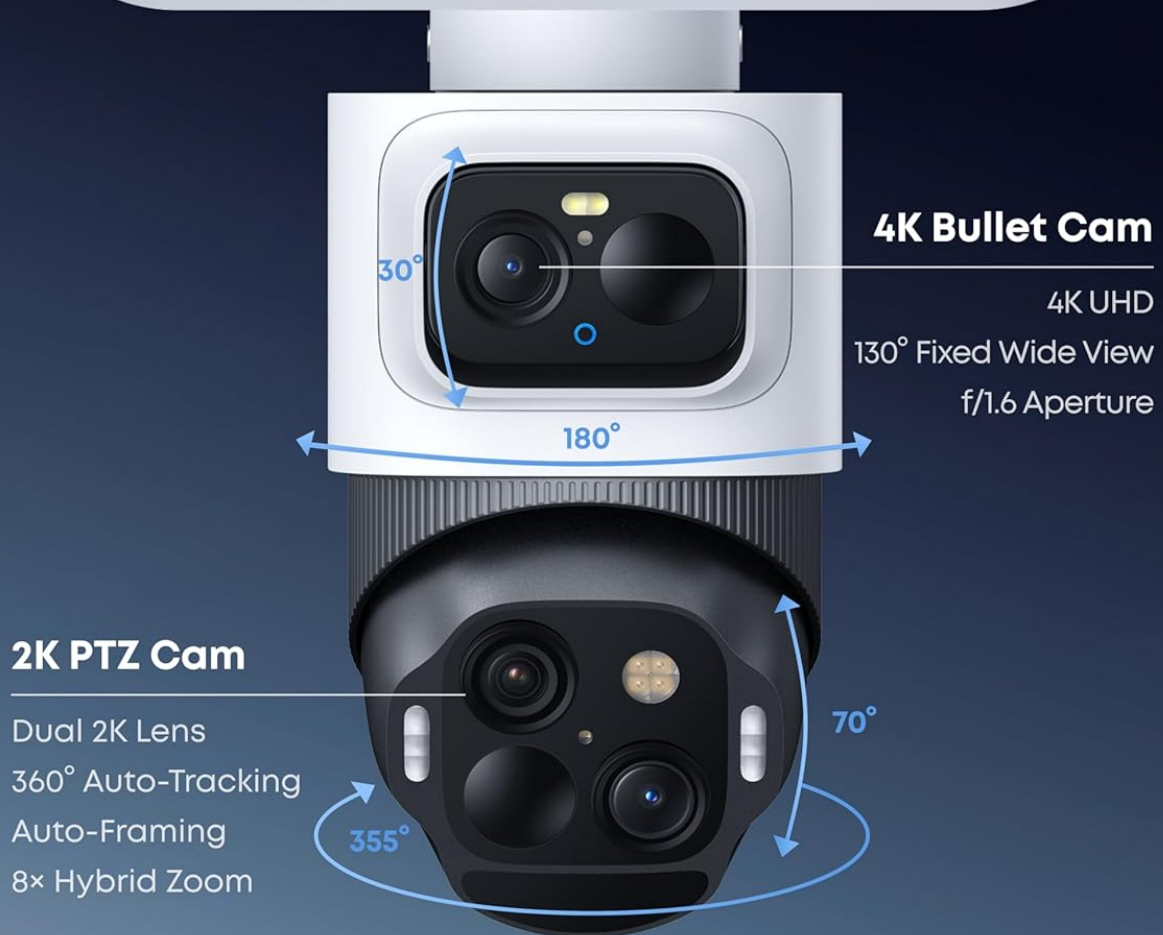
Image: Diagram illustrating the 4K bullet cam and 2K PTZ cam components of the eufyCam S4.