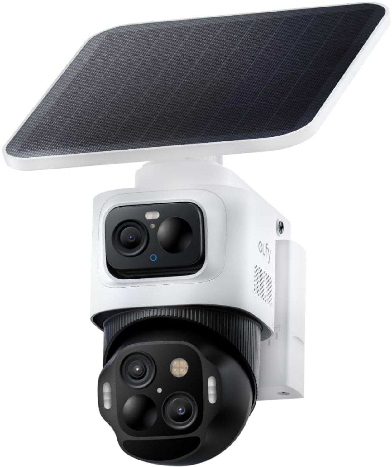
Image: eufyCam S4 camera with integrated solar panel.