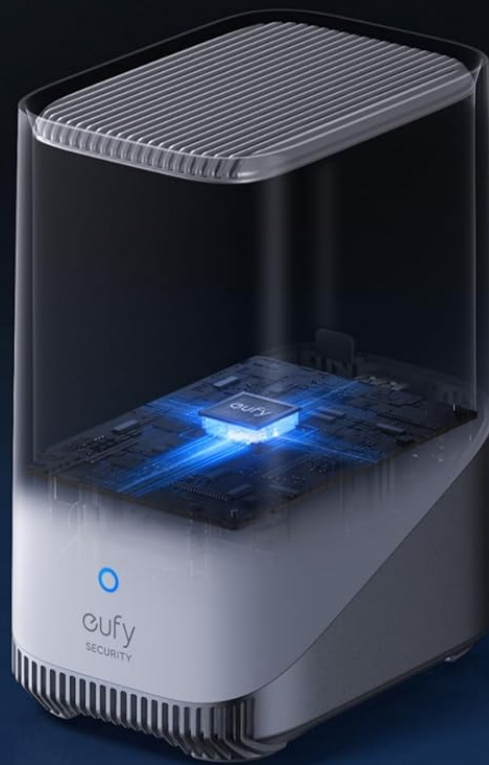
HomeBase S380 (Sold Separately)

Image: Examples of intelligent auto-framing, showing single-target and group tracking by the eufyCam S4.