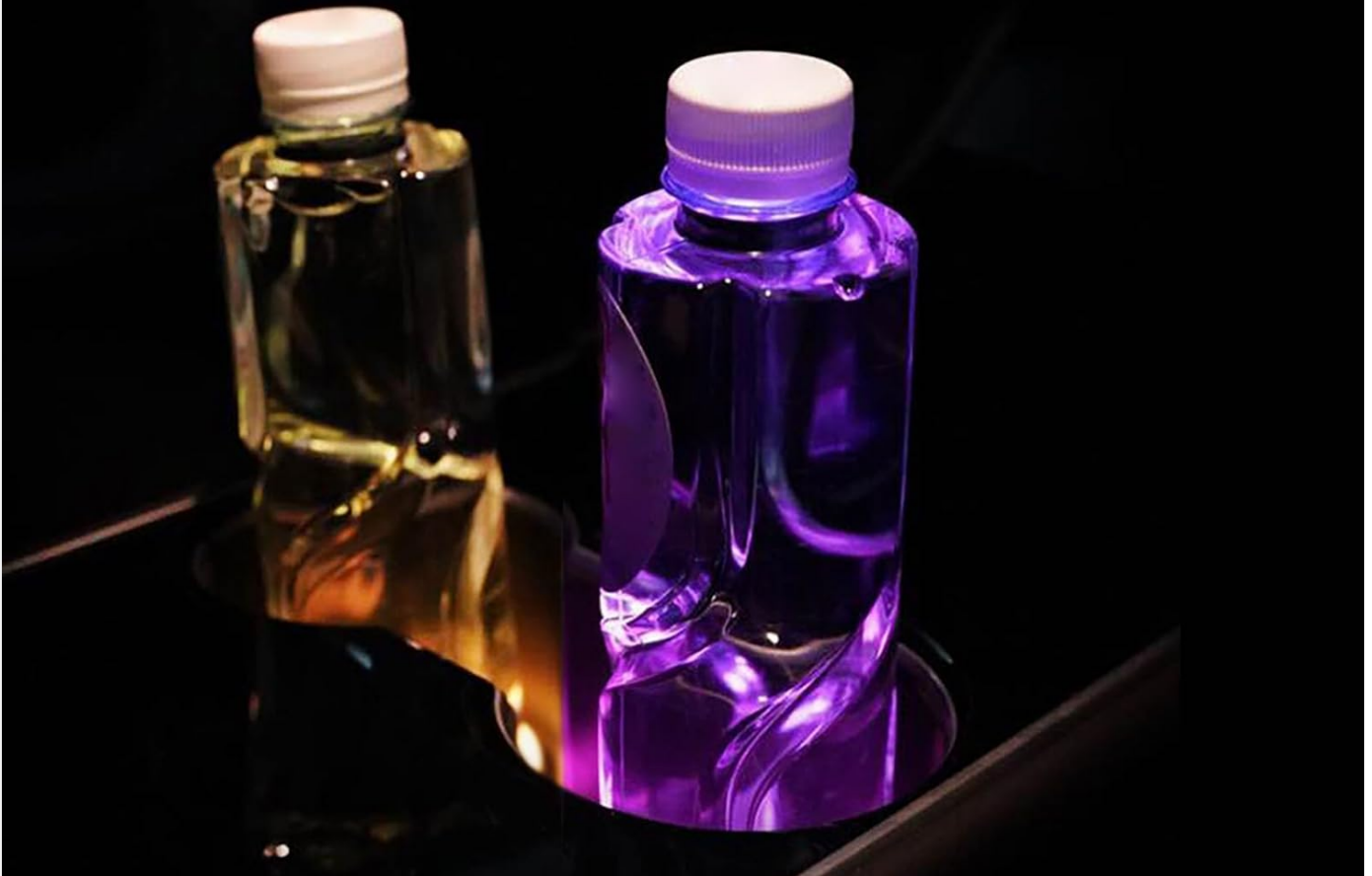
Figure 5: The LED cup holder lights automatically activate in dark conditions, illuminating beverages.

Vibration sensor/intelligent light sensor, it will automatically shut down when it is stationary for 15 seconds or when it encounters strong light