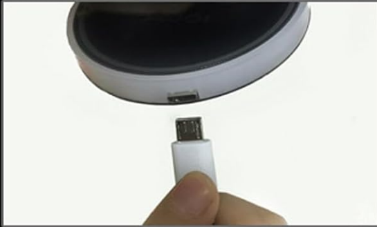
USB port charging

Press the back button for 3 seconds to flash, then you can turn on/off