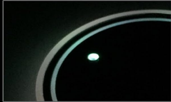
Coast mat photosensitive hole