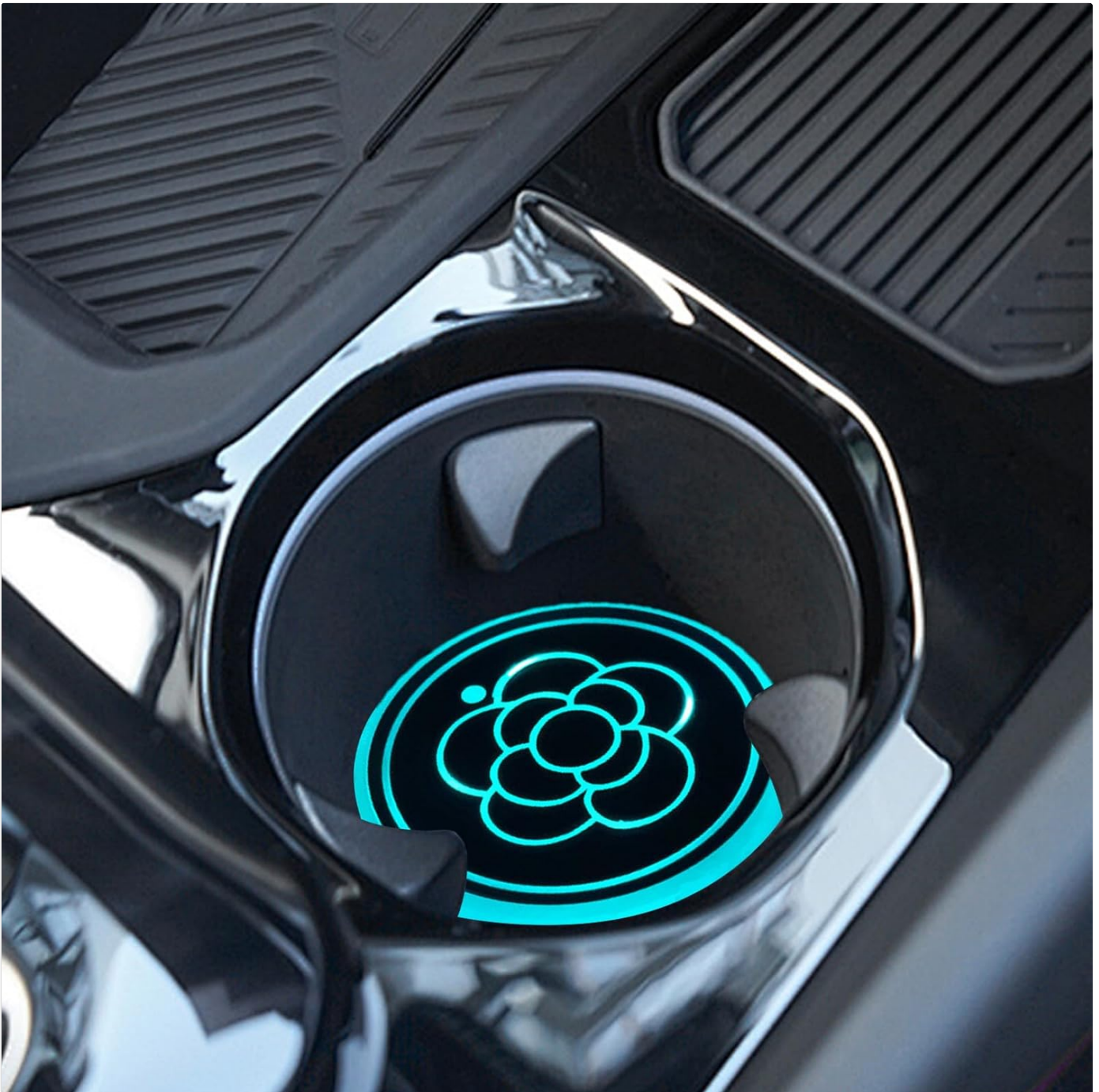
Figure 3: Proper placement of the LED cup holder light within a vehicle's cup holder.