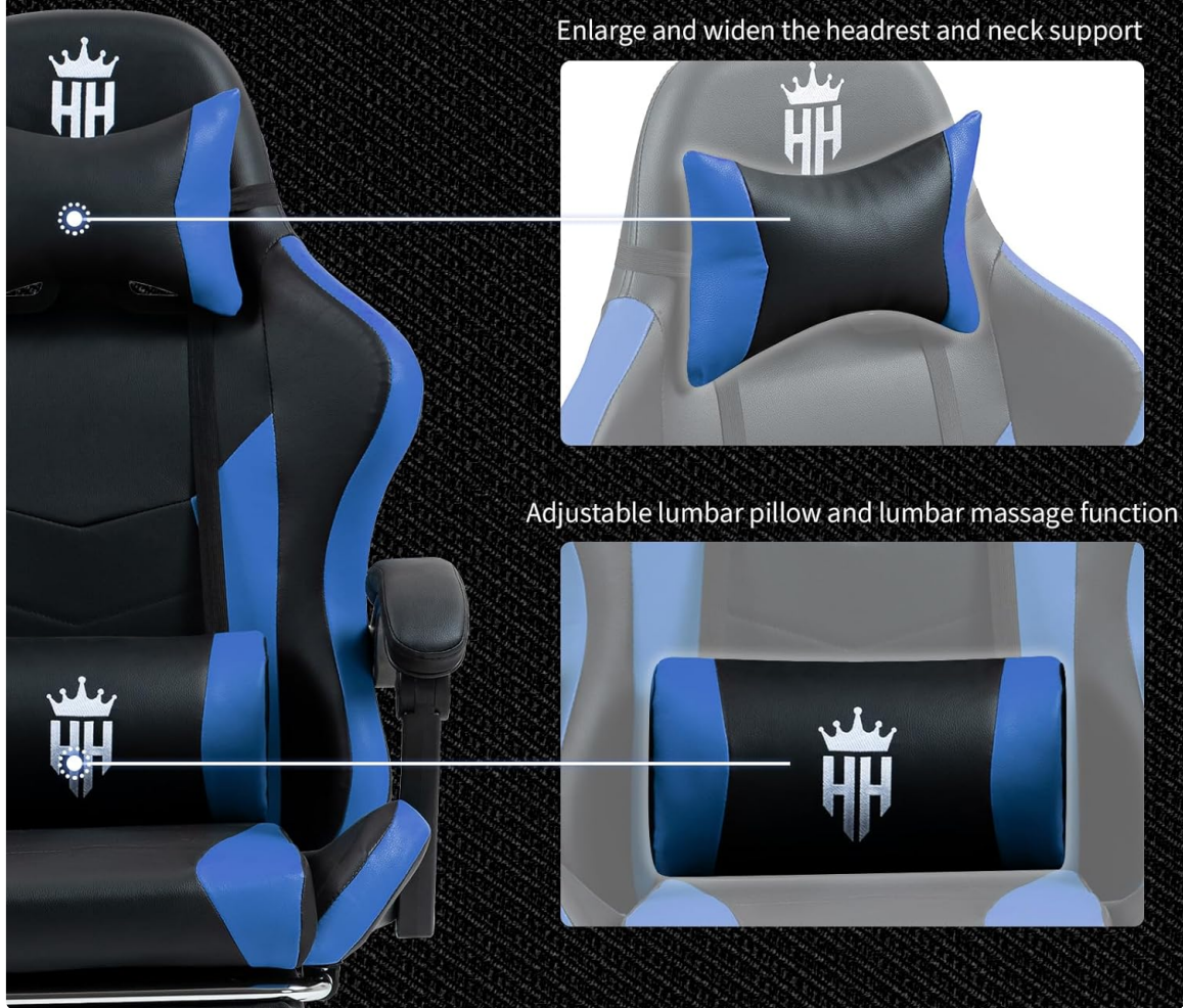
Image: Details of the adjustable headrest and lumbar pillow, showing how they can be positioned for optimal comfort and support.