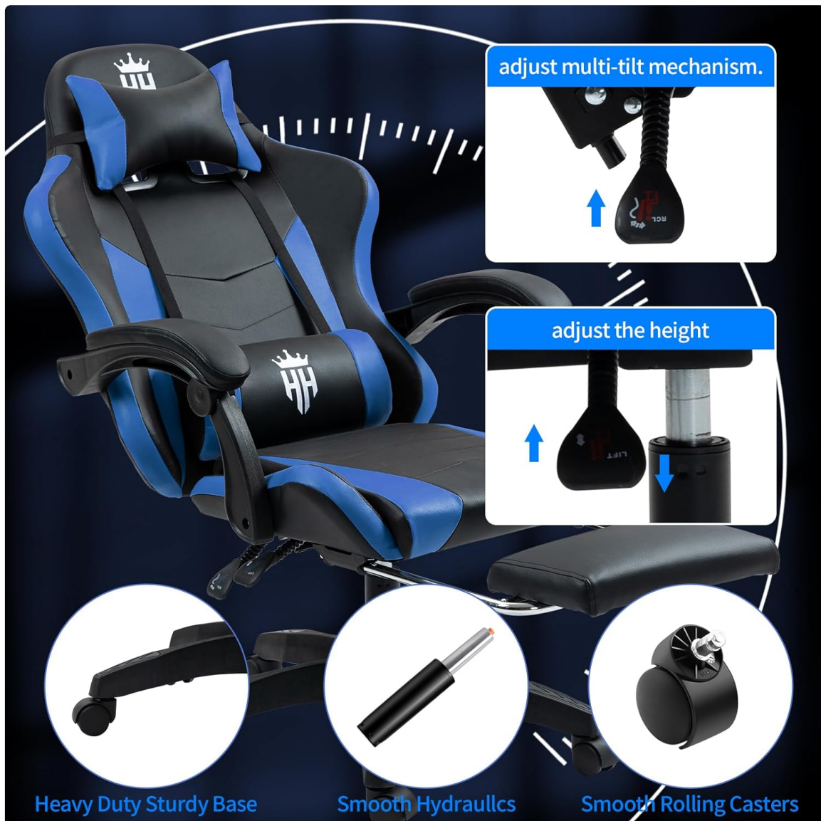
Image: Components for the chair's base, including the heavy-duty sturdy base, smooth hydraulics (gas lift), and smooth rolling casters, along with controls for multi-tilt and height adjustment.

Video: Detailed assembly guide for the Salutrobusto Gaming Chair, demonstrating each step from unboxing to final setup.