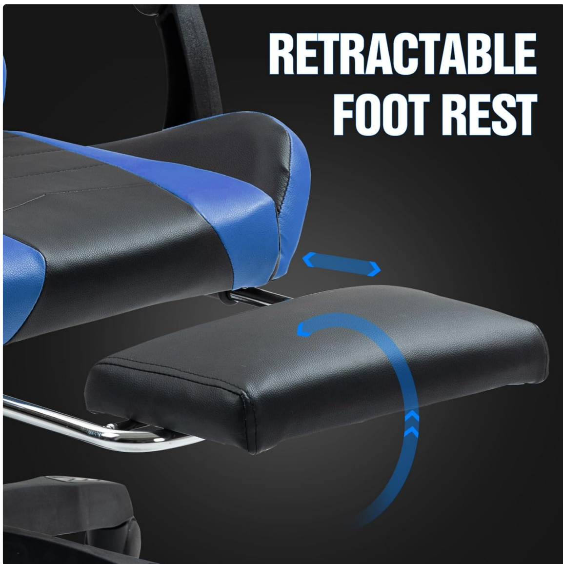
Image: Close-up of the retractable footrest extended from beneath the seat of the gaming chair.