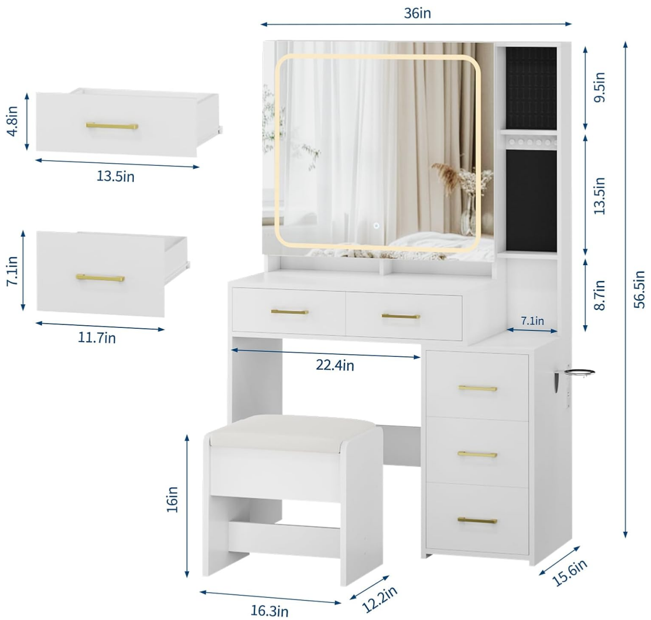
Image: Detailed dimensions of the Garvee Vanity Desk components, including drawers, mirror, and stool. This image assists in understanding the scale and fit of the vanity in your space.