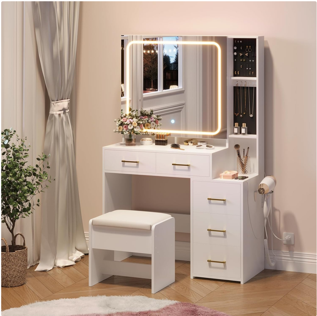
Image: A fully assembled Garvee Vanity Desk with its cushioned stool, showcasing its appearance in a typical bedroom environment.