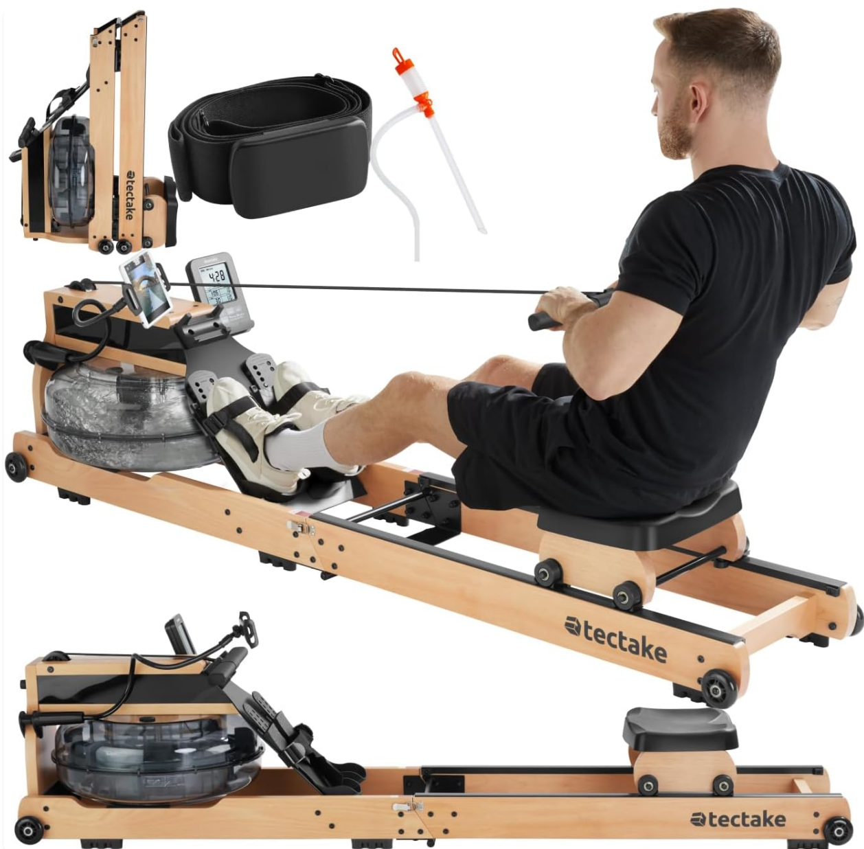
Image 1.1: The Tectake Titan XR2 Wooden Rowing Machine, demonstrating its use, foldable configuration, and included accessories.