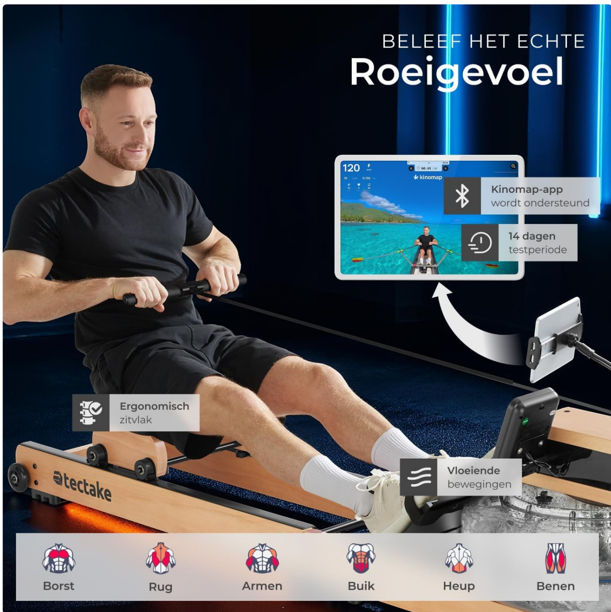
Image 5.2: User demonstrating proper rowing form with the Kinomap app displayed on a tablet, highlighting key features.