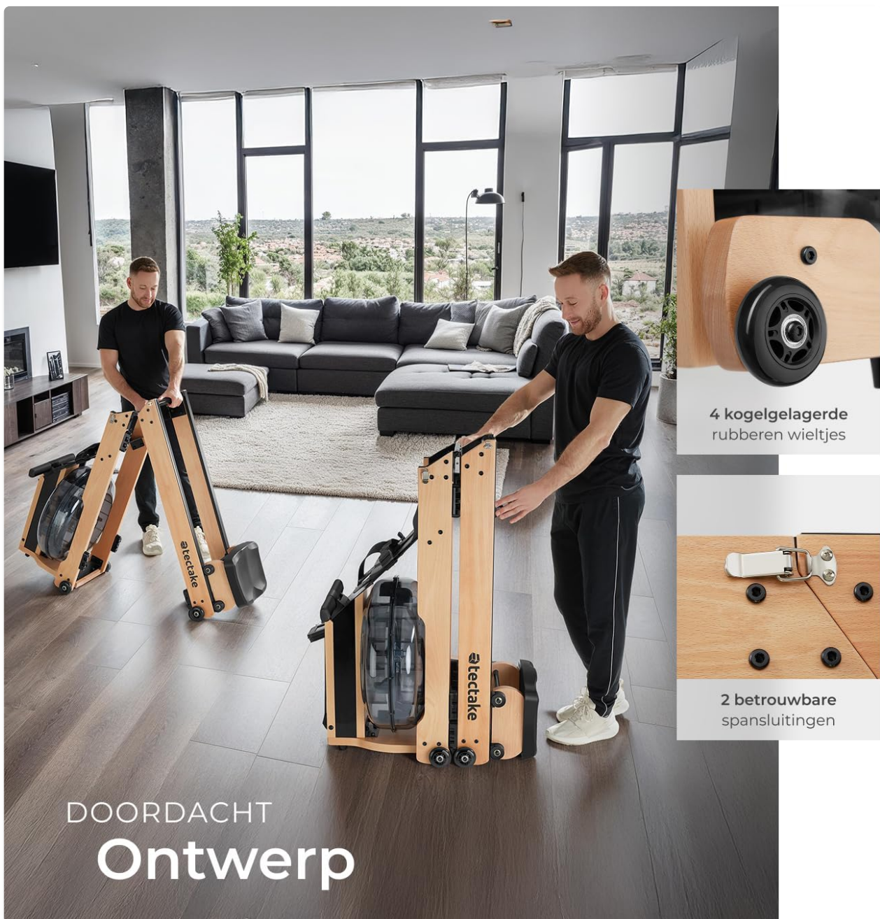
Image 7.1: Demonstration of the rowing machine's foldable design and transport wheels for convenient storage.