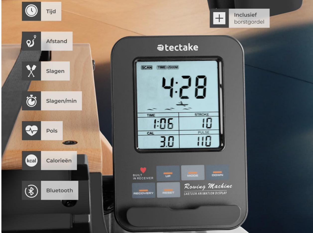
Image 5.1: The training computer display showing various workout data and the Bluetooth connectivity icon.