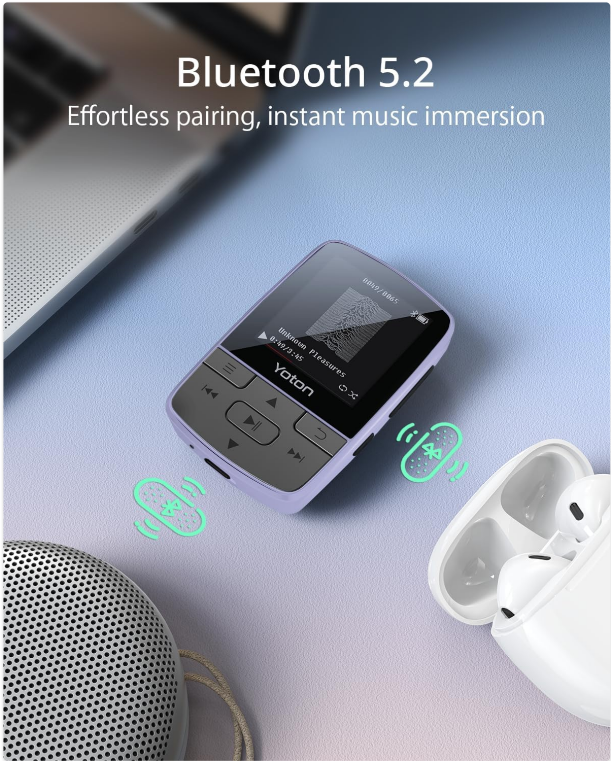
Figure 5: Bluetooth 5.2 Connectivity. This image shows the MP3 player connected wirelessly to earbuds, illustrating its Bluetooth capability.

Effortless pairing, instant music immersion