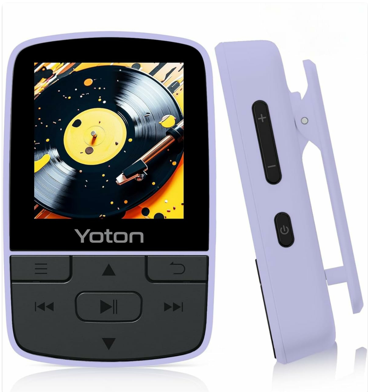
Figure 1: YOTON MP3 Player YM03. This image shows the front of the purple YOTON MP3 player, highlighting its screen and control buttons.