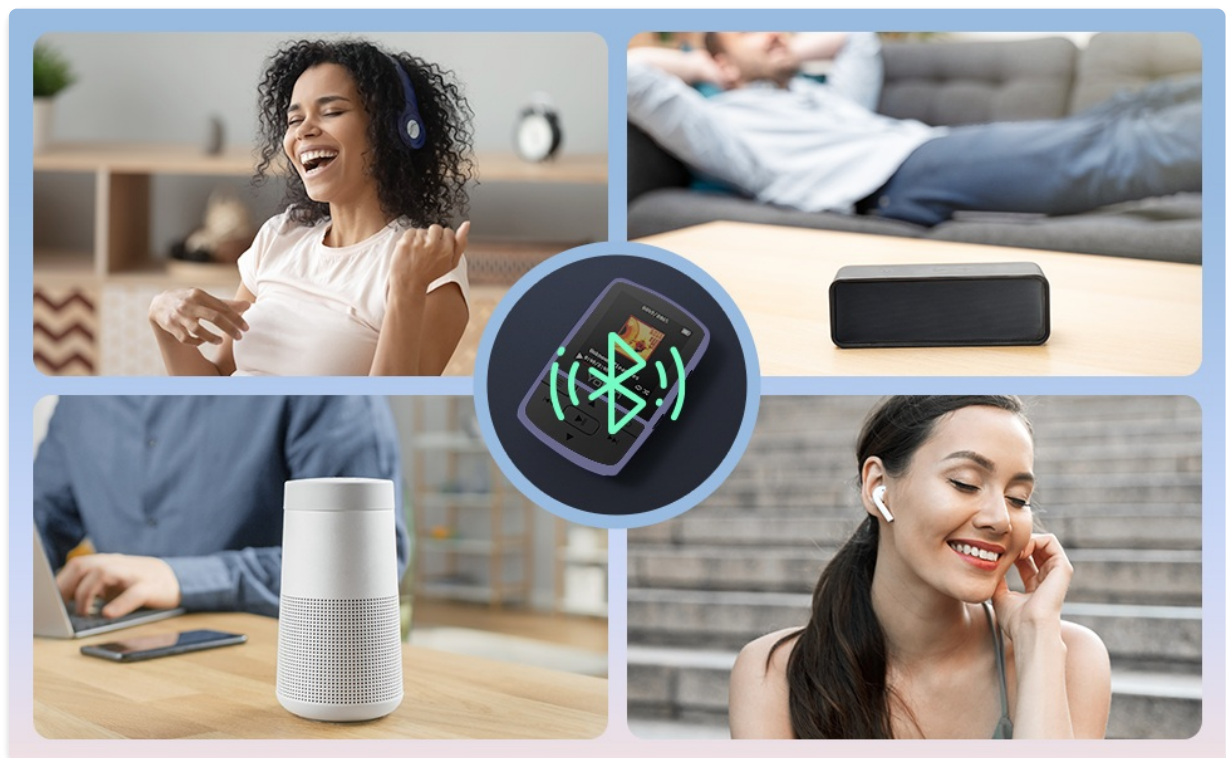
Figure 4: Hi-Fi Sound Quality. This image illustrates the MP3 player's capability for high-fidelity audio playback.