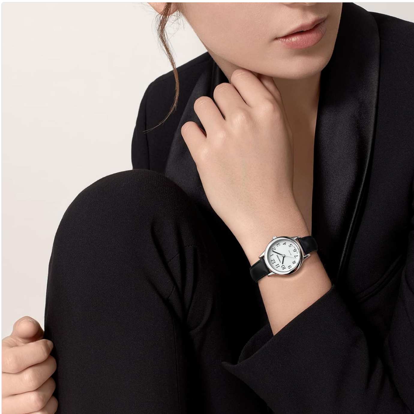
Image: A PINDOWS watch with a black leather strap worn on a wrist, demonstrating a comfortable fit.