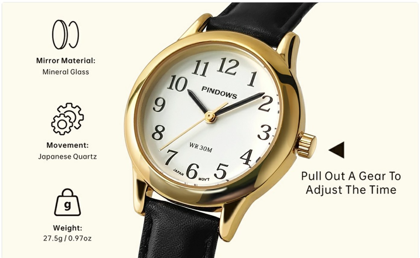
Image: A close-up view of the watch case highlighting the crown and an arrow indicating to pull it out for time adjustment.